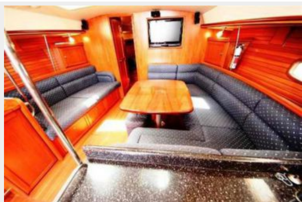
Hunter 50 AC Main Salon