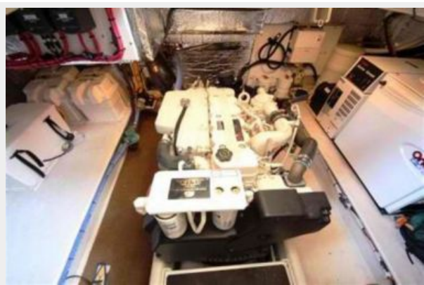
Nordic Tug 37 Spacious Engine Room