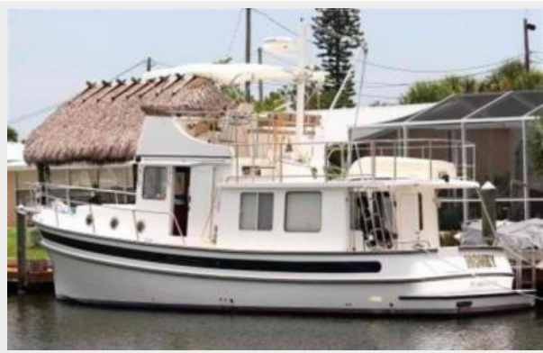
Nordic Tug 37 Profile