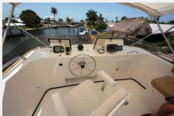
Nordic Tug 37 Upper Helm