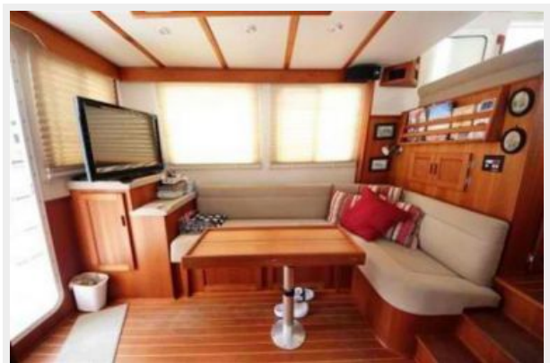
Nordic Tug 37 Main Salon Port Side