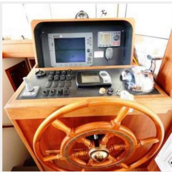
Nordic Tug 37 Lower Helm