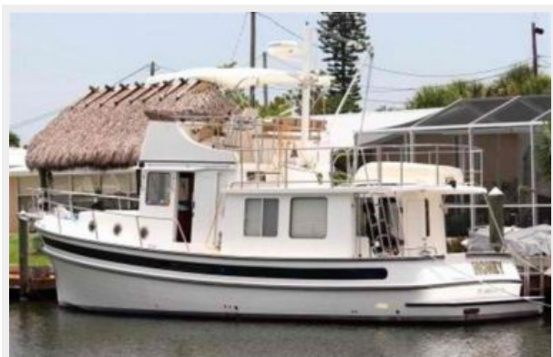
Nordic Tug 37 Profile