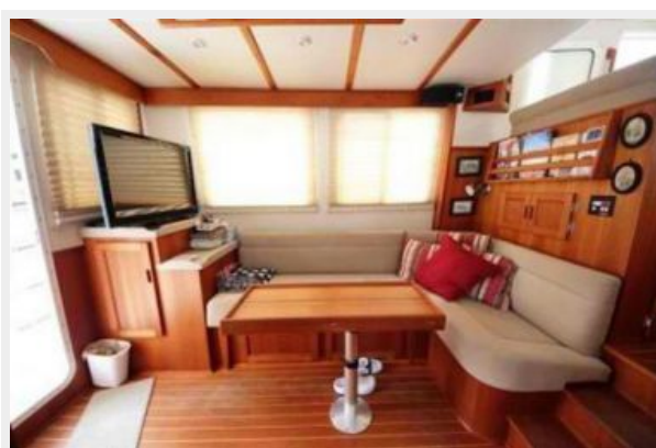
Nordic Tug 37 Main Salon Port Side