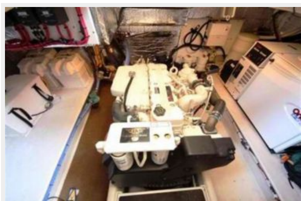
Nordic Tug 37 Spacious Engine Room