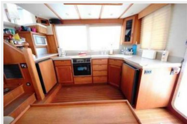
Nordic Tug 37 Main Galley