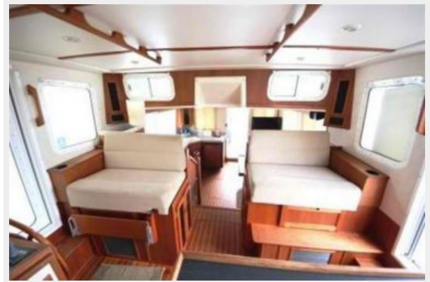
Nordic Tug 37 Pilot House Seating