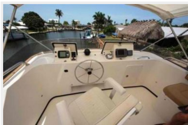
Nordic Tug 37 Upper Helm