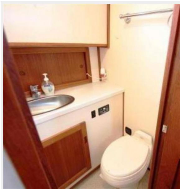
Nordic Tug 37 Head