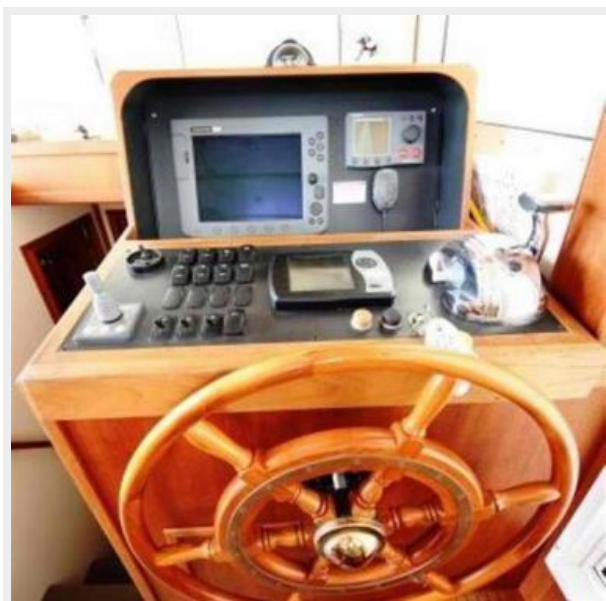
Nordic Tug 37 Lower Helm