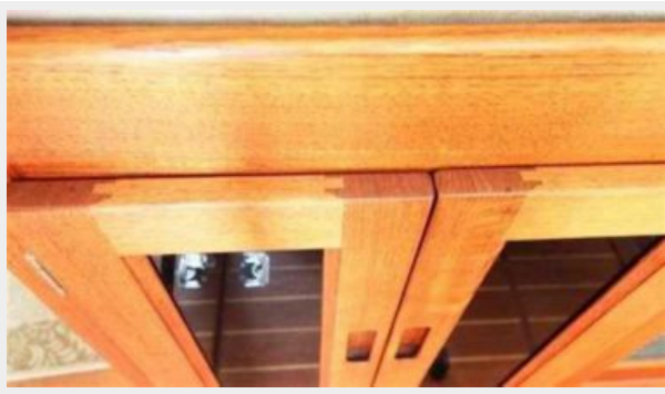
Nordic Tug 37 Quality Joinery Work