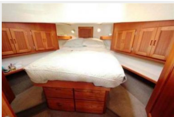
Nordic Tug 37 Owner's Stateroom