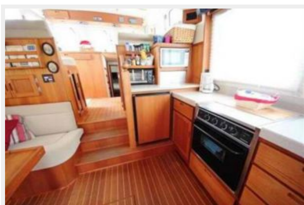
Nordic Tug 37 Main Salon Forward