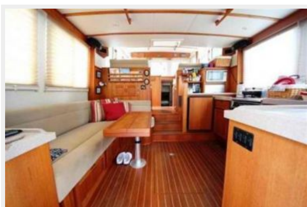
Nordic Tug 37 Main Salon