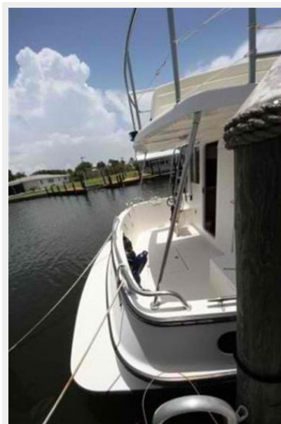
Nordic Tug 37 Aft Deck