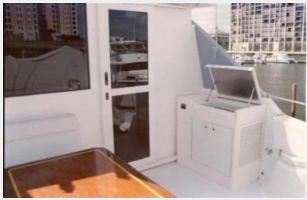
Aft Deck BBQ