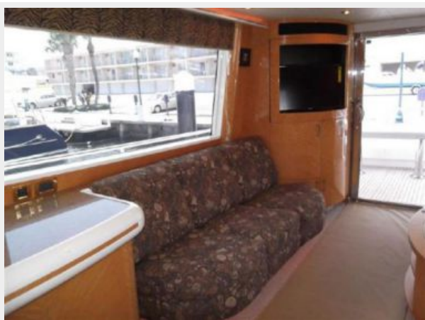
Starboard Salon and Entertainment Center