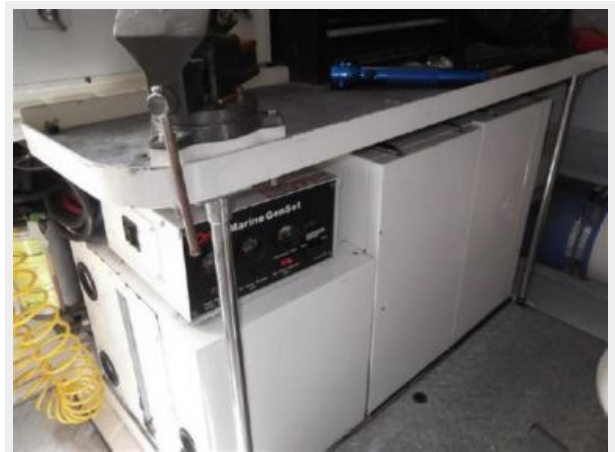
Port Onan Generator