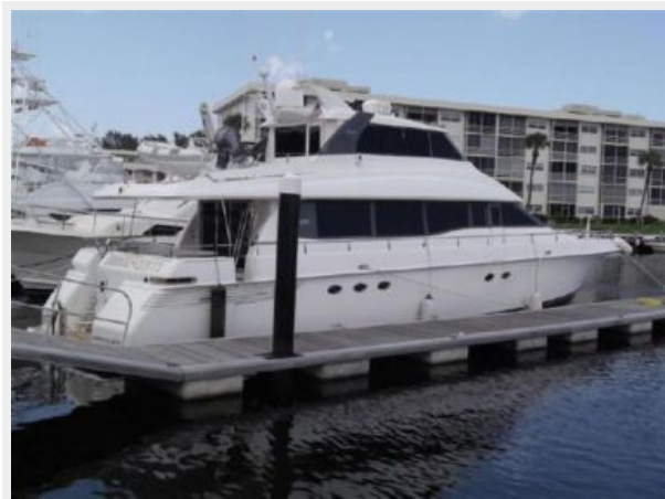
Serengeti at the Dock