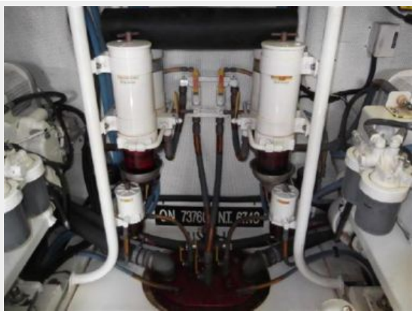
Racor Filters and Fuel Manifold