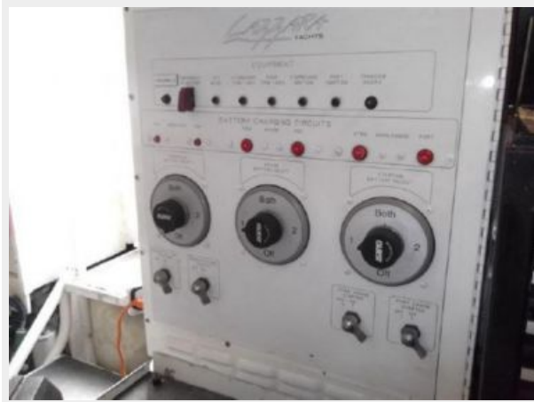
DC Battery Panel