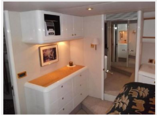
VIP view 2