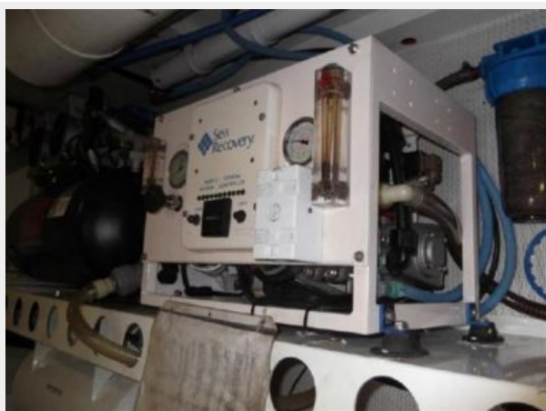
Sea Recovery Watermaker