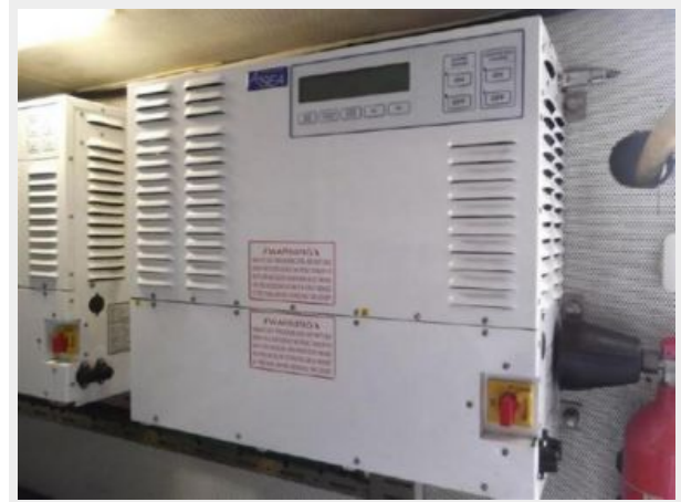
12 KW Shore Power Converters