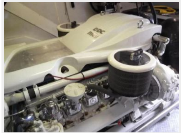
Starboard Engine view 2