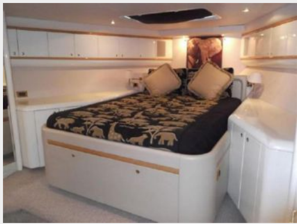
VIP Forward Guest/Crew