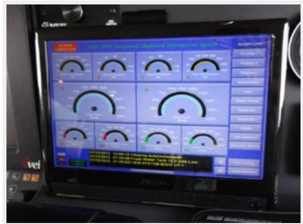
NEW ISIS System