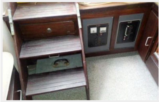
Easy access panel