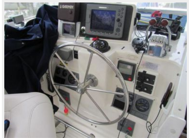
36' Endeavour helm photo 2