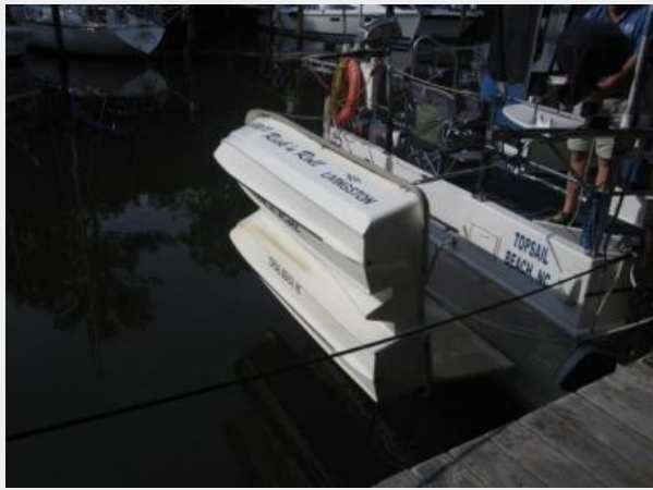
36' Endeavour tender photo 2