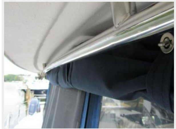
36' Endeavour exterior hand rails