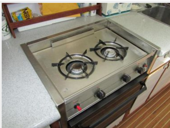
36' Endeavour galley photo1