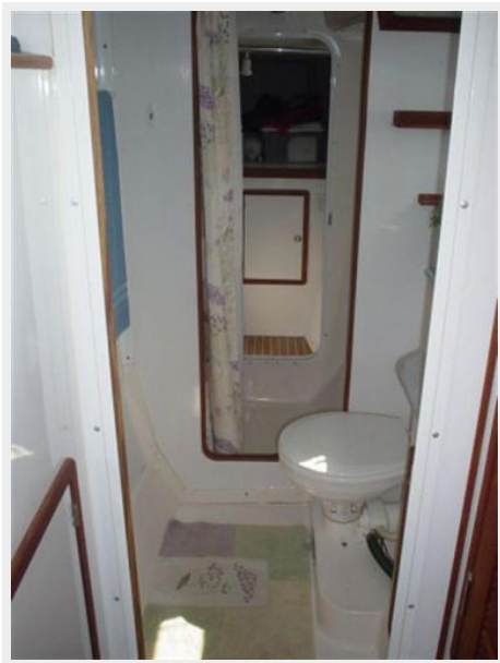
36' Endeavour head photo 1