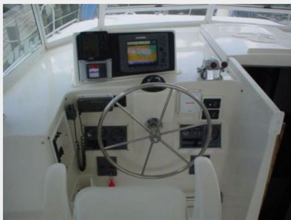
36' Endeavour helm