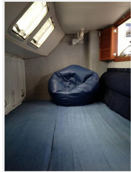
36' Endeavour aft stateroom