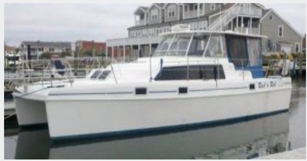
36' Endeavour port forward profile