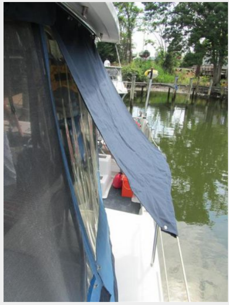
36' Endeavour cockpit enclosure