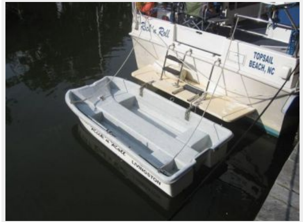
36' Endeavour tender photo 3