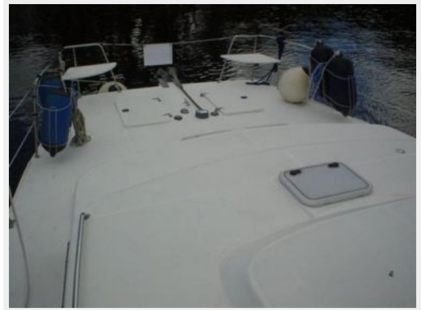
36' Endeavour foredeck