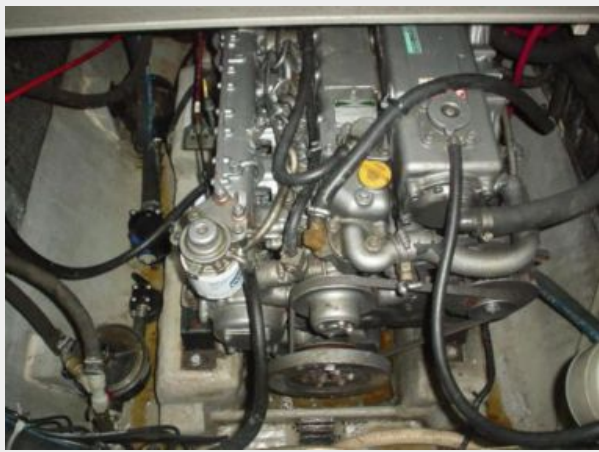
36' Endeavour port main engine