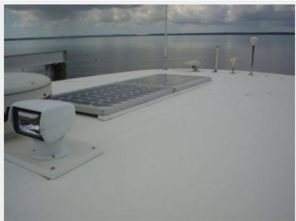
36' Endeavour solar panels