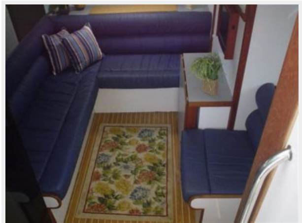
36' Endeavour salon