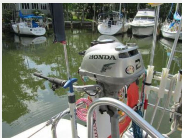
36' Endeavour tender outboard