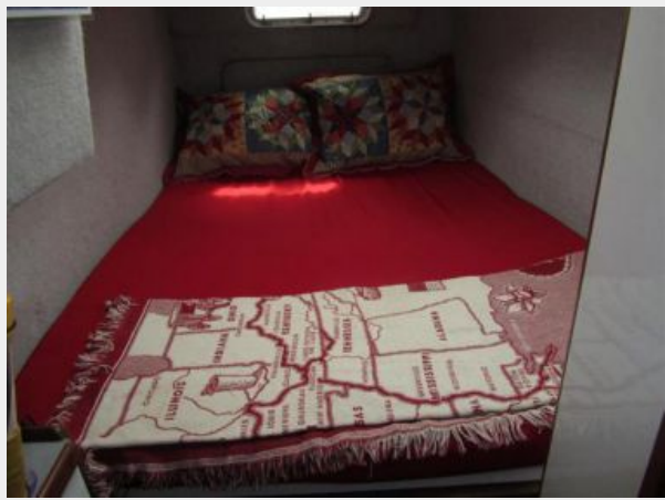
36' Endeavour port stateroom