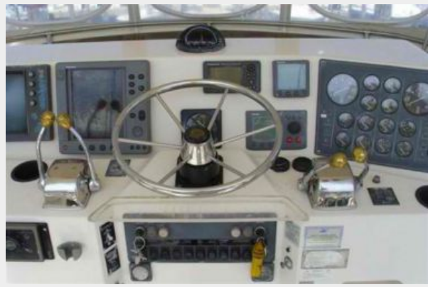
Helm On Flybridge