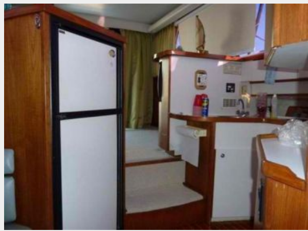
Full Size Refrigerator/Freezer