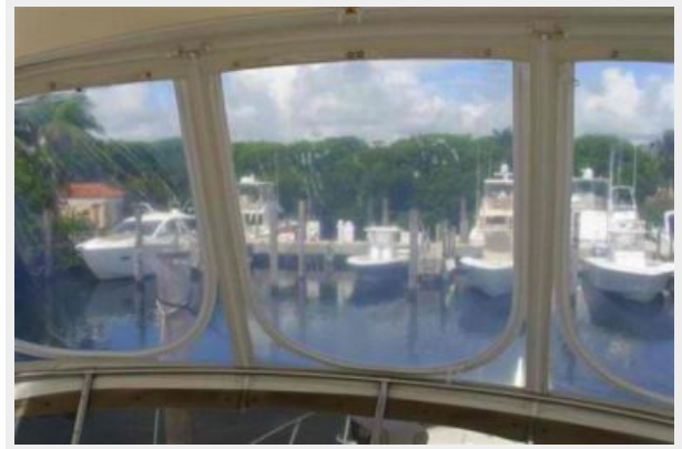
Front Windscreen With U Zips