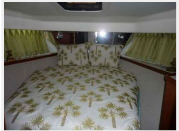
Owners Suite Queen Berth