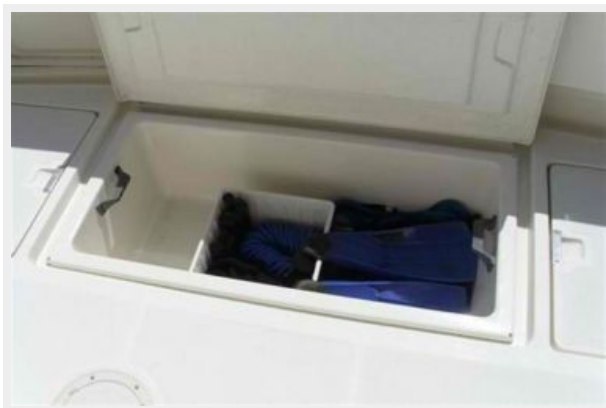
Aft Fish Box