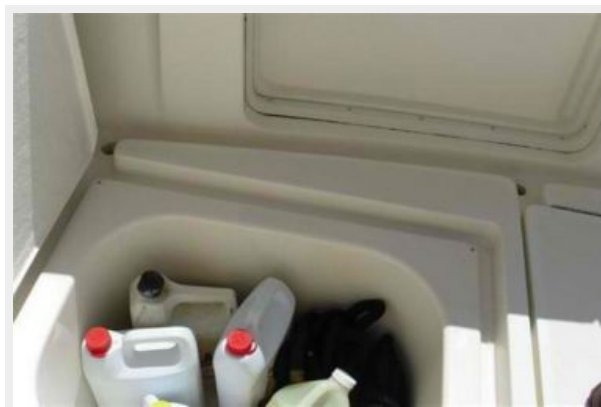
Storage Tank In Cockpit