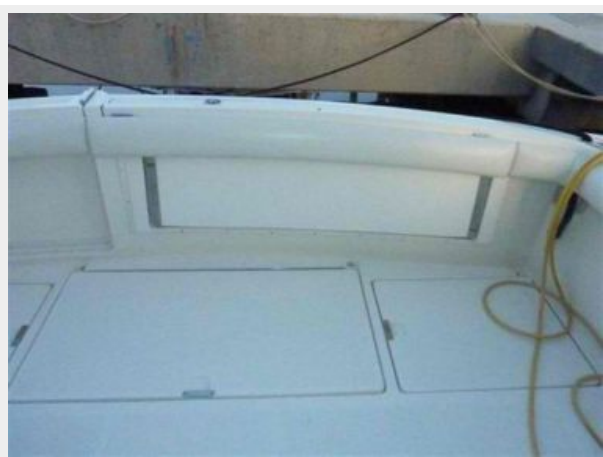
Flip Down Aft Seat