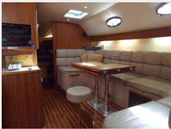
40' Tiara dinette looking forward