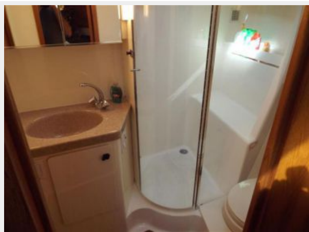
40' Tiara enclosed shower