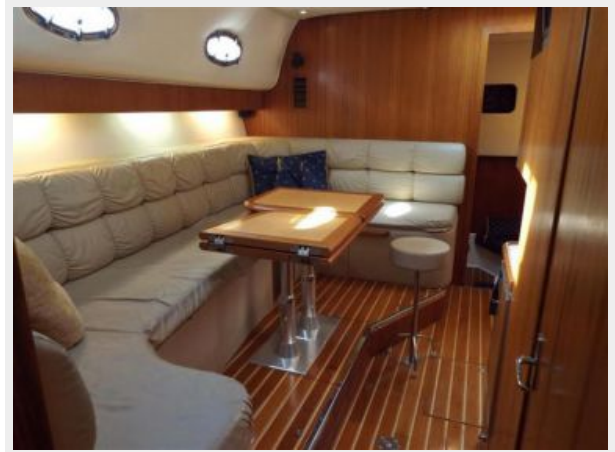
40' Tiara dinette looking aft