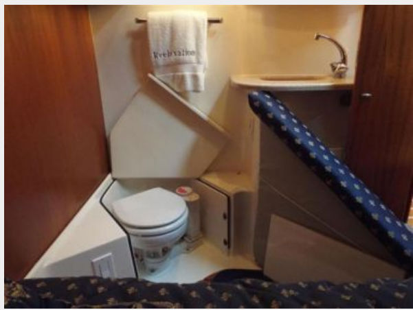
40' Tiara Mid-ship stateroom head