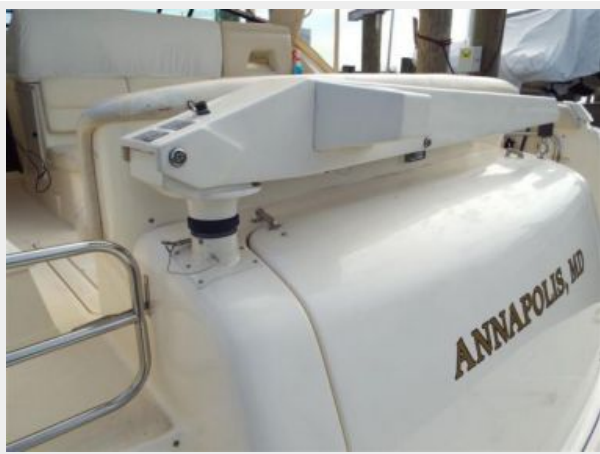
40' Tiara Nautical Structures davit