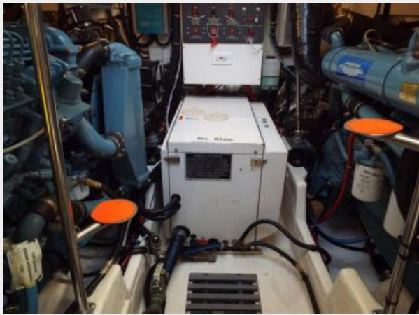
40' Tiara engine room forward