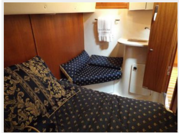
40' Tiara Mid-ship berth with vanity