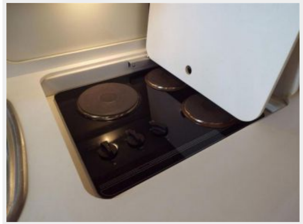
40' Tiara 3 burner electric cook top