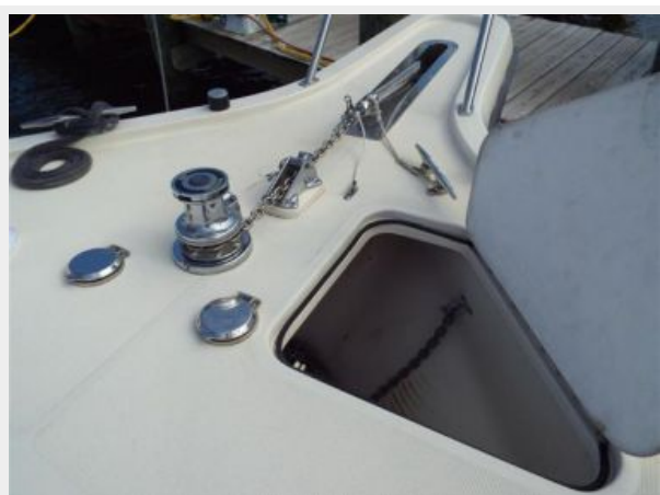
40' Tiara anchor windlass