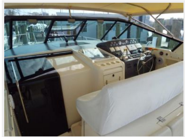
40' Tiara helm and bench seating for four