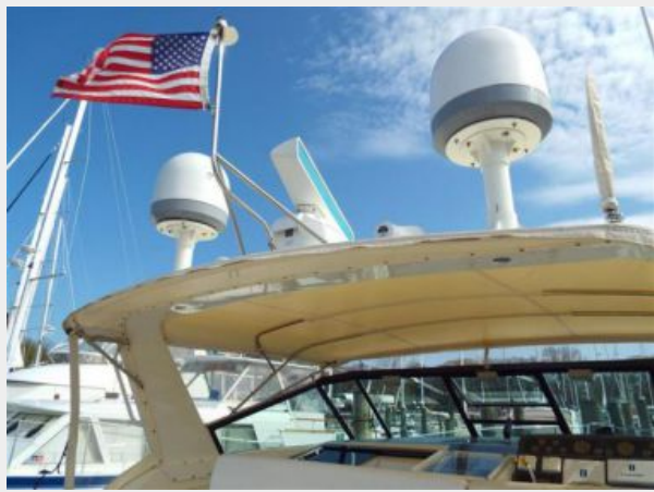
40' Tiara Radar arch