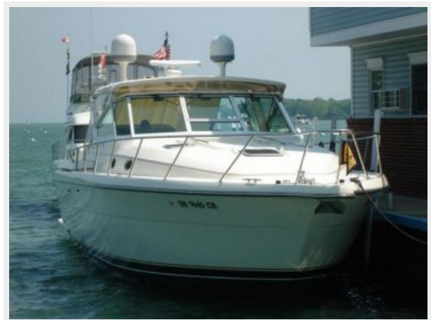
40' Tiara starboard bow