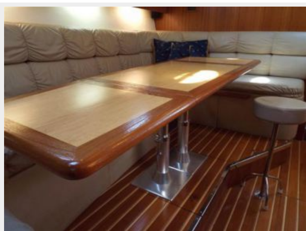
40' Tiara dinette table folded out