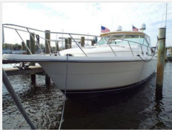
40' Tiara port forward profile