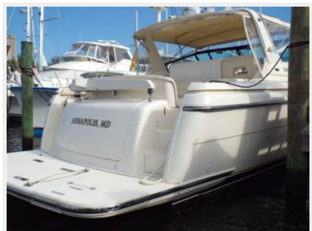
40' Tiara swimplatform