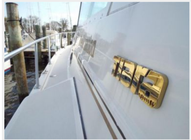
40' Tiara gelcoat looks like new