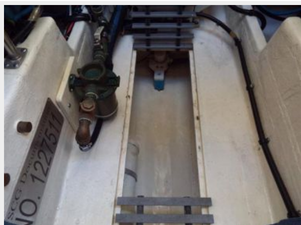
40' Tiara center line bilge