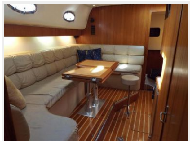
40' Tiara dinette looking aft