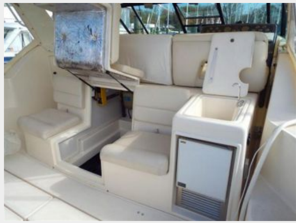
40' Tiara engine access and wetbar