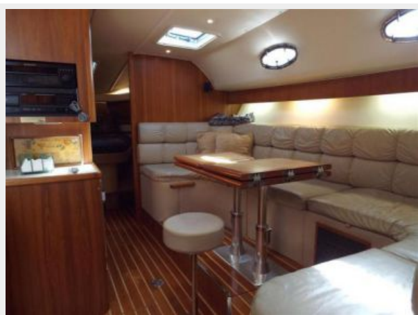
40' Tiara dinette looking forward