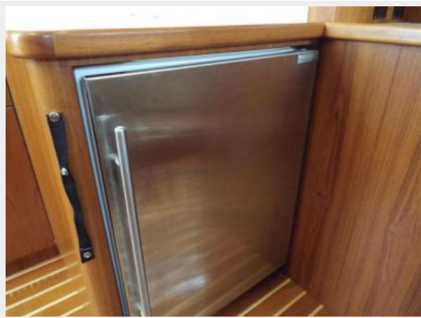
40' Tiara new '12 Sub-Zero refrigerator