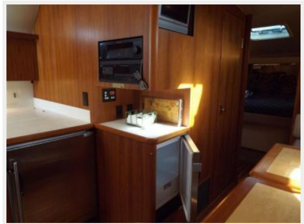
40' Tiara new '11 separate freezer