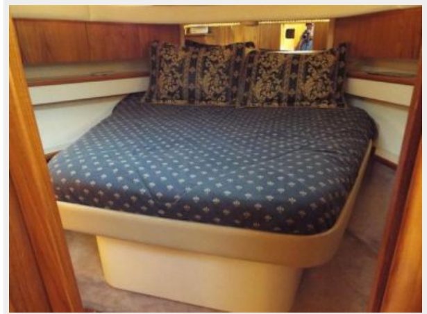
40' Tiara master forward from companionway