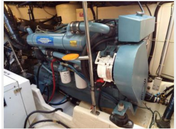
40' Tiara starboard engine