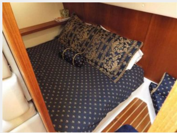
40' Tiara Mid-ship 2nd stateroom