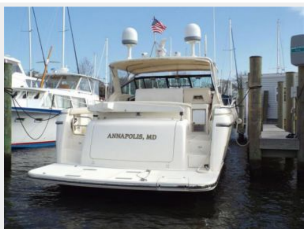
40' Tiara aft profile