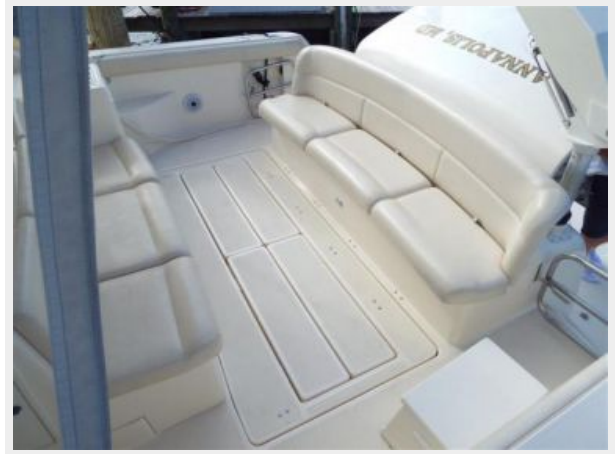
40' Tiara aft seating