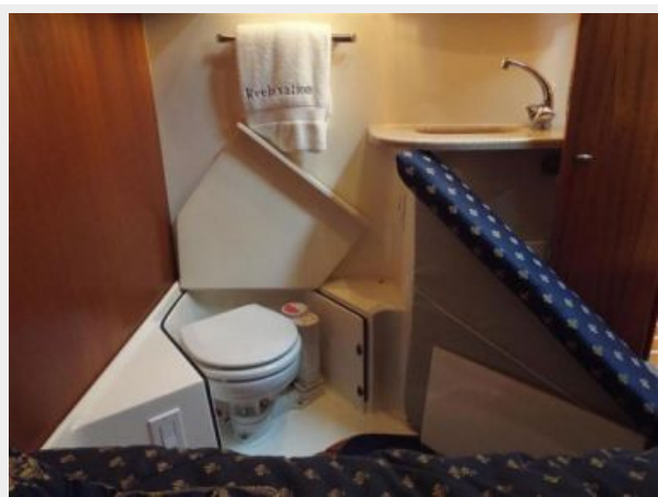
40' Tiara Mid-ship stateroom head