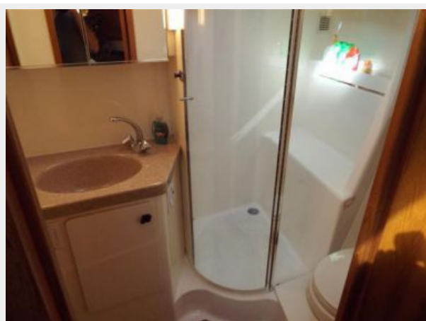
40' Tiara enclosed shower