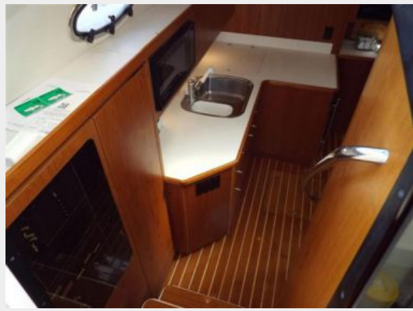
40' Tiara bridge deck down into saloon