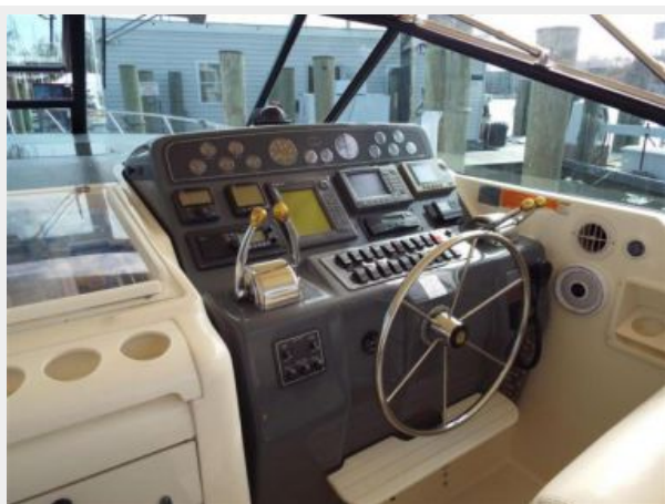
40' Tiara helm area