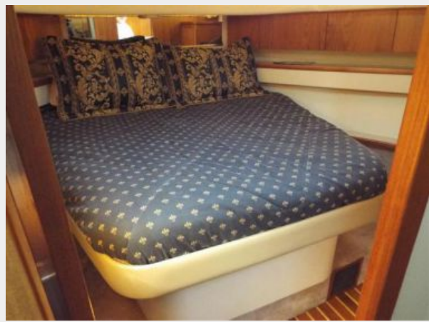
40' Tiara master berth from port side