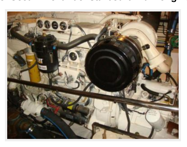
55' Ocean Alexander sea strainer