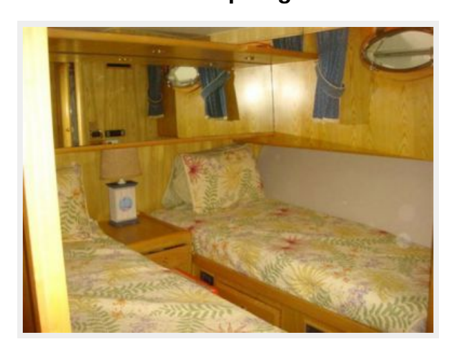
55' Ocean Alexander port guest stateroom