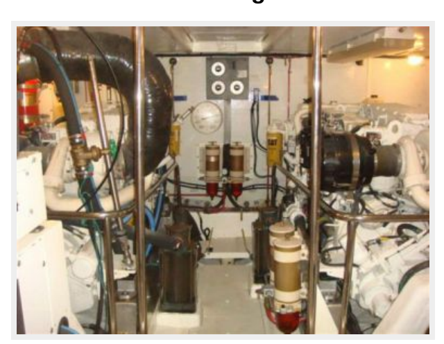
55' Ocean Alexander engine room forward