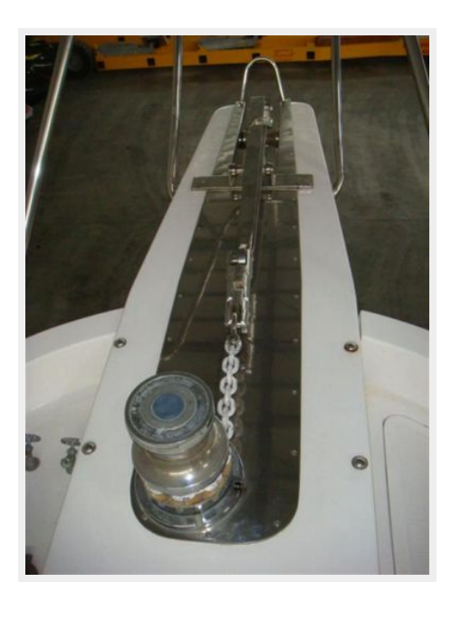
55' Ocean Alexander anchor windlass