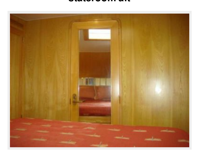
55' Ocean Alexander forward guest stateroom aft