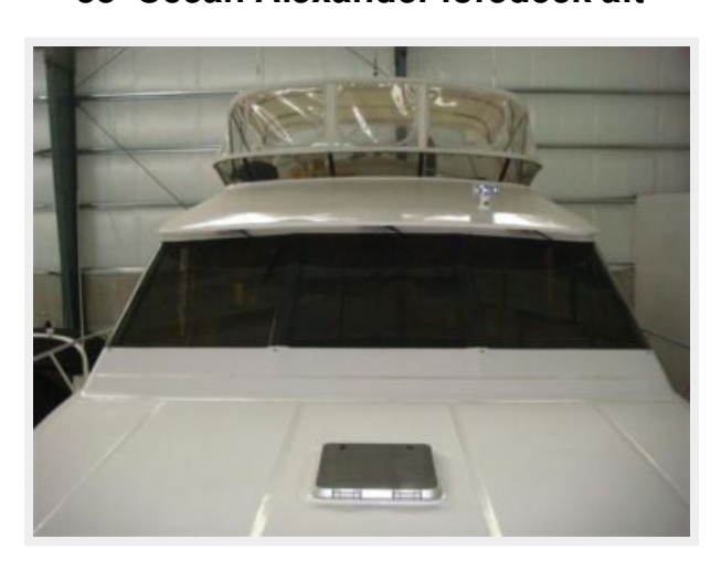
55' Ocean Alexander foredeck aft