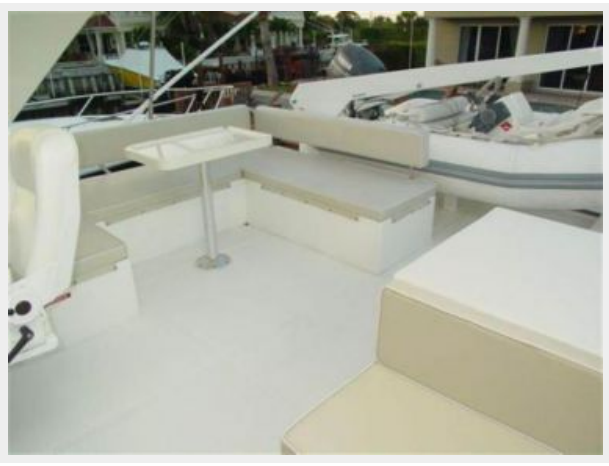
55' Ocean Alexander flybridge aft