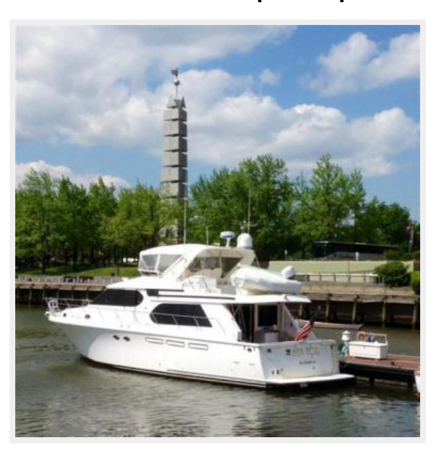
55' Ocean Alexander port aft profile