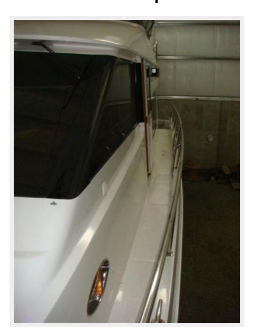
55' Ocean Alexander port side deck