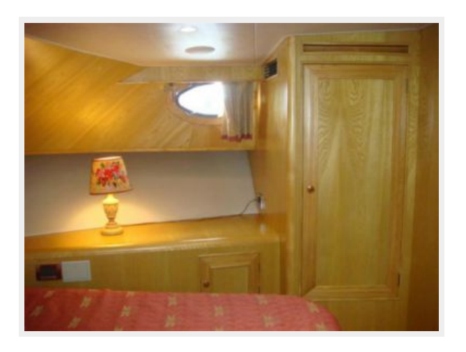
55' Ocean Alexander forward guest stateroom starboard