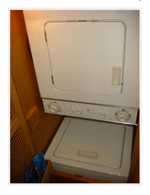
55' Ocean Alexander washer-dryer