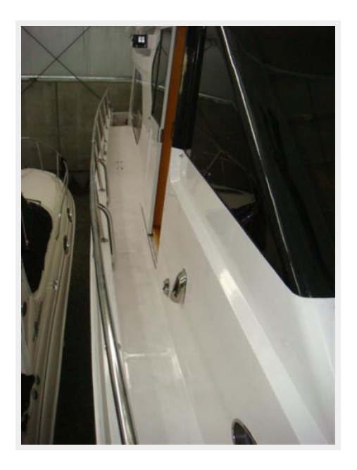
55' Ocean Alexander starboard side deck