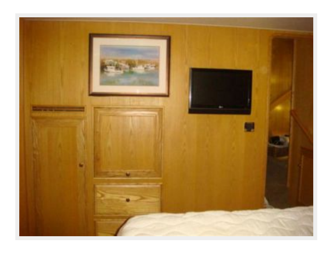
55' Ocean Alexander forward guest stateroom