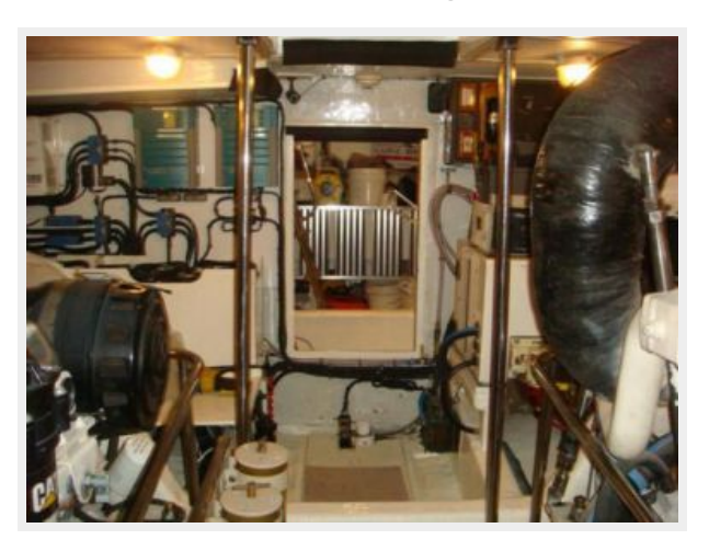
55' Ocean Alexander engine room aft