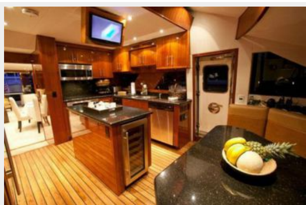
Galley Seating Area