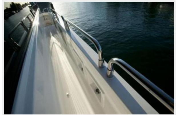
Outdoor Walk Around