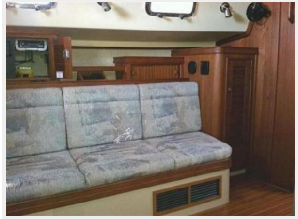
Salon - Settee -Port side