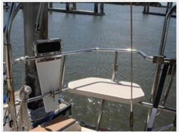
Aft railing seat