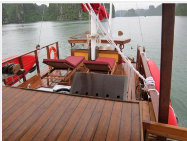
Sun Deck and BBQ