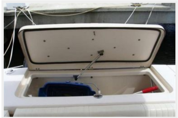
Transom Fish Box