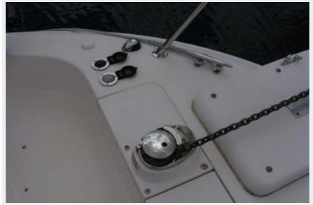
Windlass With Switches