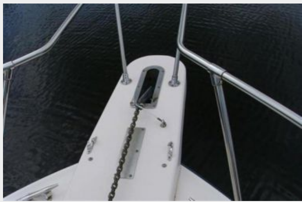
Fiberglass Bow Pulpit With Anchor/Roller