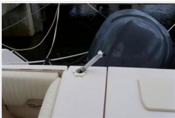
Swim Platform Fresh Water Shower