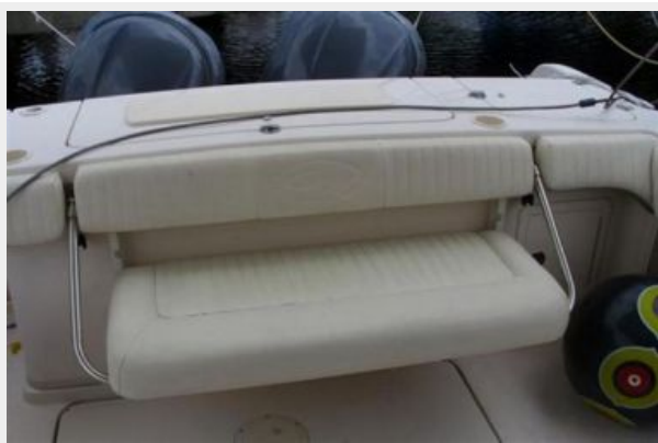
Aft Cockpit Seat