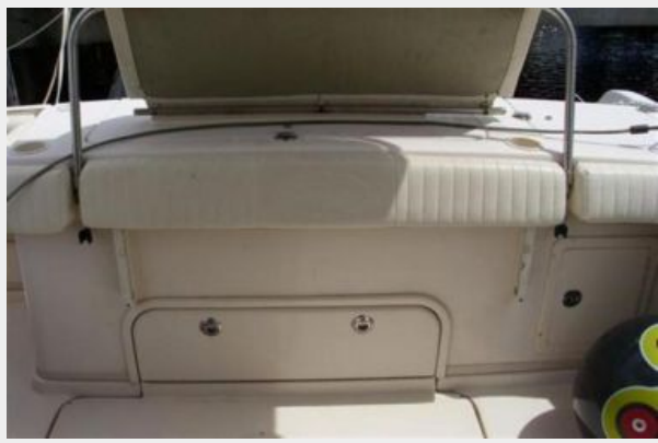
Aft Cockpit Seat Access to Generator