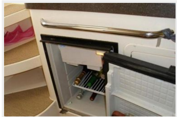
Refrigerator With Freezer Compartment