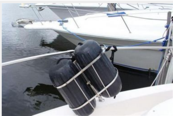
Fender Holders P And S