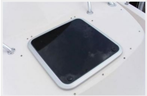
Bomar Deck Hatch With Lexan Lens