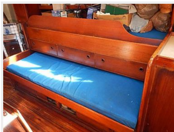
38' Le Comte Northeast salon seating