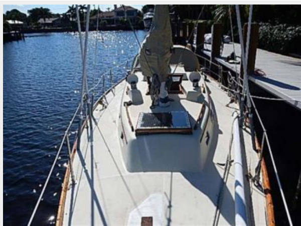
38' Le Comte Northeast foredeck aft