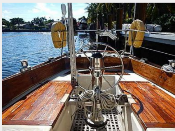
38' Le Comte Northeast cockpit aft