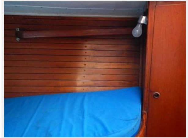
38' Le Comte Northeast stateroom starboard