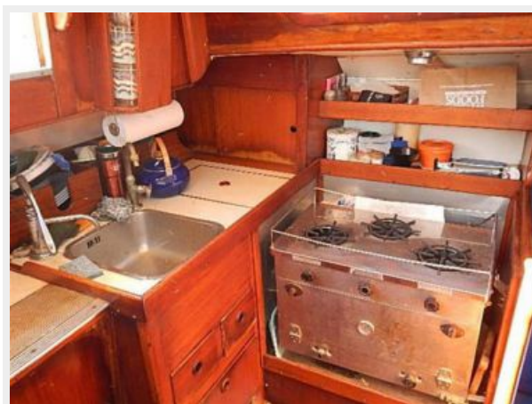
38' Le Comte Northeast galley