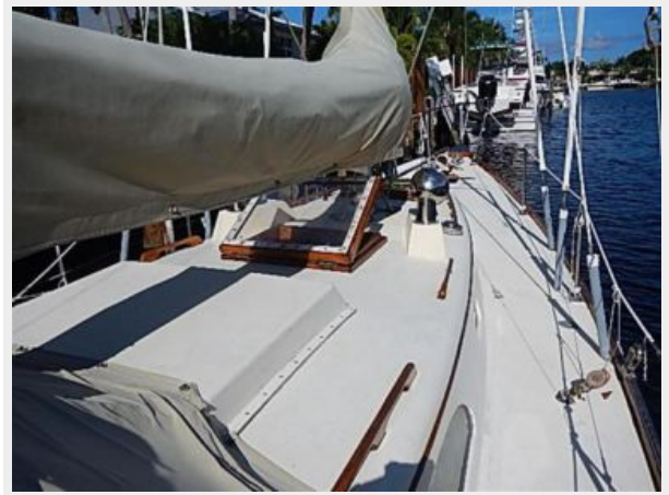
38' Le Comte Northeast foredeck