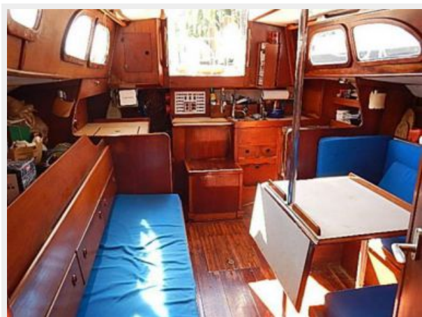
38' Le Comte Northeast salon aft