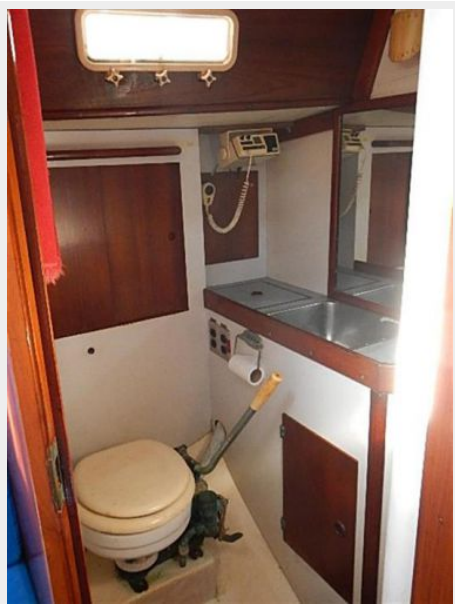
38' Le Comte Northeast head