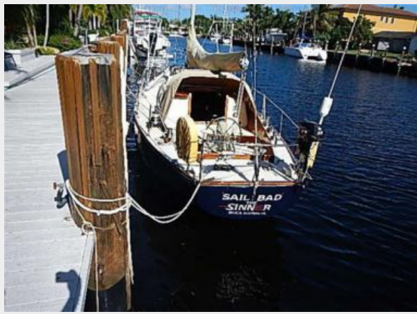
38' Le Comte Northeast aft profile