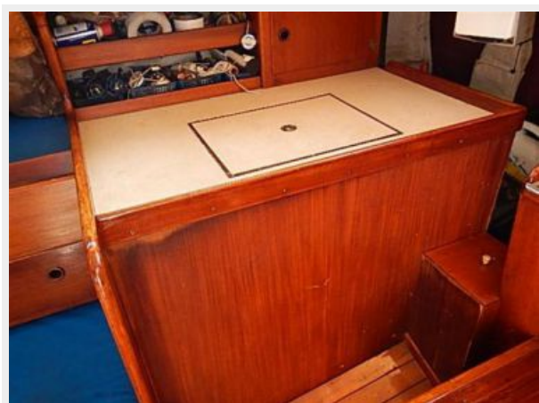
38' Le Comte Northeast refrigeration