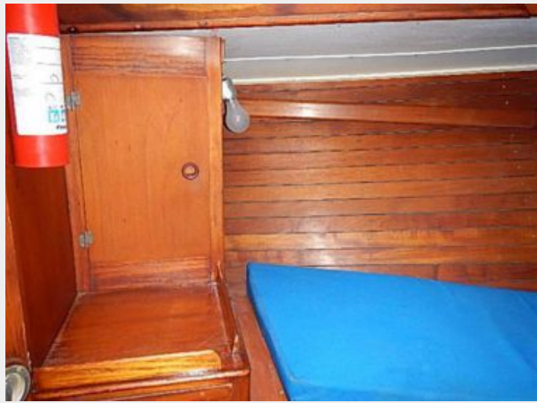
38' Le Comte Northeast stateroom port