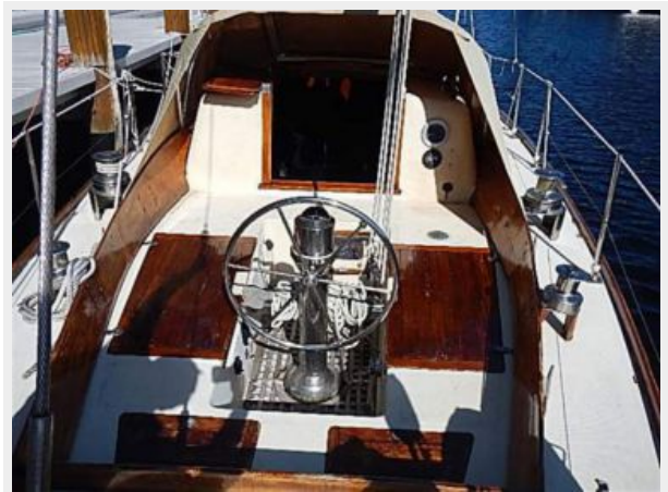
38' Le Comte Northeast cockpit forward