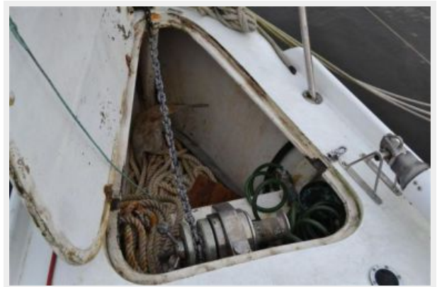
58' Farr Custom Windlass