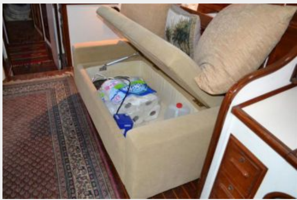
58' Farr Custom Love seat storage