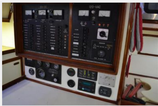
58' Farr Custom Electric panel