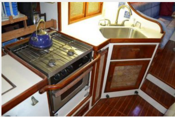
58' Farr Custom Galley