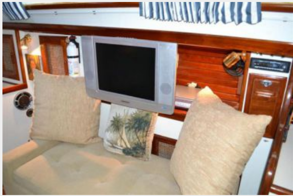
58' Farr Custom TV