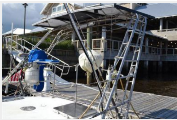
58' Farr Custom Solar panels