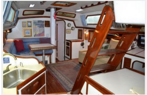
58' Farr Custom looking fwd to stb