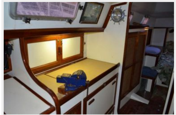
58' Farr Custom Work Bench Area