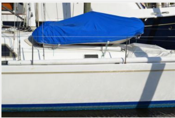
58' Farr Custom Side profile dingy storage