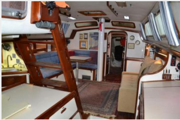
58' Farr Custom Looking fwd to port