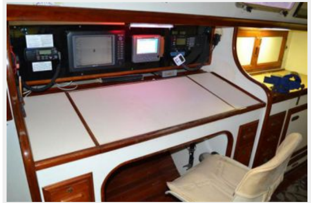
58' Farr Custom Nav Station