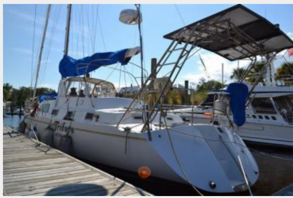
58' Farr Custom Port Stern