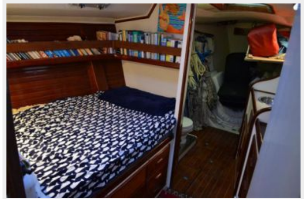
58' Farr Custom Guest looking fwd