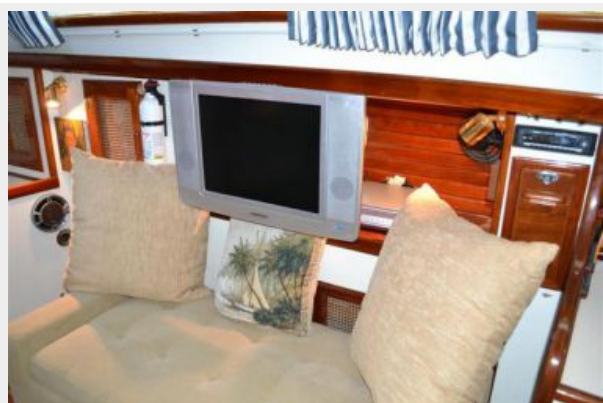
58' Farr Custom TV