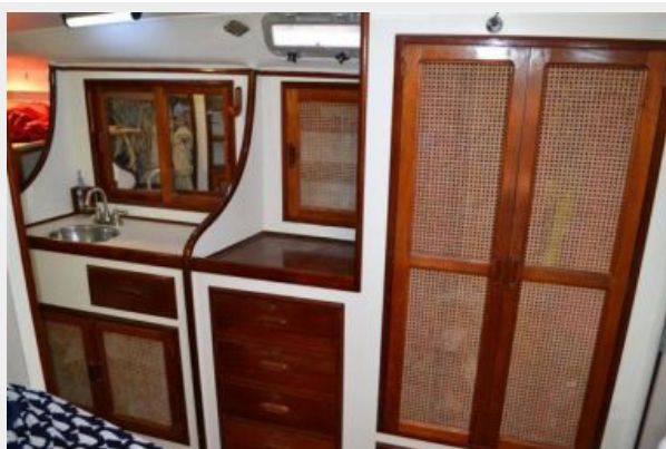
58' Farr Custom Guest stb side