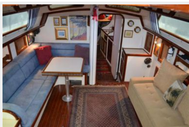
58' Farr Custom Salon