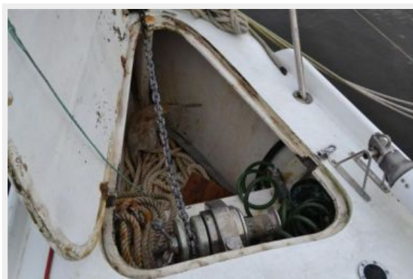
58' Farr Custom Windlass