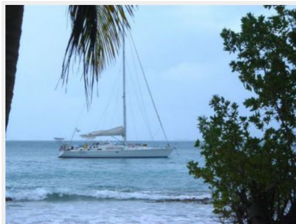
58' Farr Custom Island Time