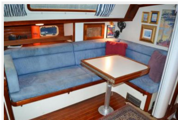
58' Farr Custom Settee table closed