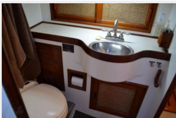
58' Farr Custom Master head