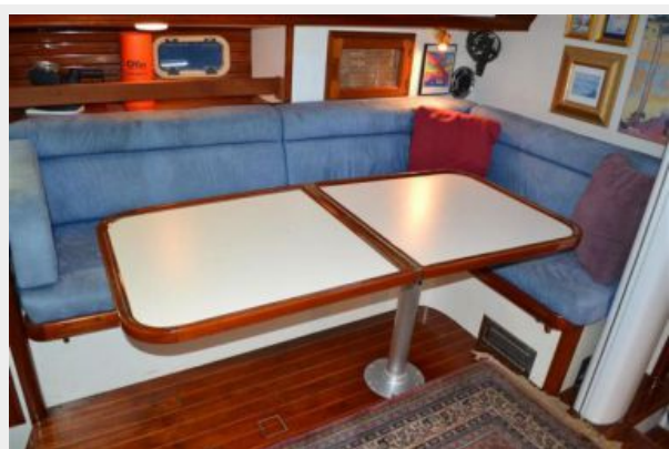
58' Farr Custom Settee table open