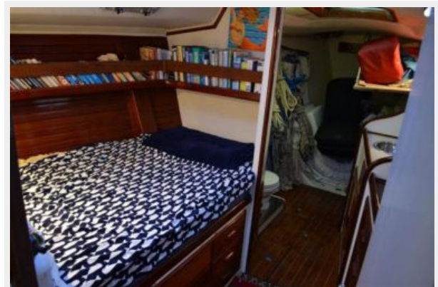
58' Farr Custom Guest looking fwd