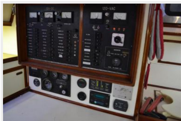
58' Farr Custom Electric panel