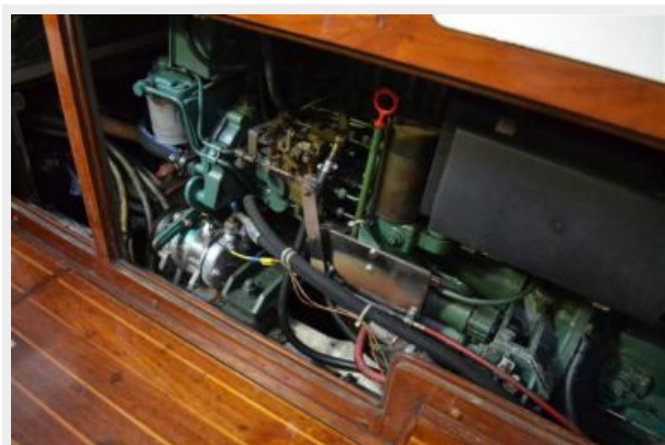
58' Farr Custom Engine- stb side