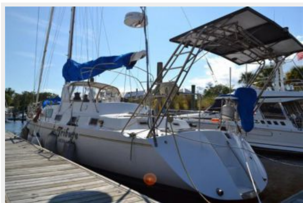
58' Farr Custom Port Stern