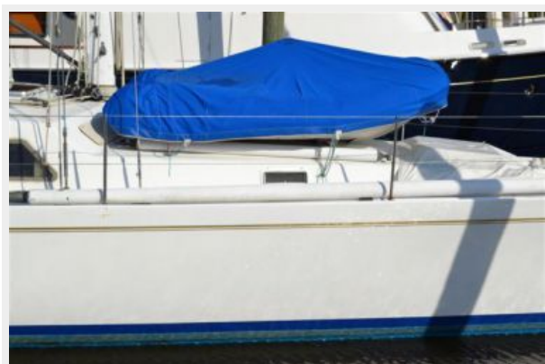
58' Farr Custom Side profile dingy storage