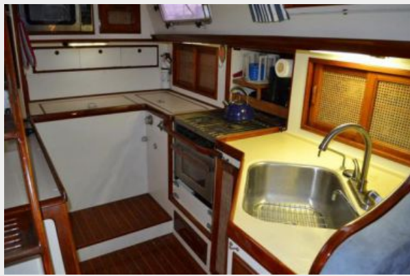
58' Farr Custom Galley