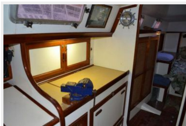
58' Farr Custom Work Bench Area