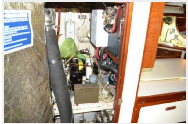
58' Farr Custom Charger/Inverter closet