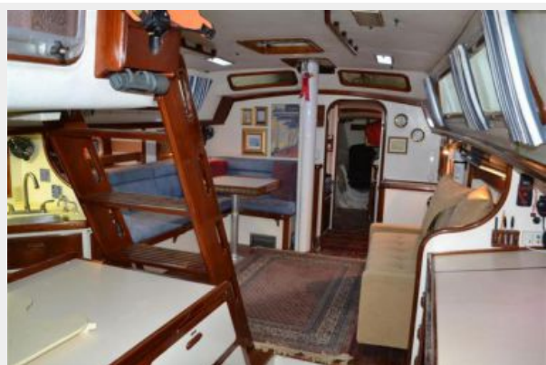
58' Farr Custom Looking fwd to port