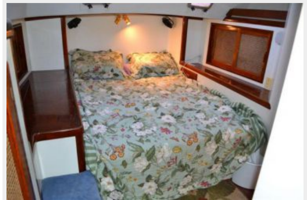
58' Farr Custom Master berth