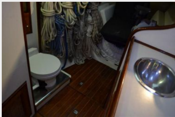
58' Farr Custom Fwd toilet & sink