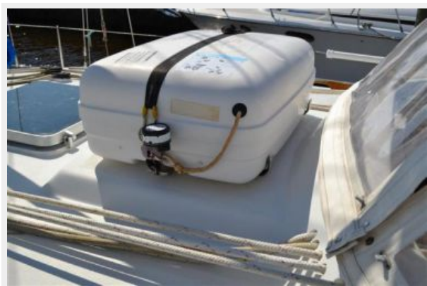
58' Farr Custom Raft