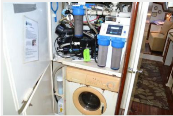
58' Farr Custom Washer/dryer