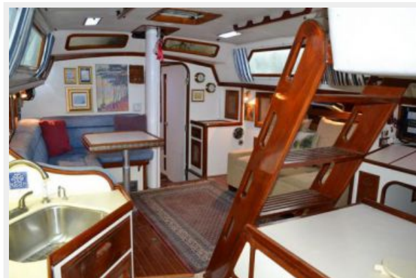
58' Farr Custom looking fwd to stb