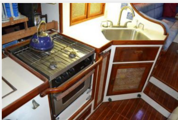
58' Farr Custom Galley