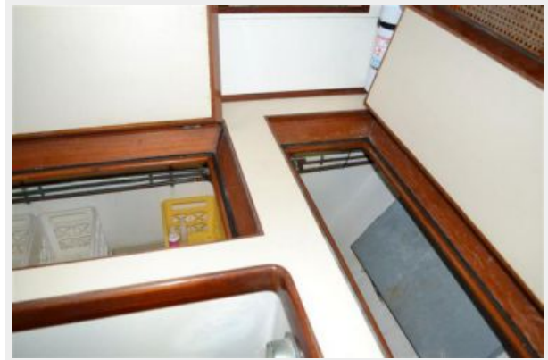
58' Farr Custom Refrigerator/Freezer