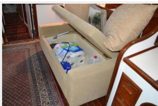
58' Farr Custom Love seat storage