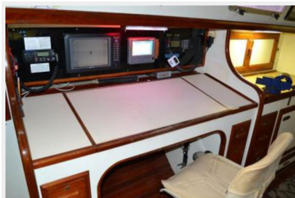
58' Farr Custom Nav Station