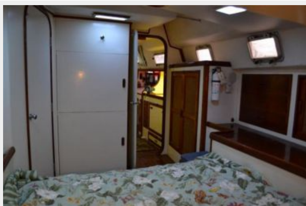
58' Farr Custom Master looking fwd