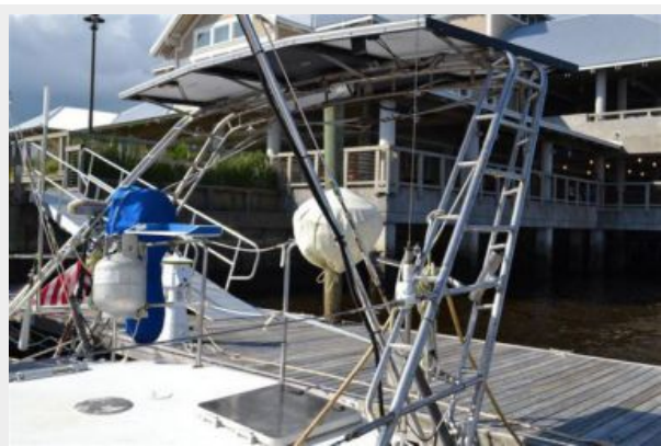
58' Farr Custom Solar panels