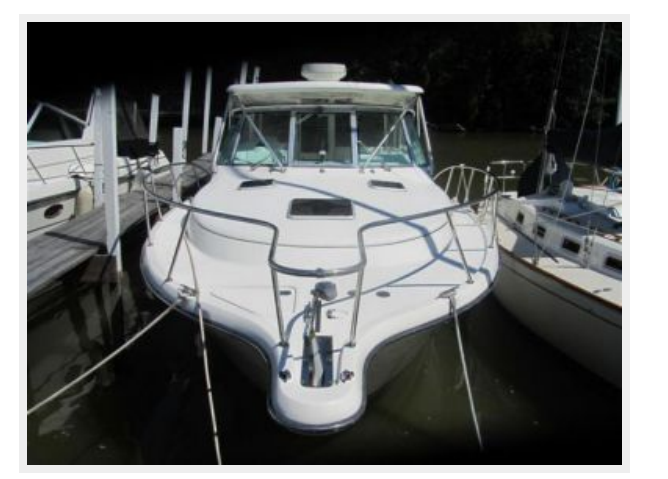
34' Pursuit Bow view