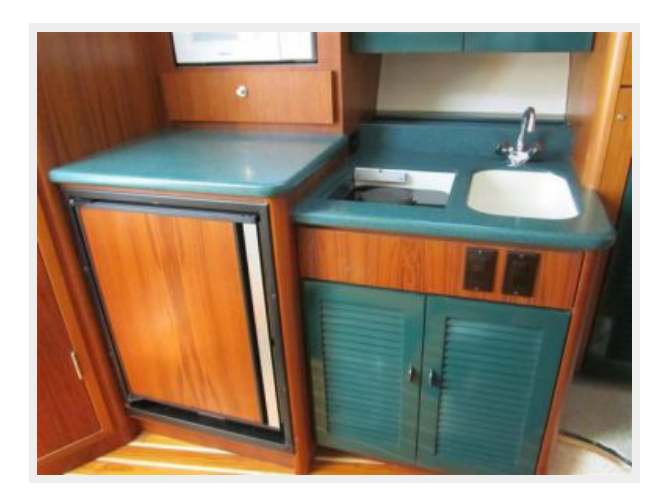
34' Pursuit Galley