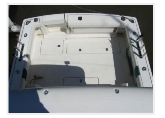
34' Pursuit Aft cockpit from hard top