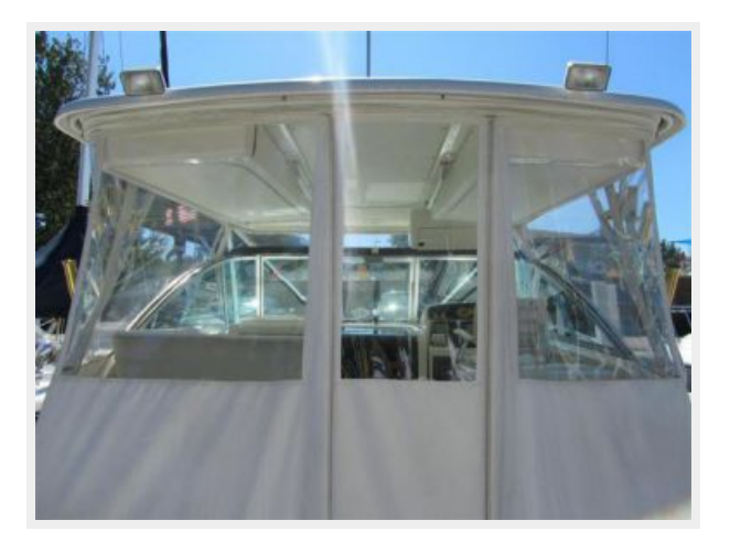
34' Pursuit Cockpit enclosure