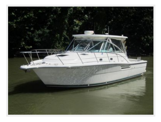
34' Pursuit Stbd bow