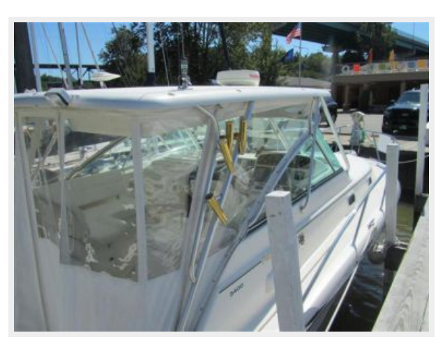
34' Pursuit Helm station view