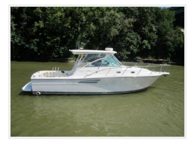
34' Pursuit Stbd beam