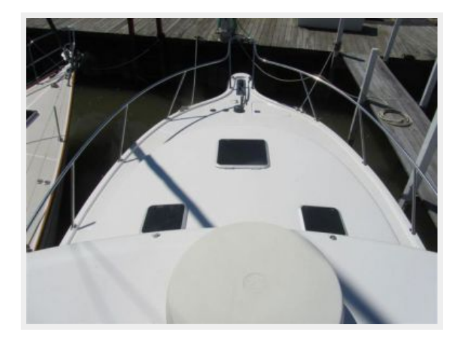
34' Pursuit Hardtop bow view