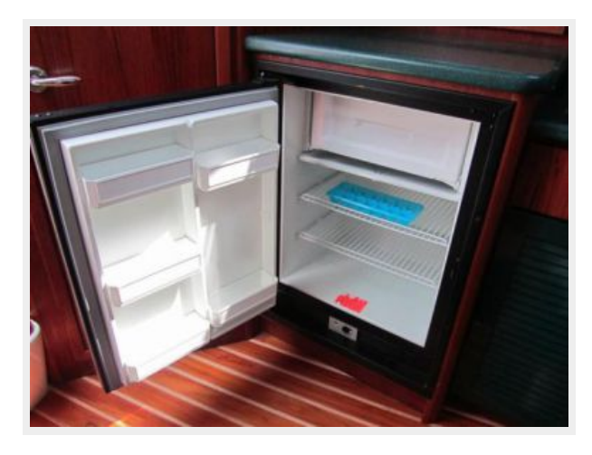
34' Pursuit Refrig & Freezer