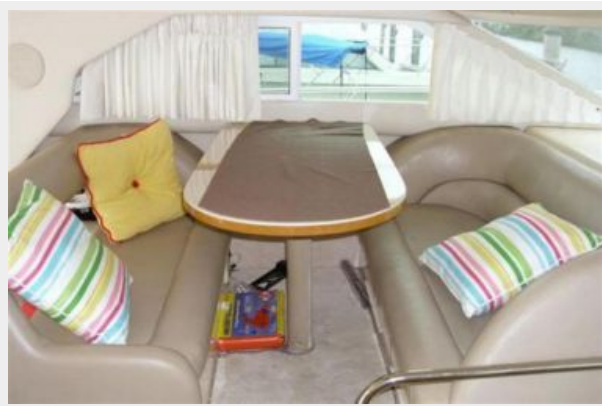
U Shaped Elevated Dinette