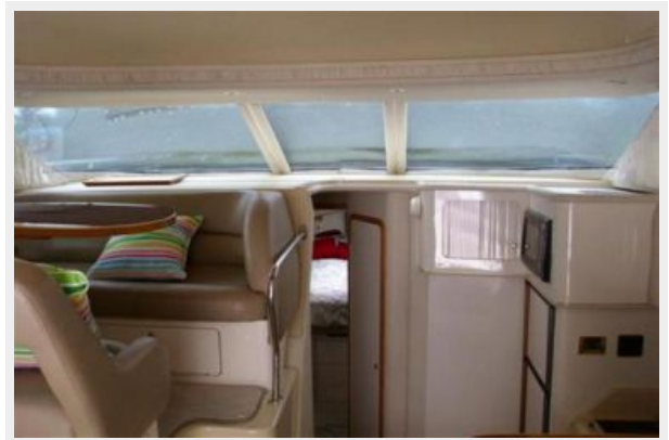
Panoramic View From Elevated Dinette