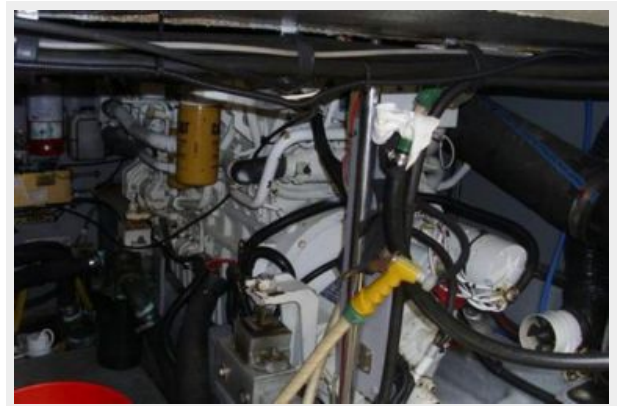
Caterpillar Diesel Engines