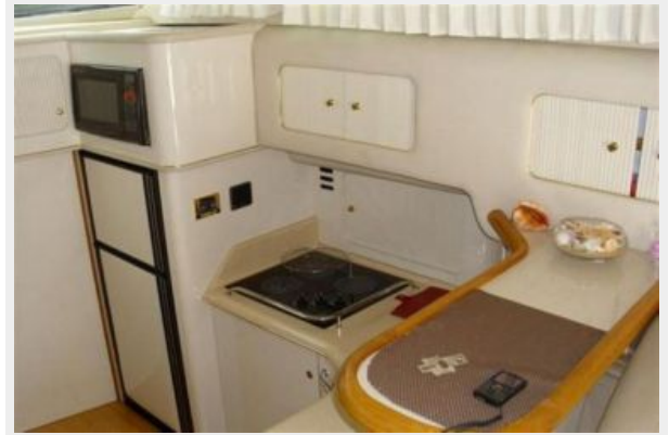
Galley Upper View