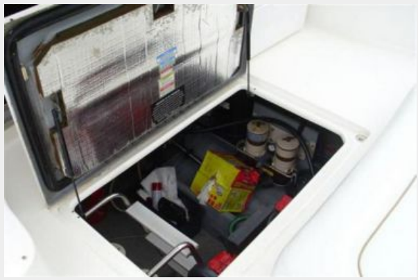
Engine Room Entrance