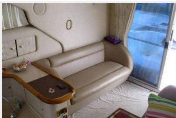
Starboard Lower Salon Sofa