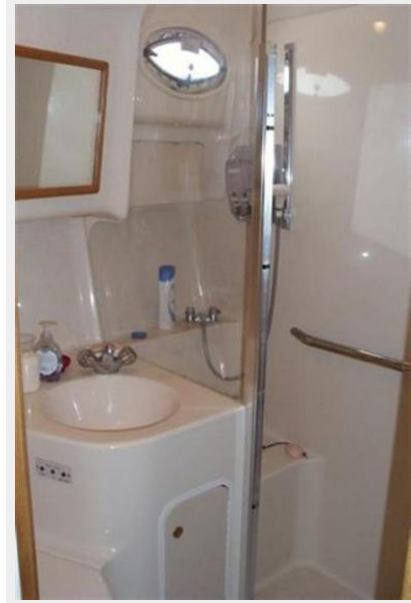
Guest Head W/Separate Shower