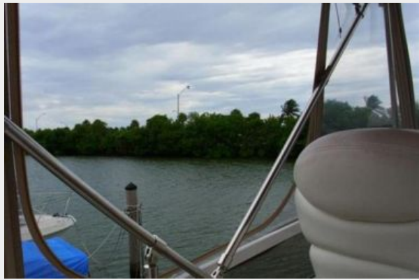
Panoramic View From Lounge