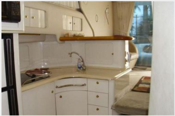
Galley Lower View