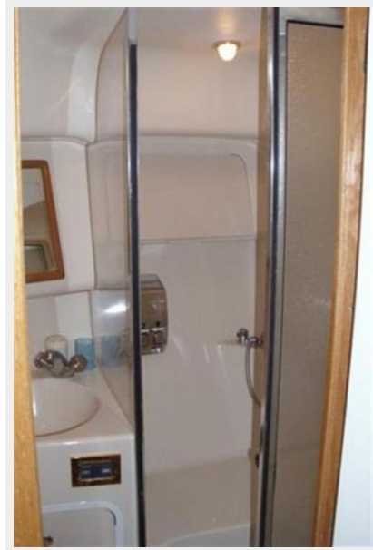
Guest Head W/Separate Shower