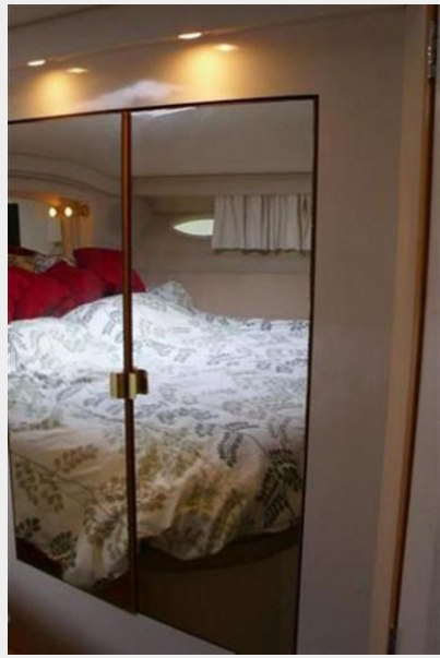
Starboard Storage Closet