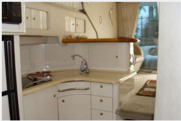
Galley Lower View