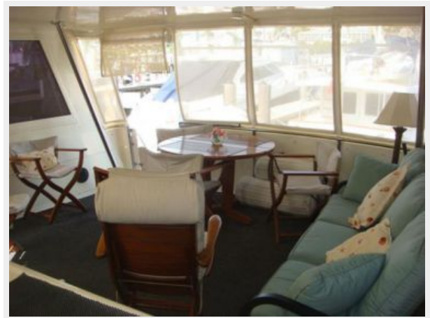
52' Hatteras sundeck