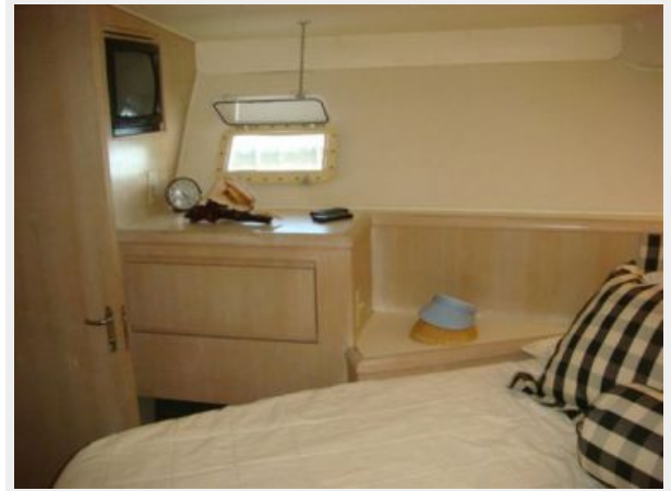
52' Hatteras guest stateroom head