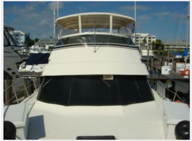
52' Hatteras foredeck aft