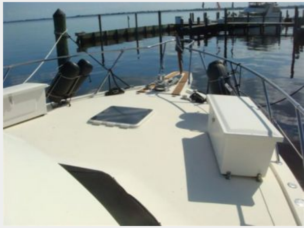
52' Hatteras foredeck