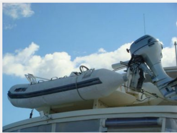
52' Hatteras tender