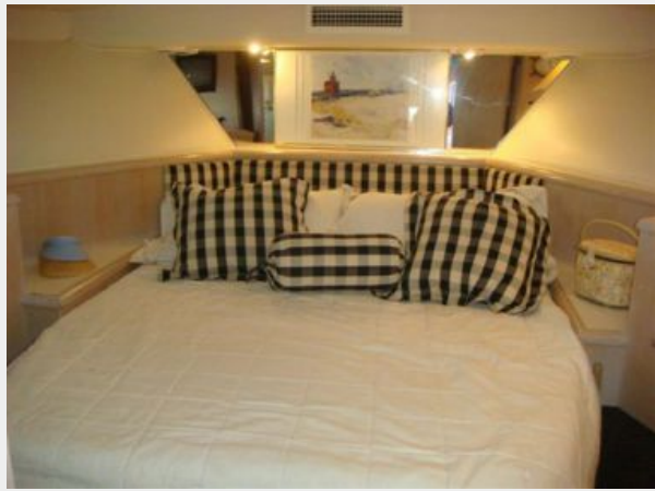
52' Hatteras guest stateroom