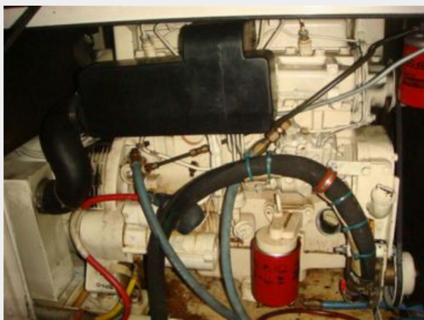
52' Hatteras generator