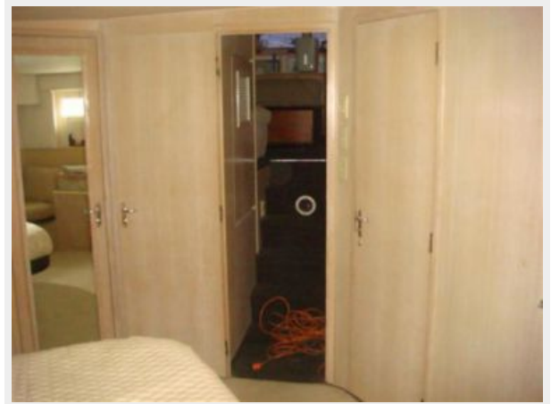
52' Hatteras master stateroom forward