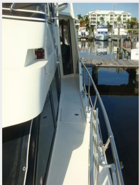
52' Hatteras port side deck photo1