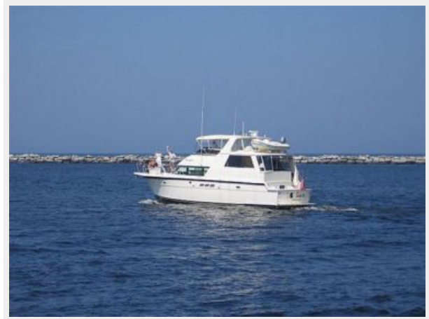
52' Hatteras underway