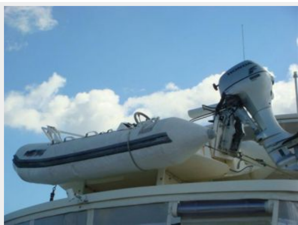
52' Hatteras tender