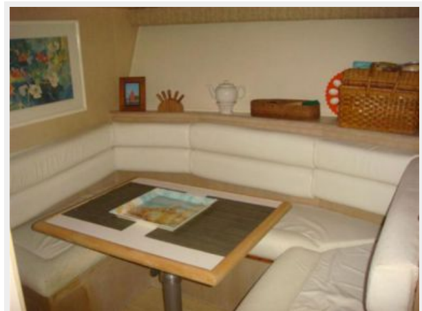
52' Hatteras dinette