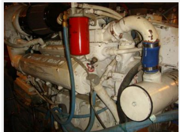
52' Hatteras port main engine