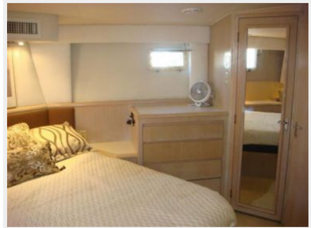
52' Hatteras master stateroom port