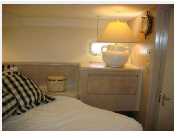
52' Hatteras guest stateroom starboard