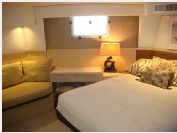
52' Hatteras master stateroom aft