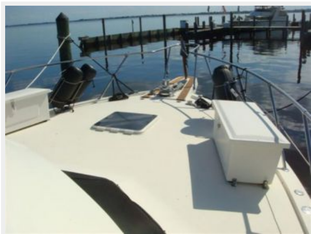
52' Hatteras foredeck