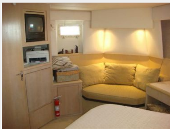
52' Hatteras master stateroom starboard