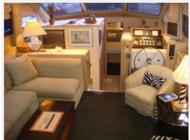
52' Hatteras salon forward