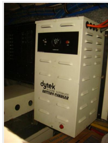
52' Hatteras battery charger