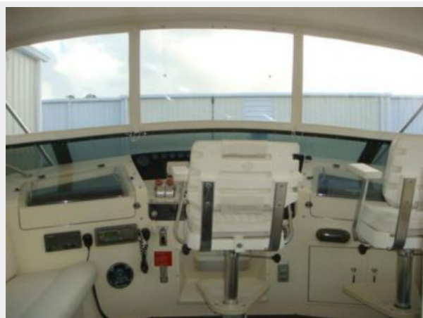
52' Hatteras flybridge forward