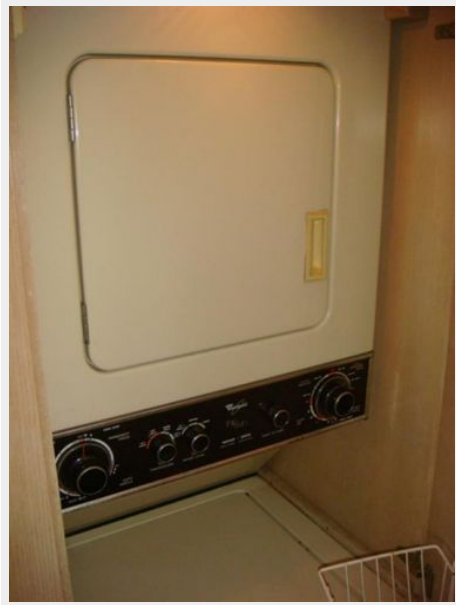
52' Hatteras washer-dryer