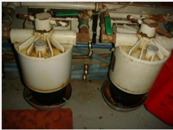
52' Hatteras Dahl fuel filters