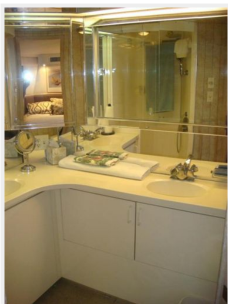
52' Hatteras master stateroom head