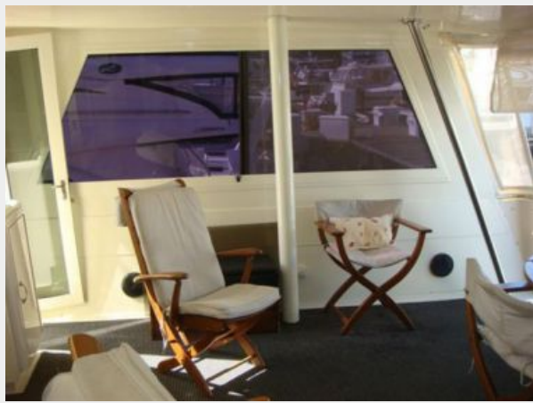
52' Hatteras sundeck starboard