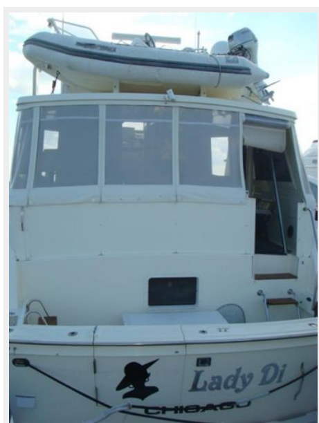
52' Hatteras aft profile