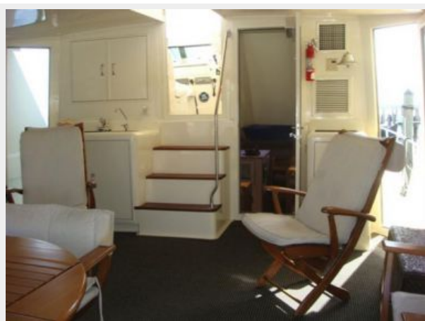
52' Hatteras sundeck forward