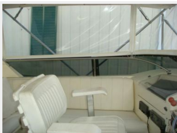
52' Hatteras flybridge port