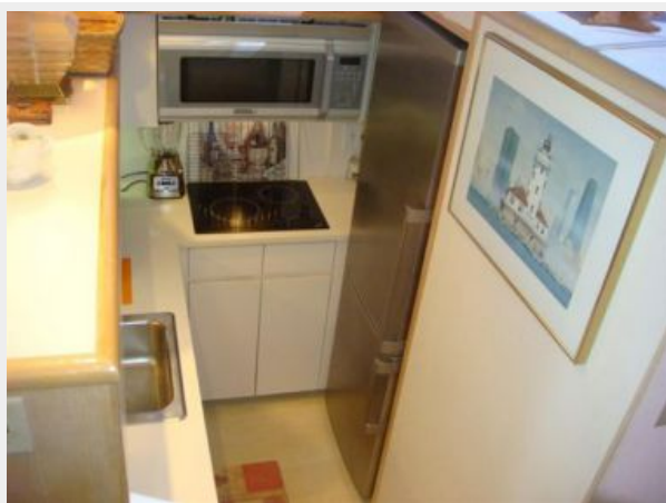
52' Hatteras galley photo2