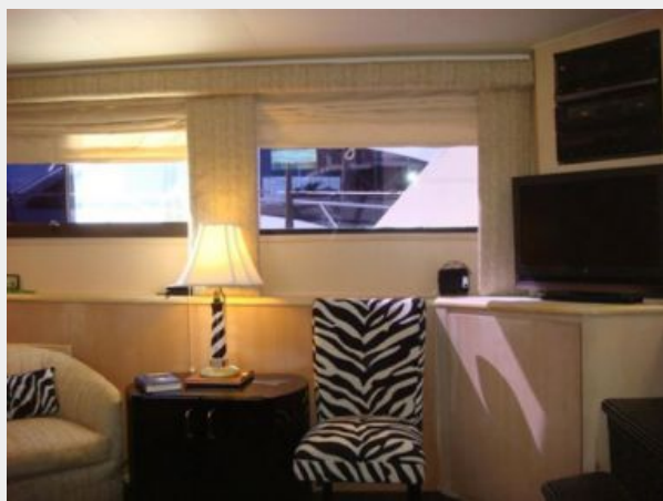
52' Hatteras salon starboard