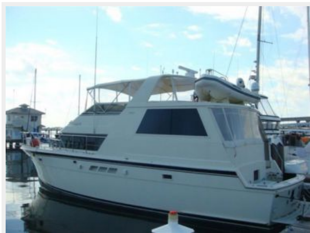
52' Hatteras port aft profile