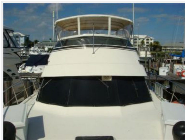
52' Hatteras foredeck aft