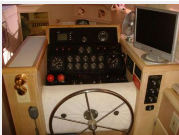
52' Hatteras lower helm