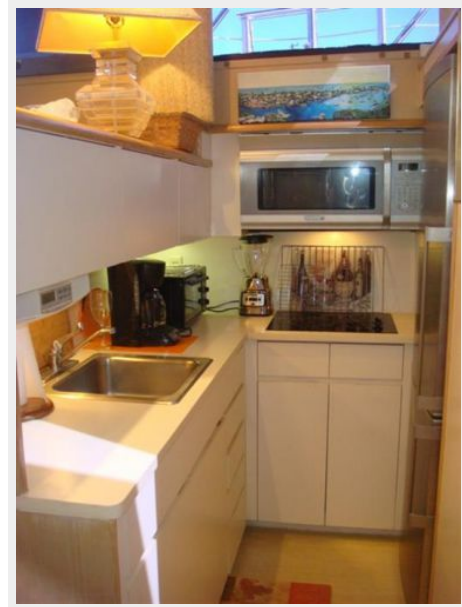
52' Hatteras galley photo1