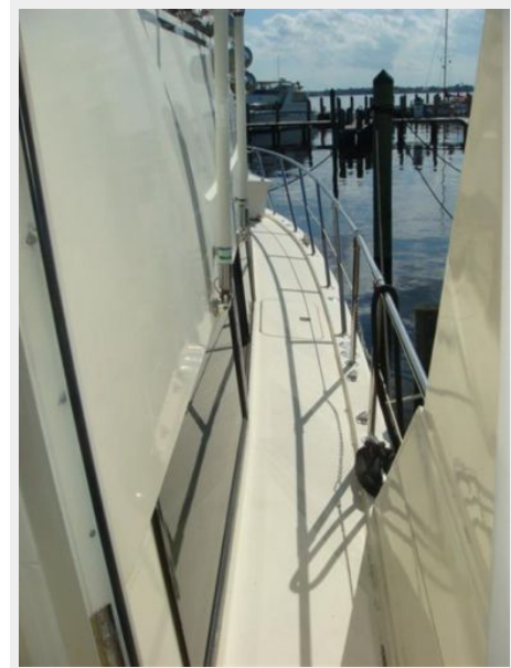
52' Hatteras starboard side deck photo2