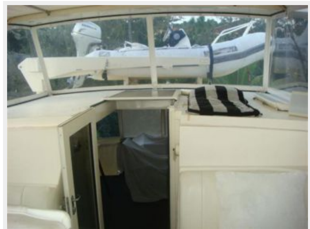
52' Hatteras flybridge aft