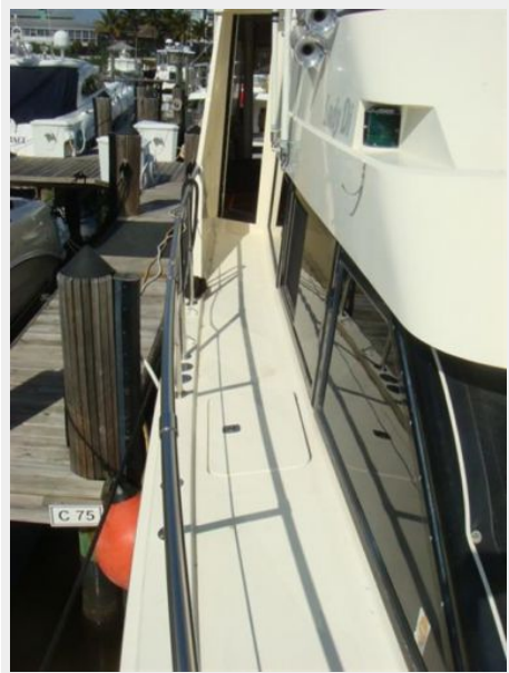
52' Hatteras starboard side deck photo1