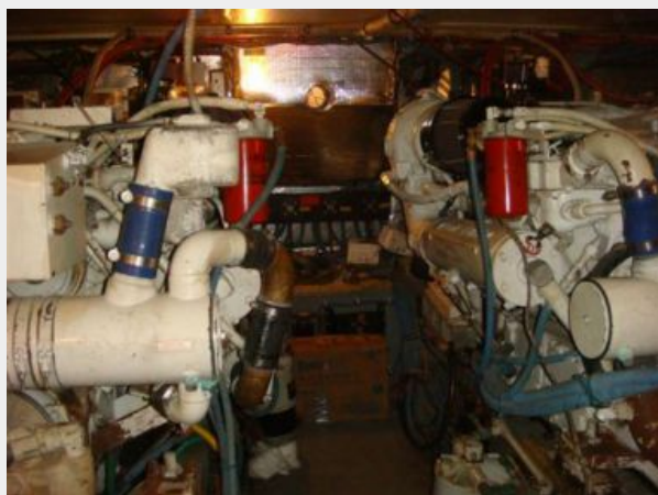
52' Hatteras engine room aft