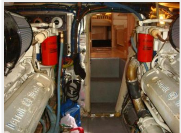
52' Hatteras engine room forward