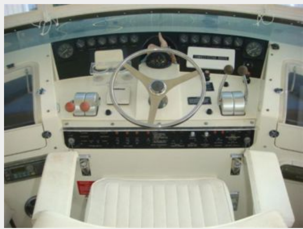
52' Hatteras flybridge helm