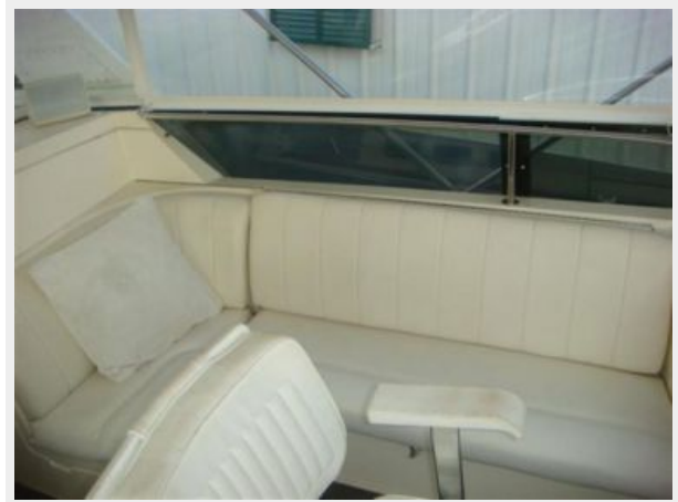
52' Hatteras flybridge seating