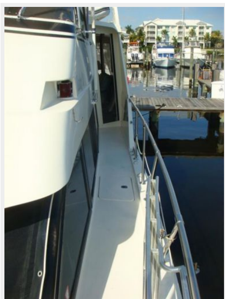
52' Hatteras port side deck photo1