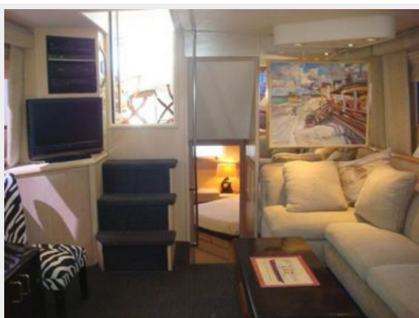
52' Hatteras salon aft