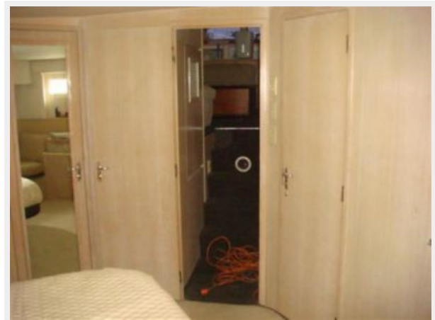
52' Hatteras master stateroom forward