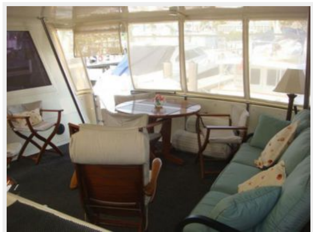
52' Hatteras sundeck