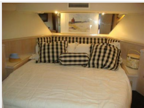
52' Hatteras guest stateroom