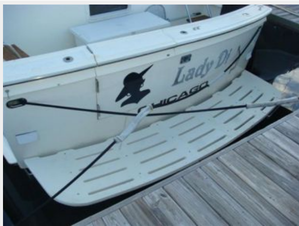
52' Hatteras swimplatform