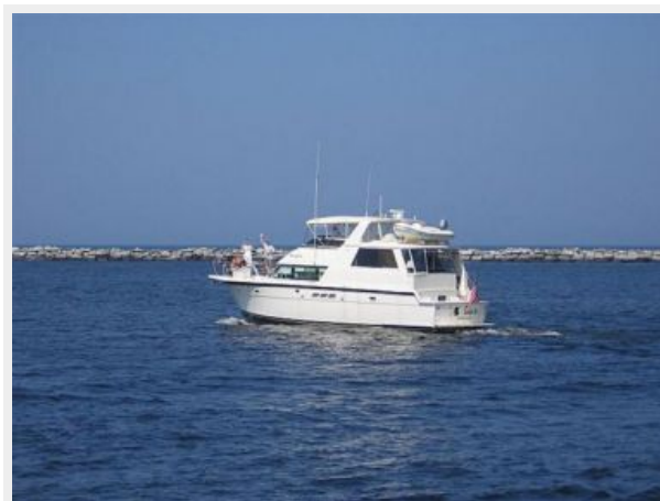
52' Hatteras underway