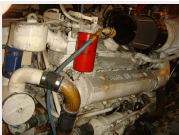
52' Hatteras starboard main engine