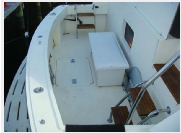
52' Hatteras cockpit