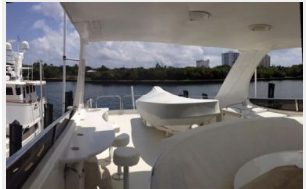
Bridge Looking Aft