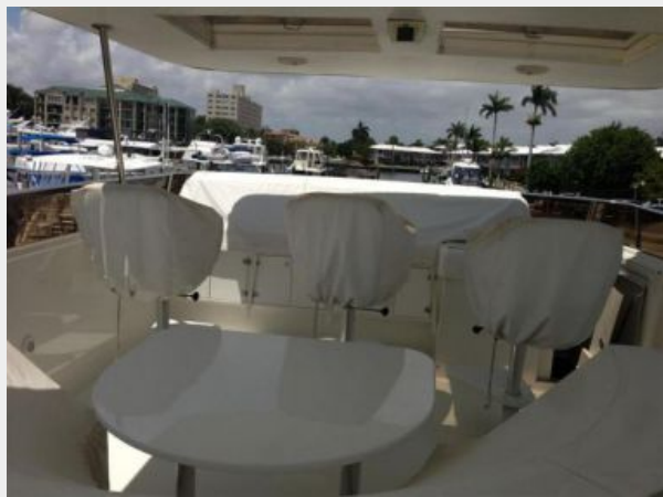
Bridge Looking Fwd