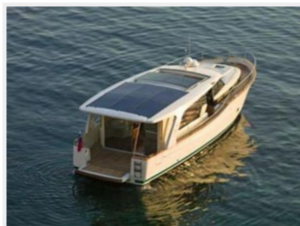
Super Displacement Hull Performance

The extended cabin roof gives full protection from the sun, rain or wind. An optional canvas cover enlarges the living space in colder seasons.