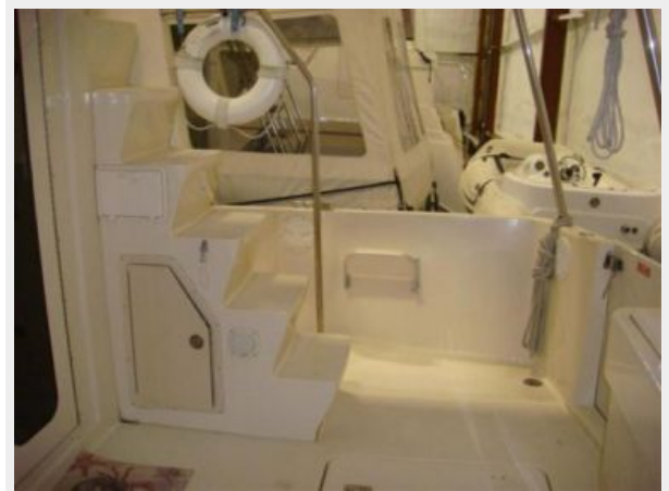
40' Mainship aftdeck starboard