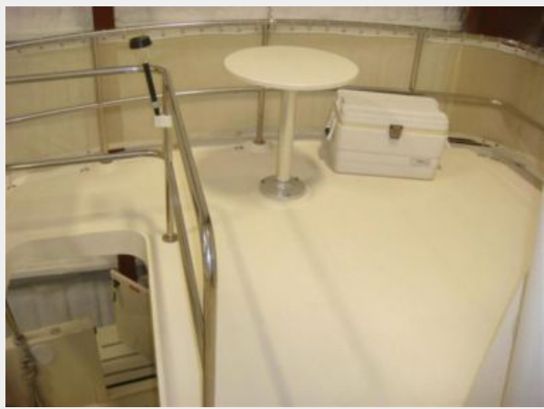
40' Mainship flybridge aft photo 1