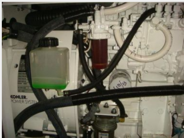
40' Mainship generator