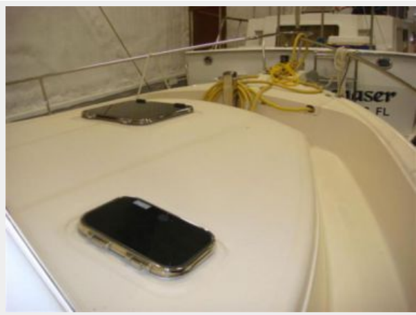
40' Mainship foredeck