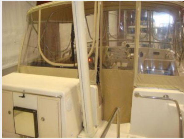
40' Mainship flybridge forward photo 1