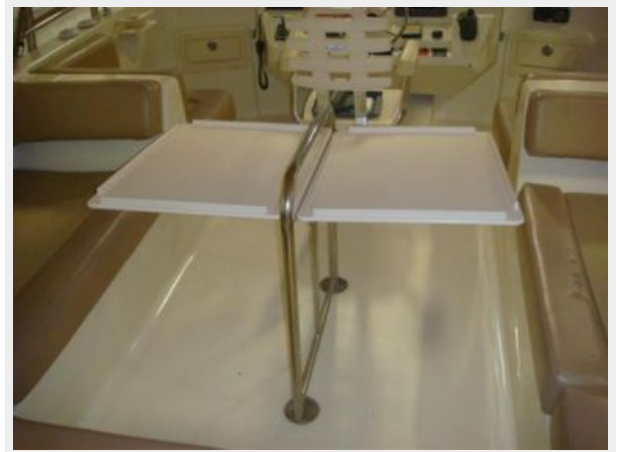
40' Mainship flybridge table