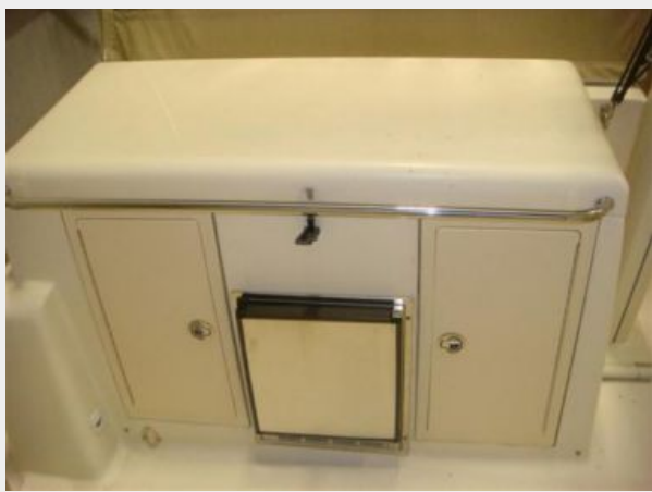
40' Mainship flybridge wetbar photo 1