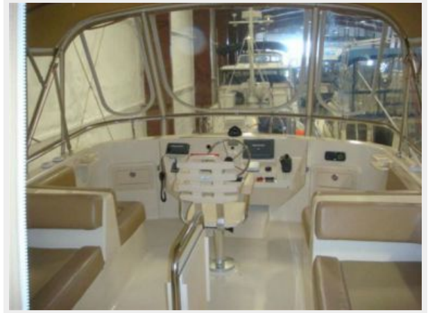
40' Mainship flybridge forward photo 2