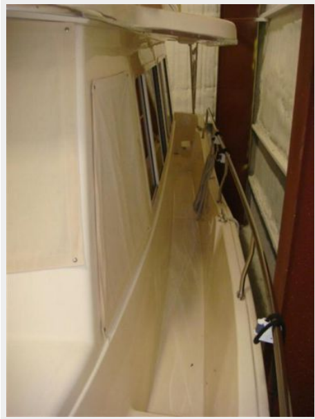
40' Mainship port side deck 2