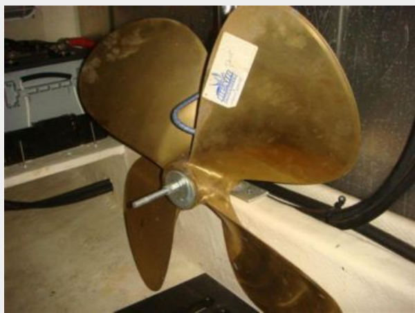
40' Mainship spare prop