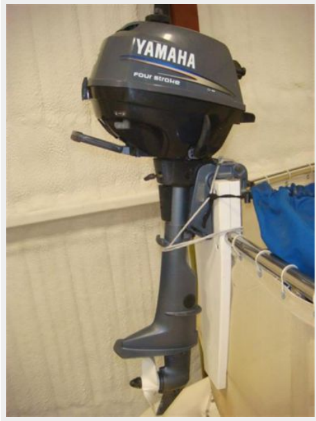
40' Mainship tender outboard