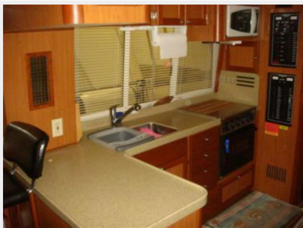
40' Mainship galley photo 2