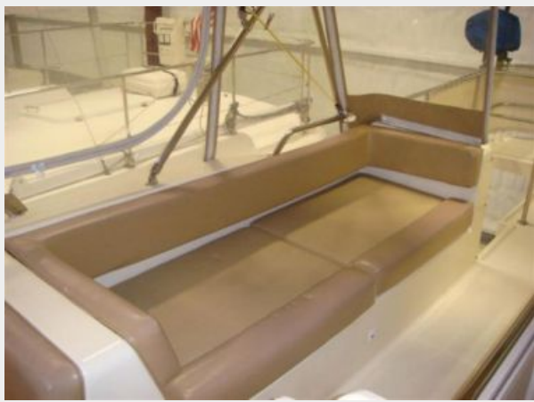
40' Mainship flybridge starboard seating