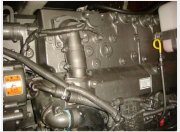
40' Mainship main engine photo 1