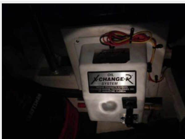
40' Mainship oil change system