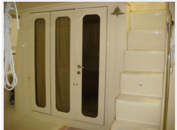
40' Mainship aftdeck forward