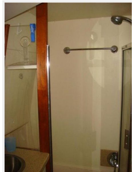
40' Mainship shower