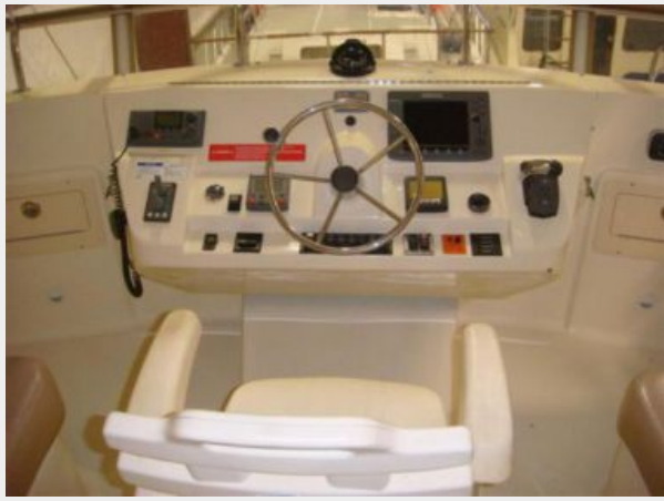
40' Mainship flybridge helm