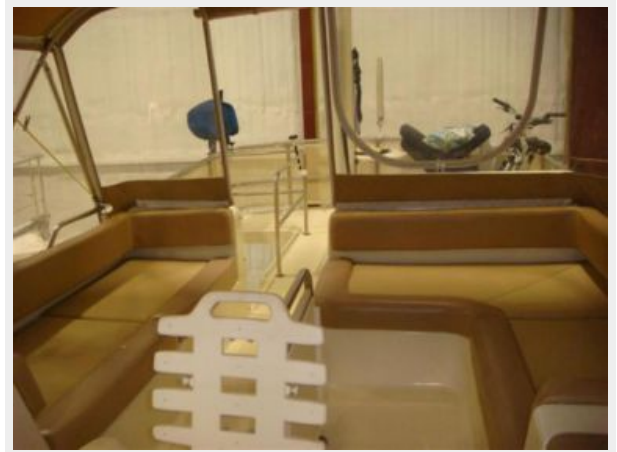
40' Mainship flybridge aft photo 2