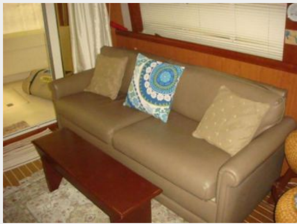
40' Mainship salon seating