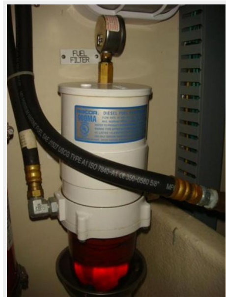
40' Mainship Racor fuel filter