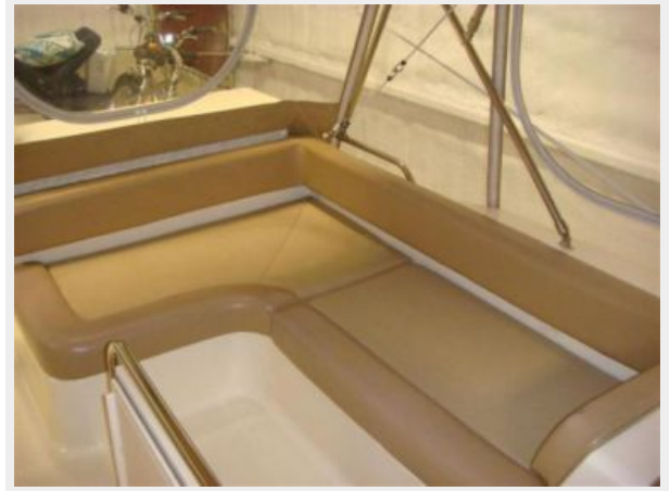
40' Mainship flybridge port seating