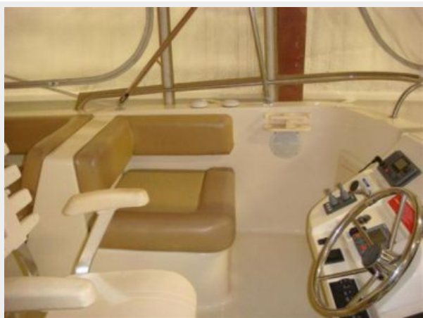
40' Mainship flybridge port