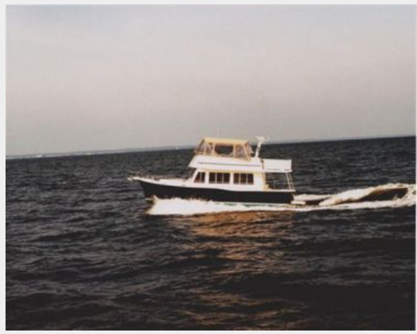
40' Mainship underway