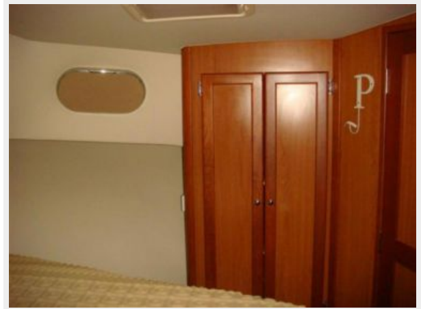
40' Mainship master stateroom starboard