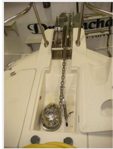
40' Mainship anchor windlass