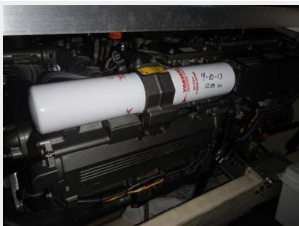
40' Mainship main engine photo 2