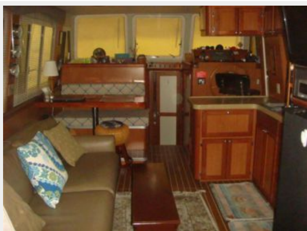
40' Mainship salon forward