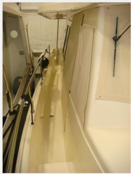
40' Mainship starboard side deck 2