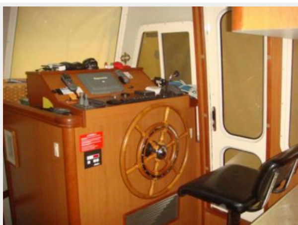
40' Mainship lower helm