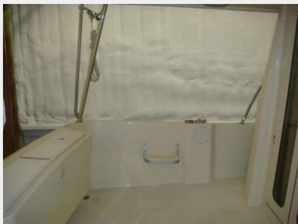
40' Mainship aftdeck port