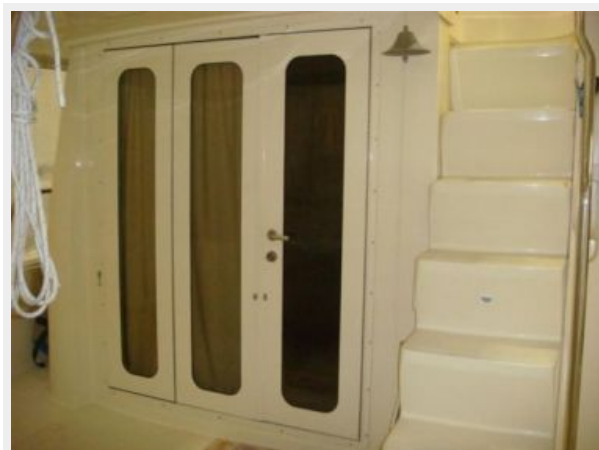
40' Mainship aftdeck forward