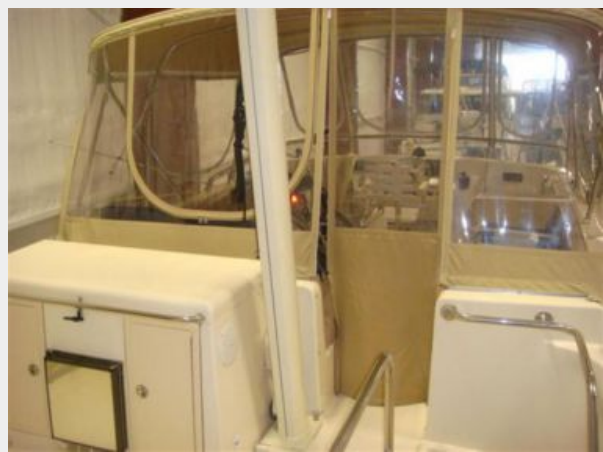
40' Mainship flybridge forward photo 1