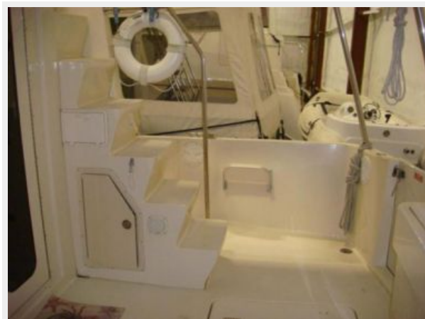
40' Mainship aftdeck starboard