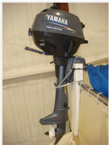
40' Mainship tender outboard