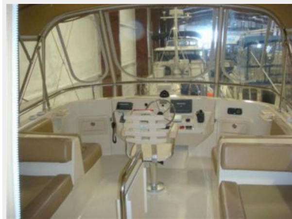
40' Mainship flybridge forward photo 2