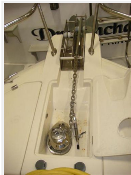
40' Mainship anchor windlass