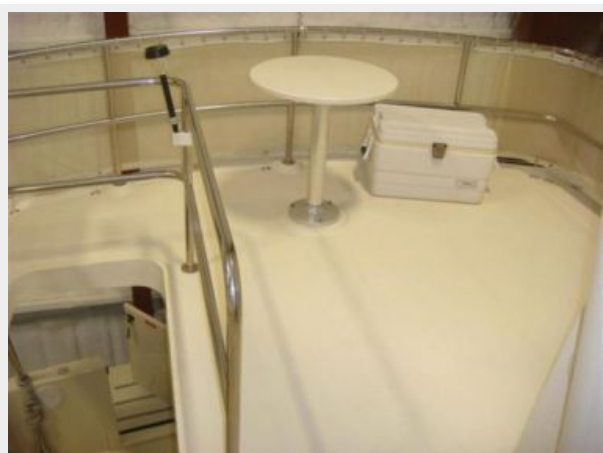
40' Mainship flybridge aft photo 1