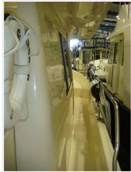
40' Mainship starboard side deck 1