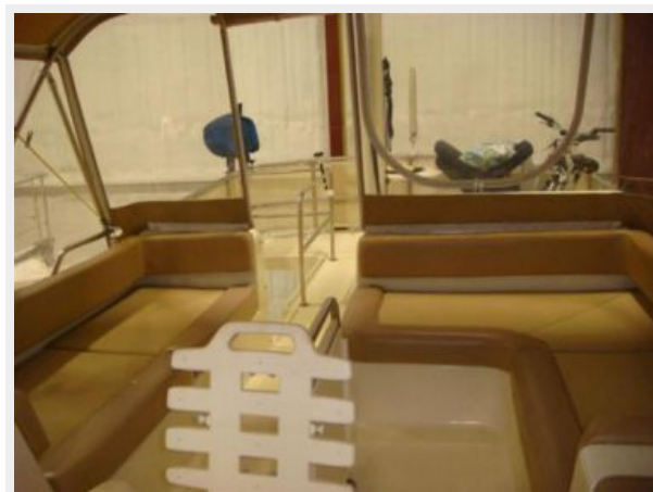
40' Mainship flybridge aft photo 2