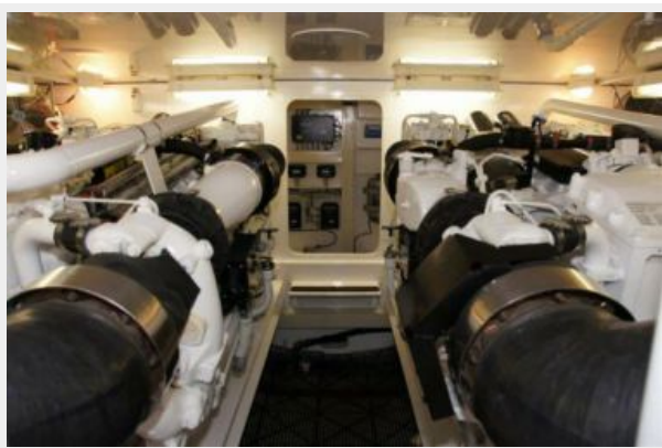
Engine Rm Entrance From Cockpit