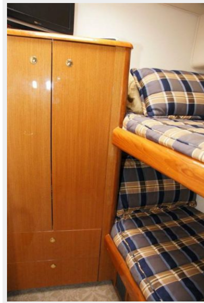
Mid-Ship Guest Cabin to Stbd