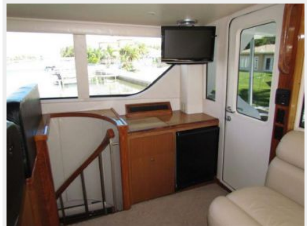
Enclosed FB Circular Stairs to Salon