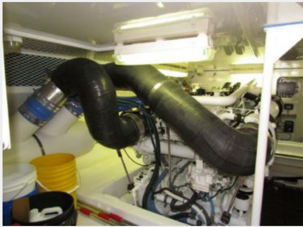
Port DDE/MTU 12V2000