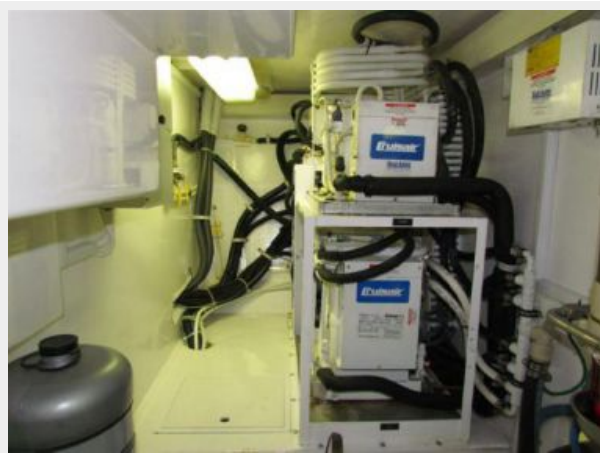
Machinery Rm Fwd w/Five Cruiseair Compressors