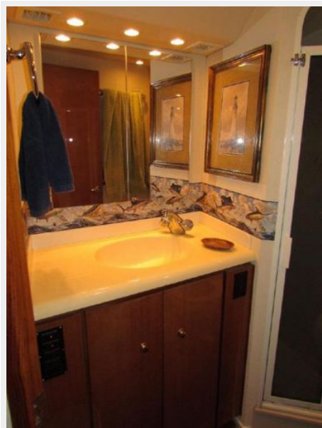
Fwd VIP Head Compartment