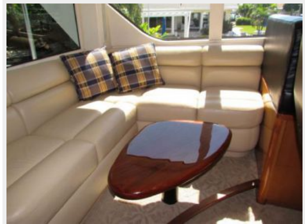
Enclosed Pilot House L-Shaped seating/Teak Table Port