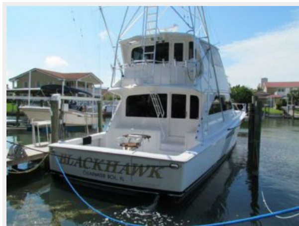
Transom/Aft Stbd View