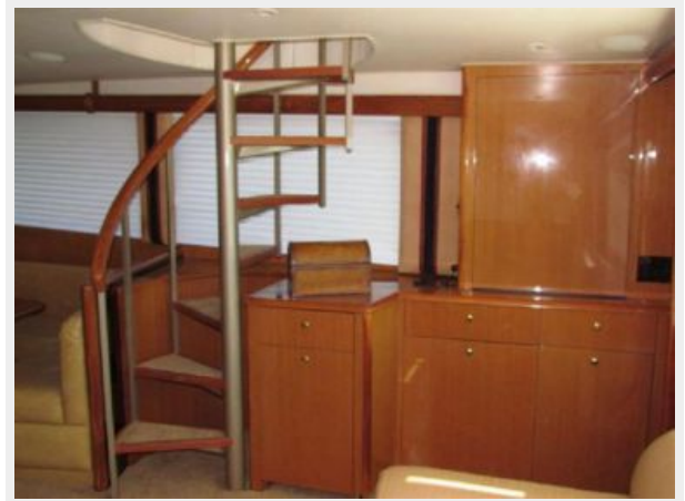
Entertainment Center & Spiral Stairs