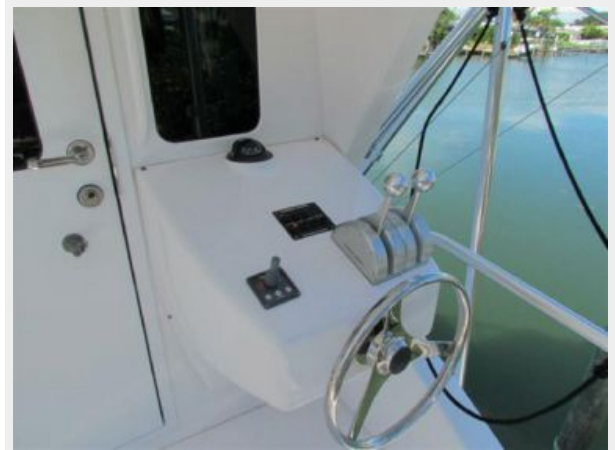
FB Steering Station