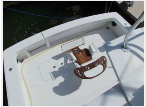
Cockpit & Bluewater Fighting Chair