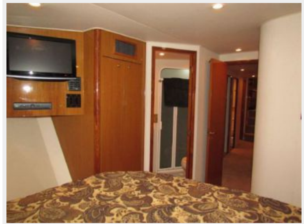
VIP Stateroom Looking Aft