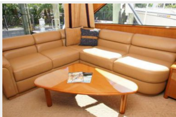
Salon U-Shaped Settee