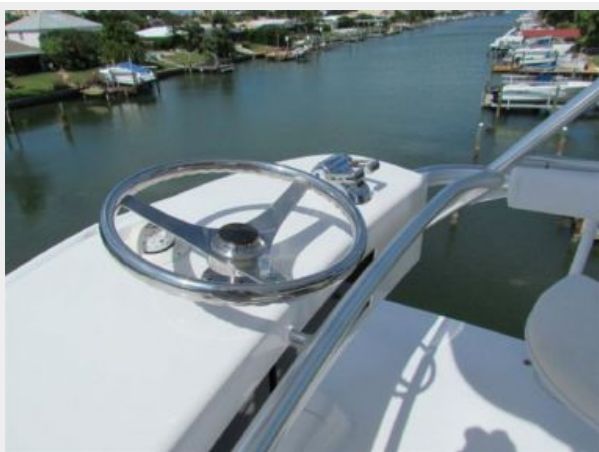
Tower Helm & Controls