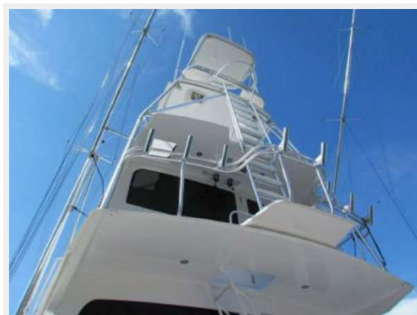
Full Tower w/FG Hard Top-New 2011