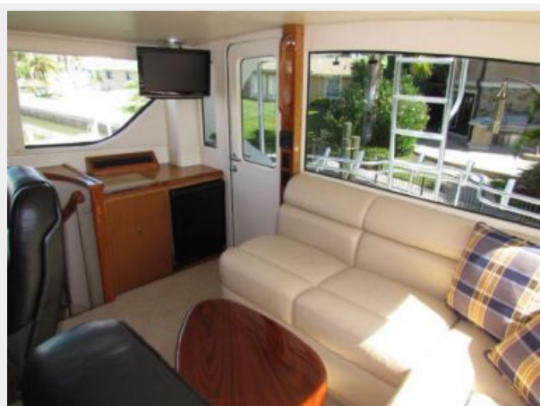
Enclosed FB TV/Wet Bar/TV & Door to Aft Deck