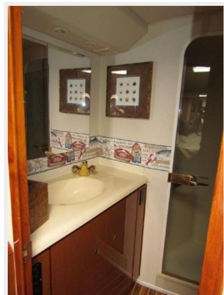
Master Head Compartment