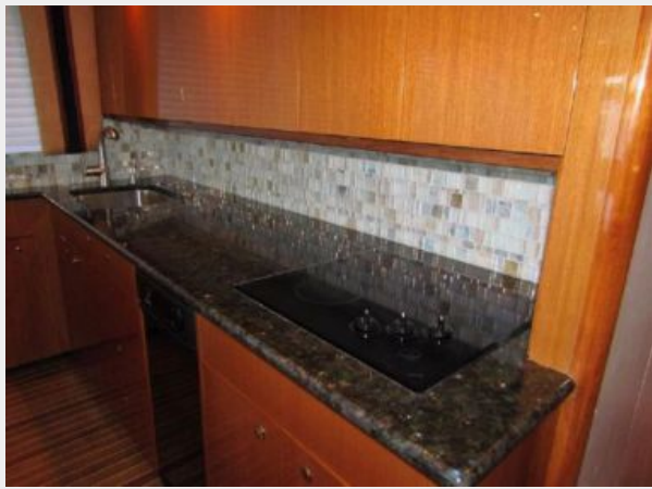
New Granite Countertop & Glass Tile Backsplash-2015