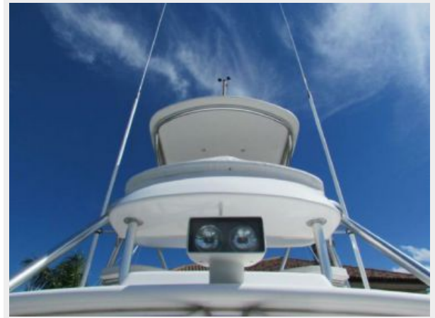
ACR Spot Light & Tower