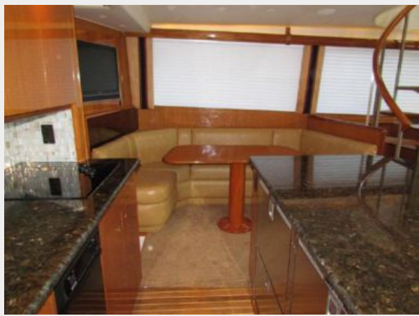
Galley View to Dinette