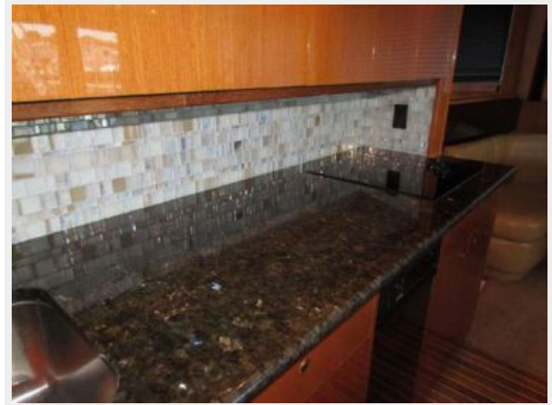
Granite Countertop & Glass Tile Backsplash-2015