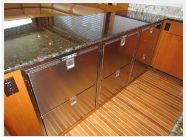
New Vitrefrigo Ref (4) & Fzr (2) Drawers-2015