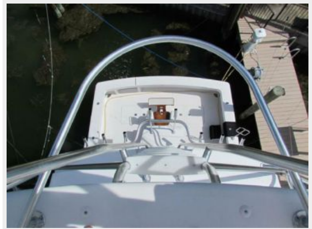
Cockpit View From Tower