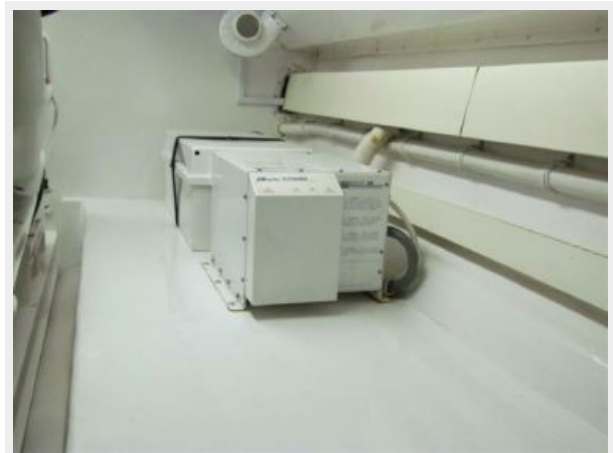
Outboard of Stbd Engine & Charles Shore Power Transformers