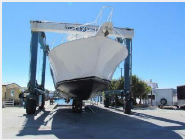
Stbd Bow Quarter-Hauled