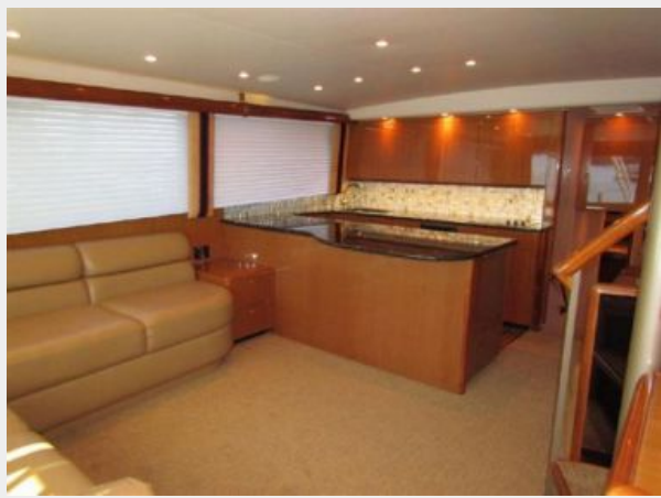
Salon & New Open Galley-2015