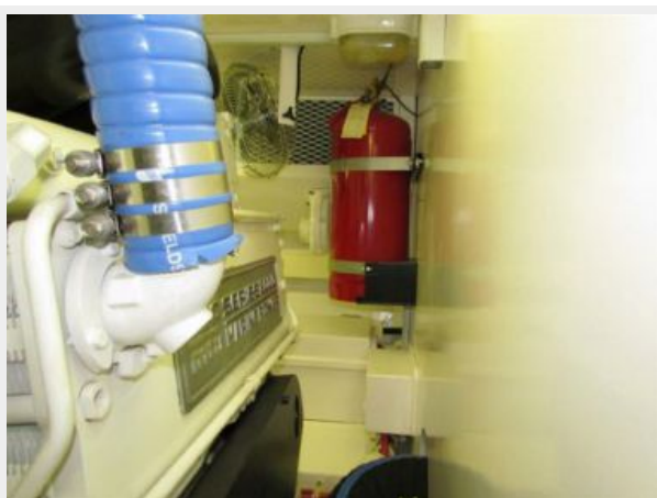
Port Engine & Auto Fire Ext Sys