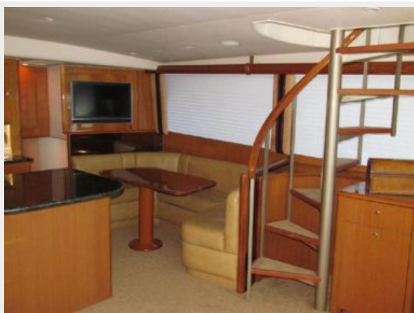
Salon Looking Fwd to Dinette