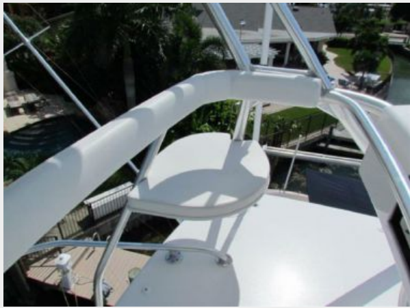
Tower Seating Stbd