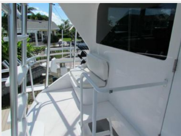
FB Seating Aft