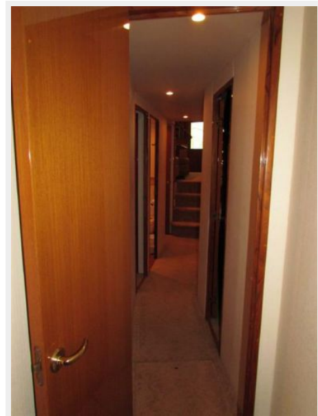
Passageway Looking Aft