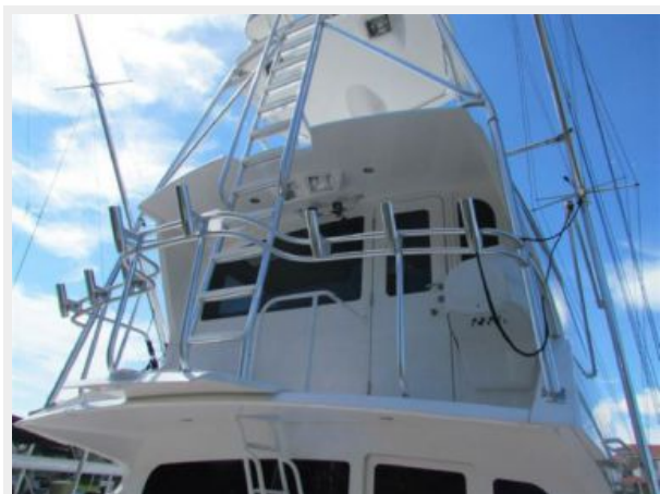
FB Aft Deck/Steering Station