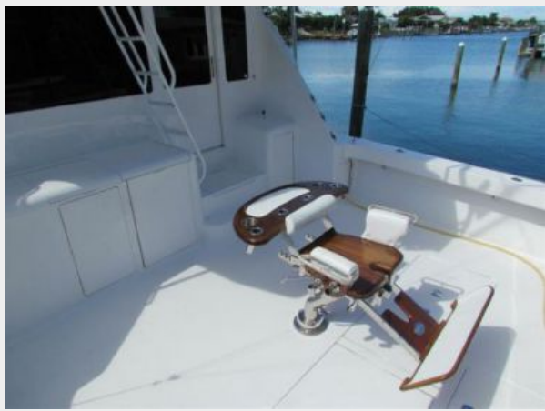
Bluewater Fighting Chair