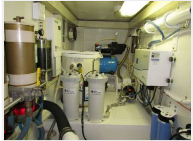
Port Machinery RM & Watermaker-New 2011