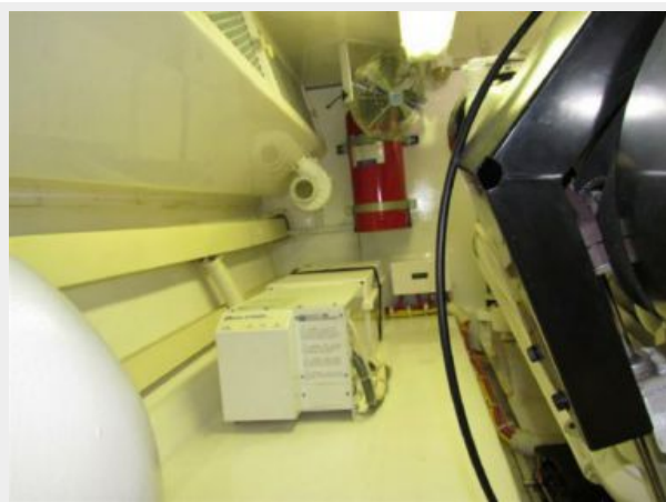
Outboard Port Engine & Charles Shore Power Transformer