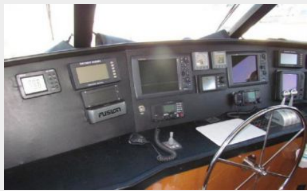
New Furuno NavNet 3D MFD-12