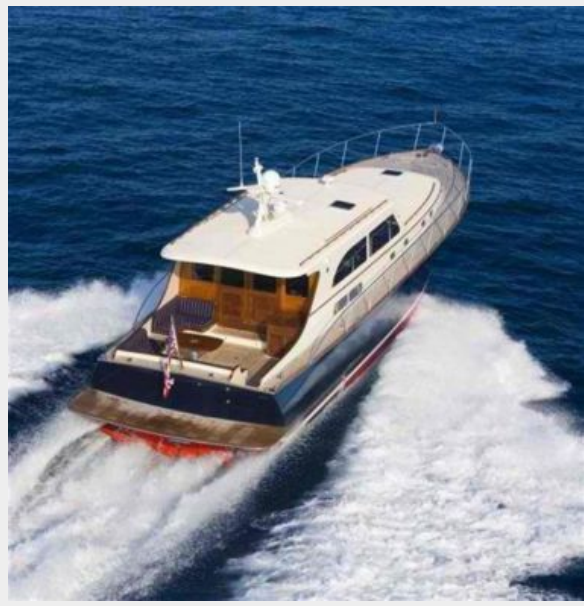
Aft Running Shot