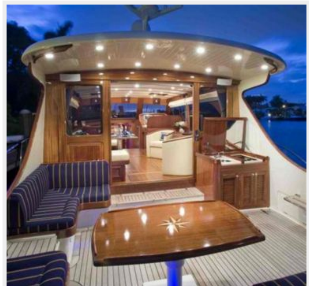
Aft View Looking Forward