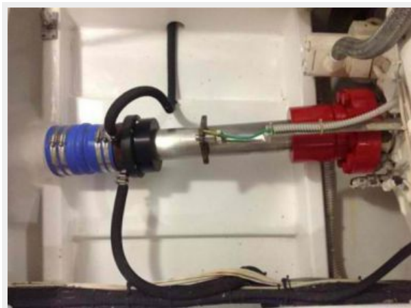
Engine Shaft 1