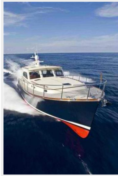
Bow Facing Running Shot