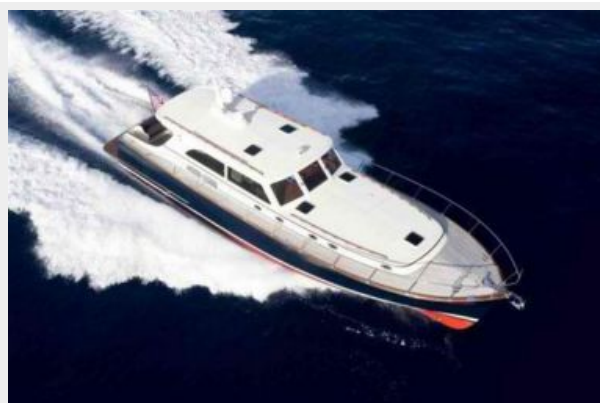
Overhead Running Shot