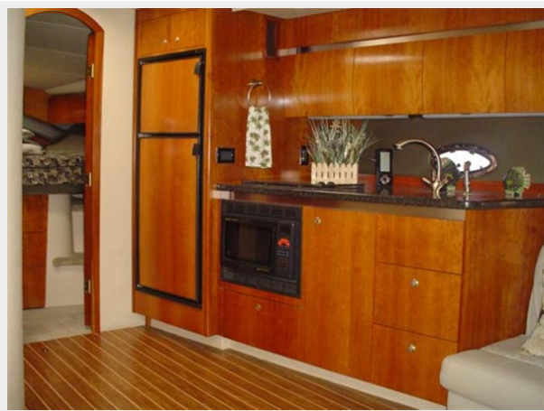
Galley to Starboard