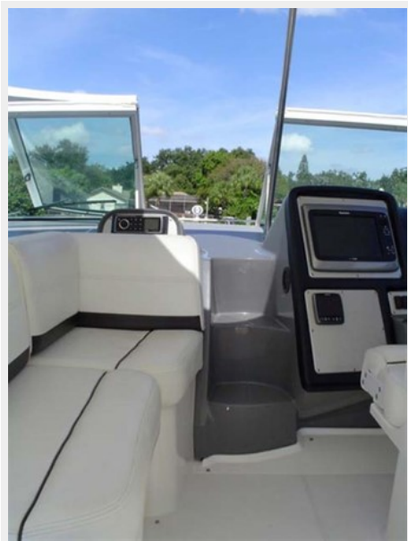
Walk-through Windshield to Bow