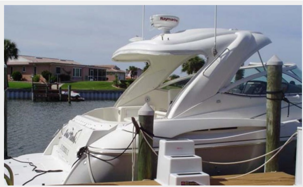
Factory Hard Top and Extended Swim Platform for easy boarding