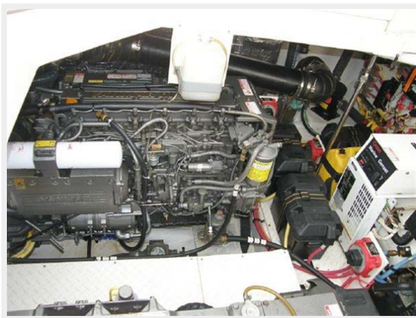
Starboard Yanmar 6LY2A STP turbocharged (440HP)