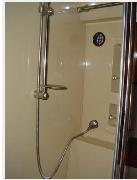
Separate Shower Stall with seat and storage for toiletries