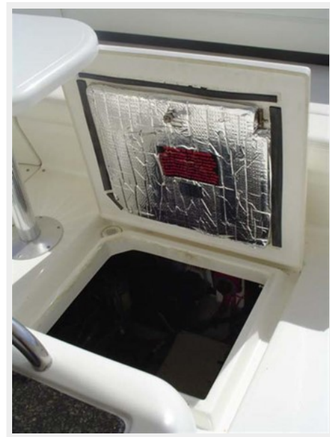
Cockpit Hatch for quick access to Engine Compartment