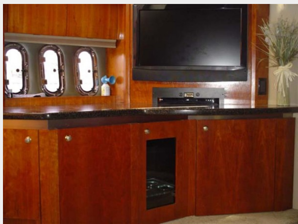
Salon Entertainment Center with Upgraded Stereo (Summer, 2013) that is iPhone & Bluetooth Compatible, 31" Envision Flat Screen TV