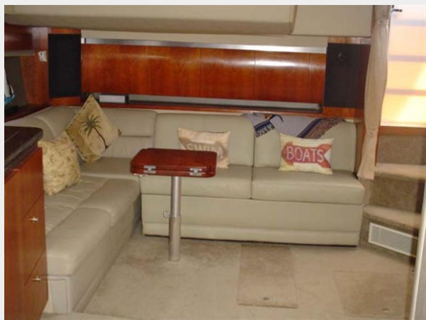
Huge Salon with NEW Flexsteel Pull-out Sleeper Settee