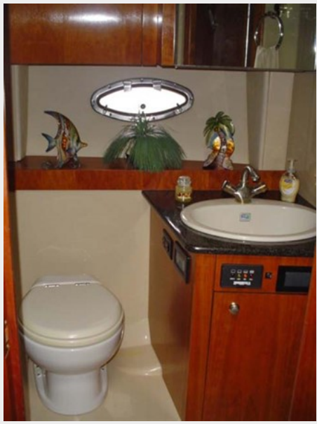
Head with Electric toilet, Sink, Storage