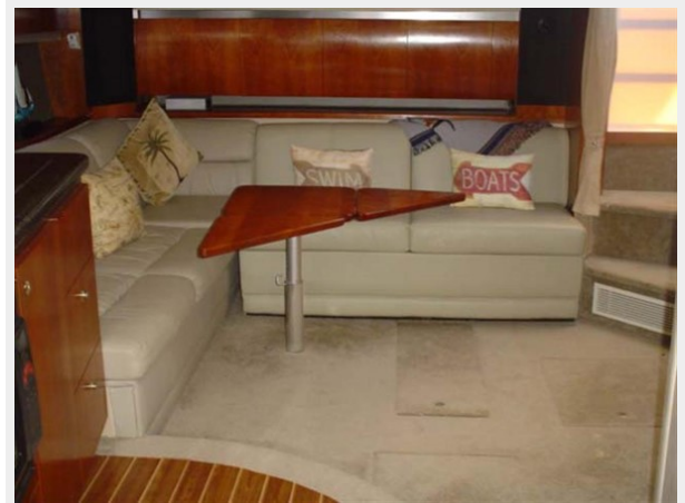
Salon with Teak Drop Leaf Table Extended Out