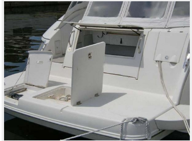
Extended Swim Platform