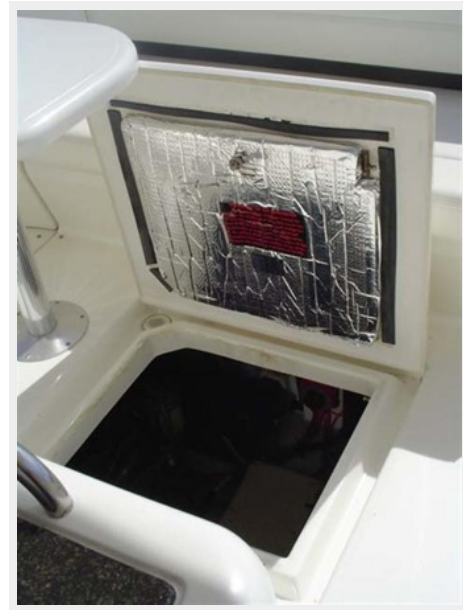
Cockpit Hatch for quick access to Engine Compartment