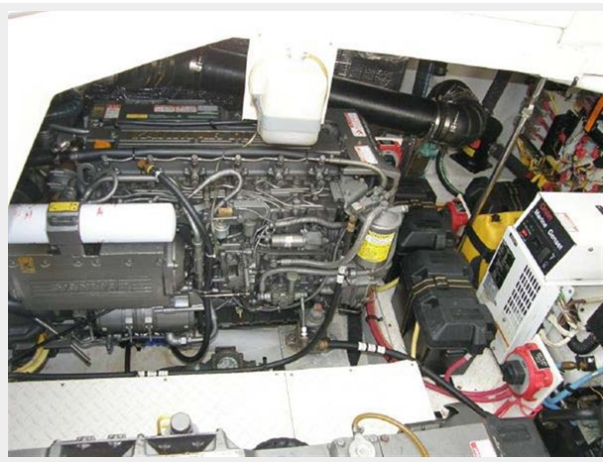
Starboard Yanmar 6LY2A STP turbocharged (440HP)