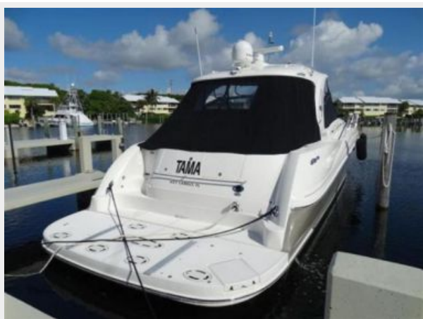
Aft profile with aft curtain