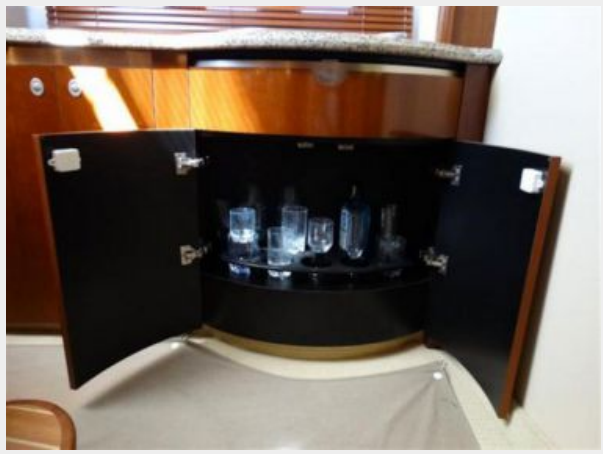
Built in wine rack/class storage