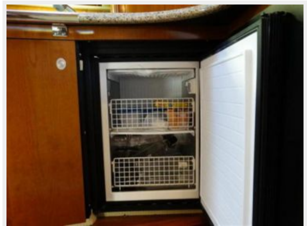
Large capacity freezer