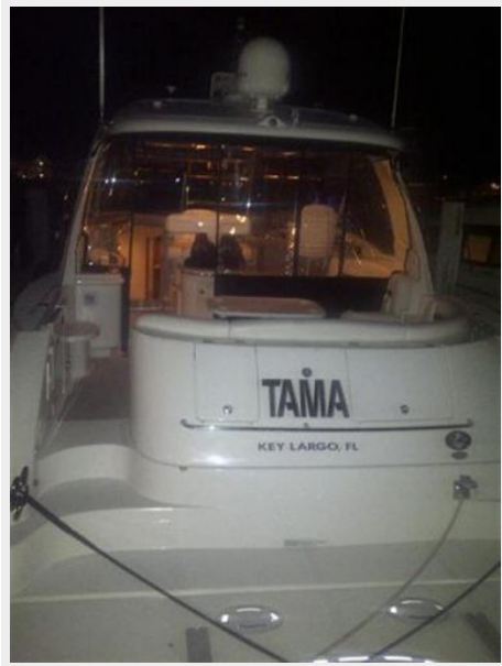
Cockpit night time