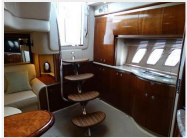
Galley looking aft