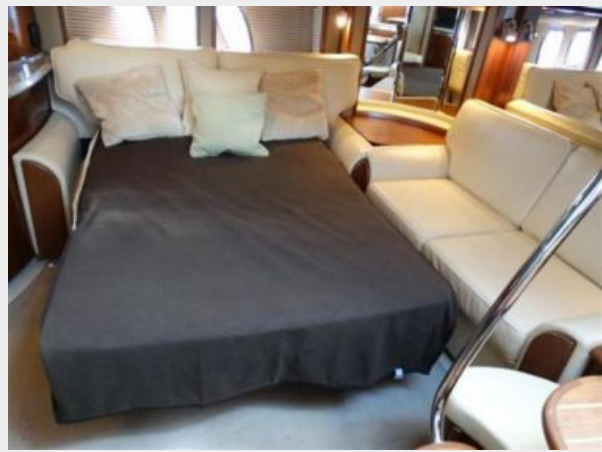
Fold out sofa