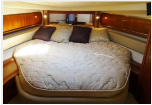
Fwrd strm Island bed