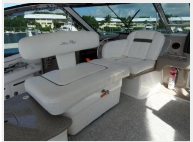
Rotated companion seating