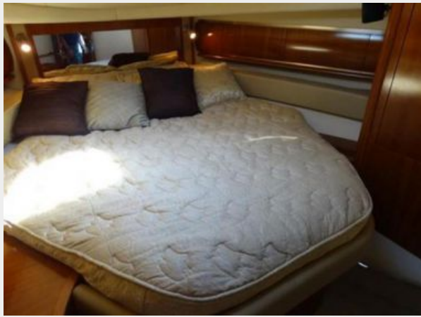
Owners stateroom bedding