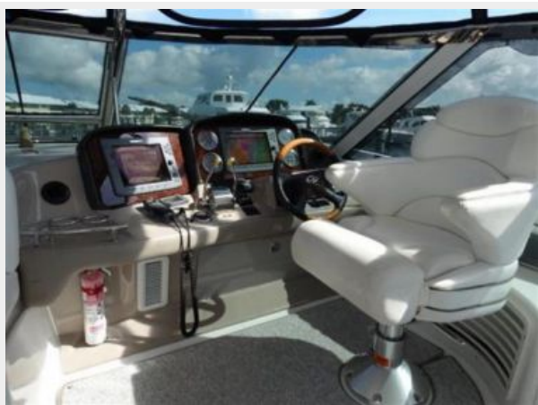
Helm chair swiveled