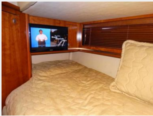
Port lower bunk w/new flat screen