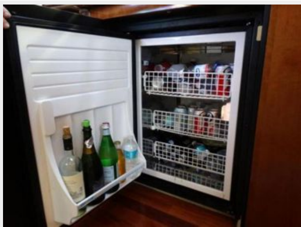
Tons of drink space