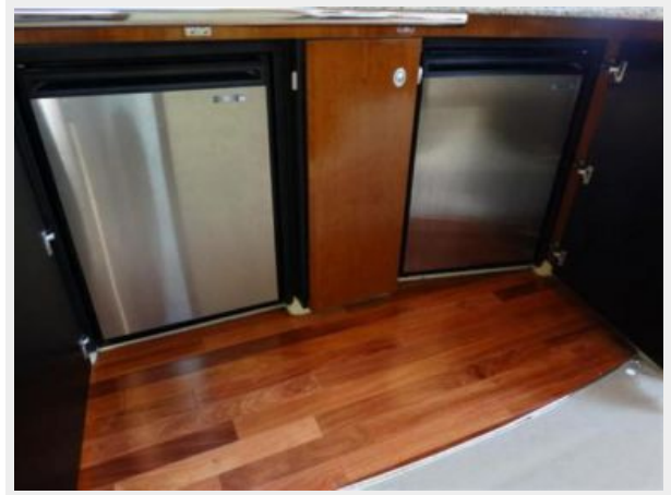
Stainless steel refrigerator and freezer