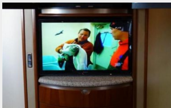
Salon 37" TV