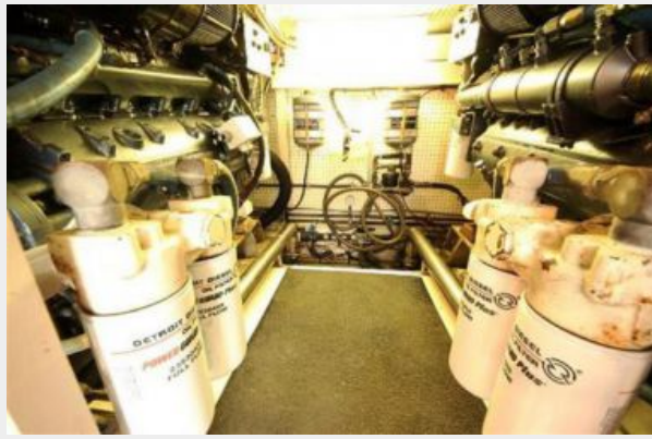
Engine room photo 2