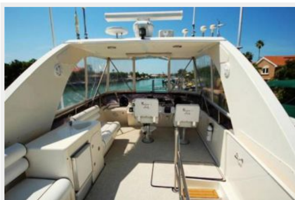
Bridge looking FWD