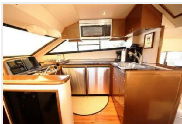
Completely Updated Galley