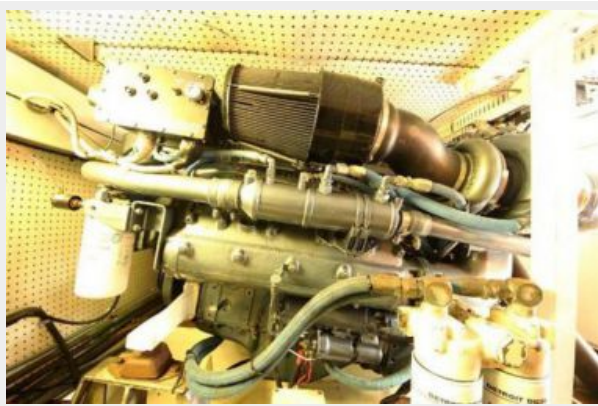
Engine room photo 4