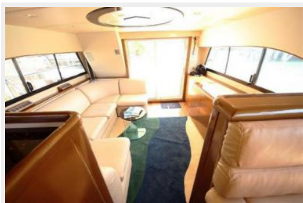
Salon looking aft