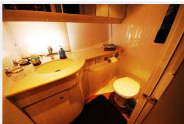
Guest Head w/separate shower