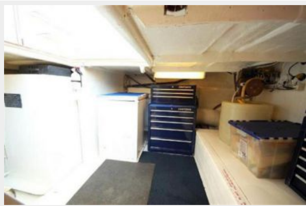
Lazzarette photo 2