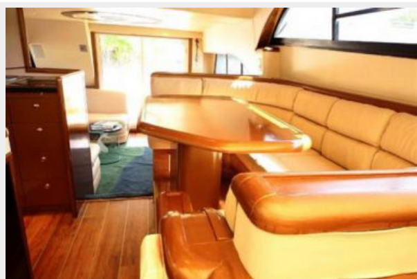
Dinette photo 2