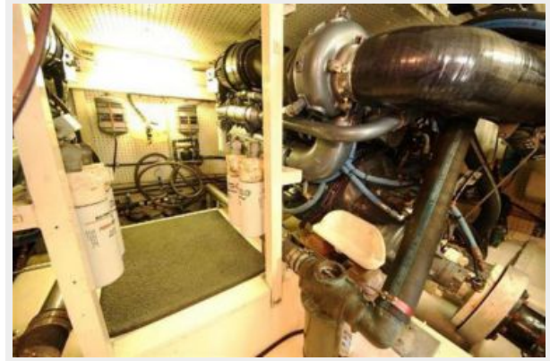
Engine room photo 3