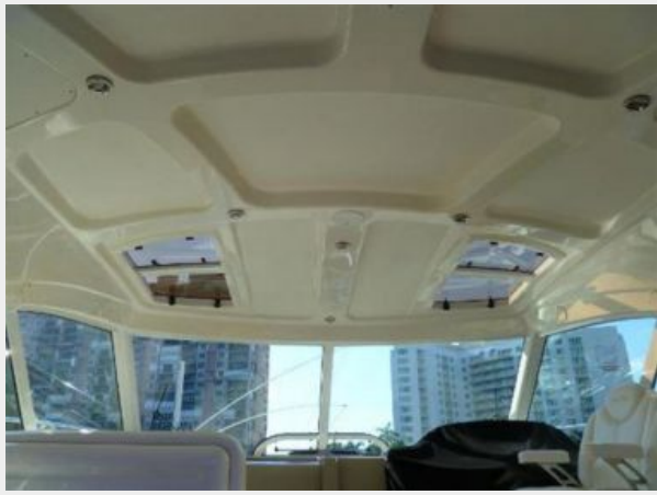
Hard Top with Port and Starb. roof vents