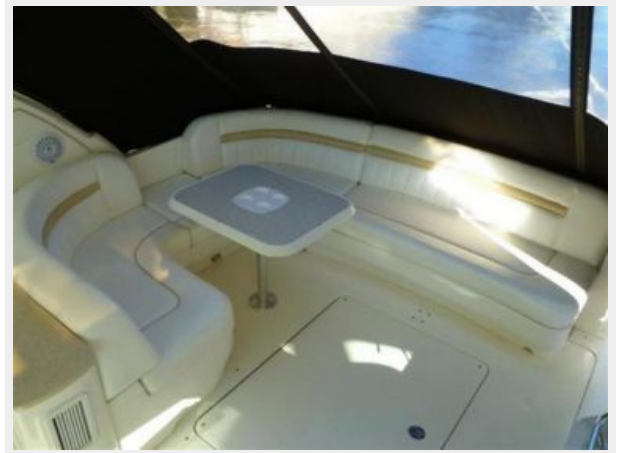
Spacious aft cockpit