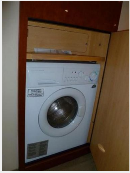
Washer/dryer (never used)