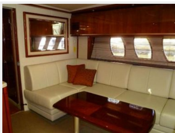
Salon looking Fwd