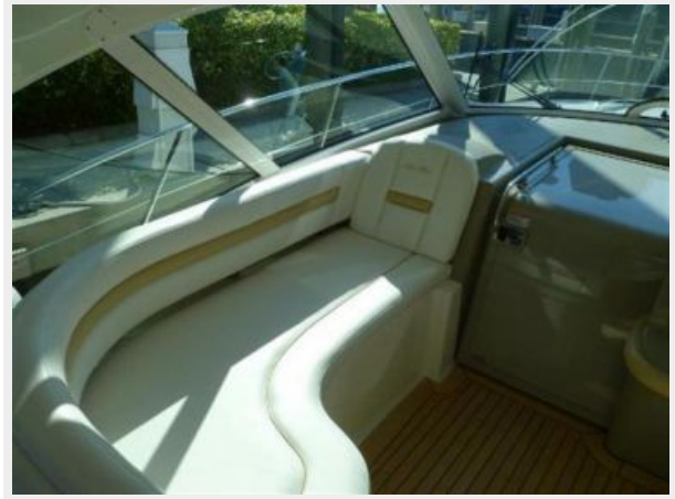
Port side cockpit lounge