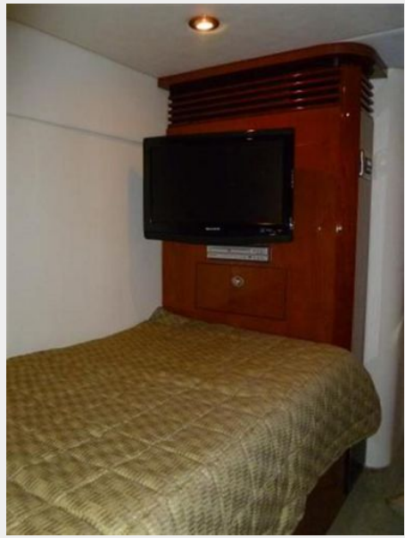
Guest cabin TV/DVD