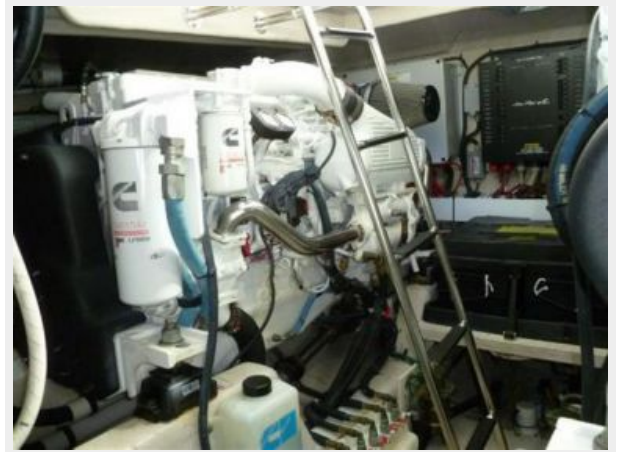
Port Cummins Engine