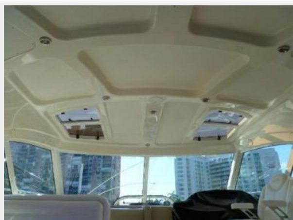
Hard Top with Port and Starb. roof vents