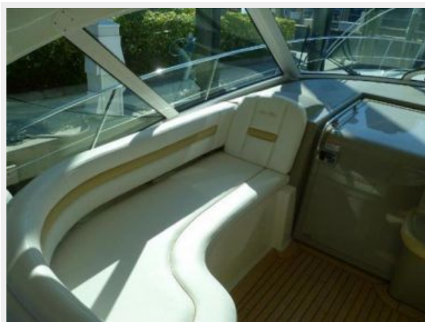
Port side cockpit lounge