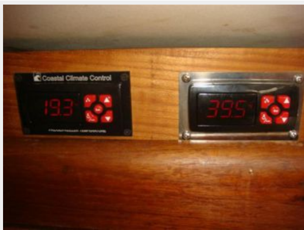
41' Hunter fridge-freezer controls