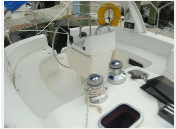
41' Hunter cockpit