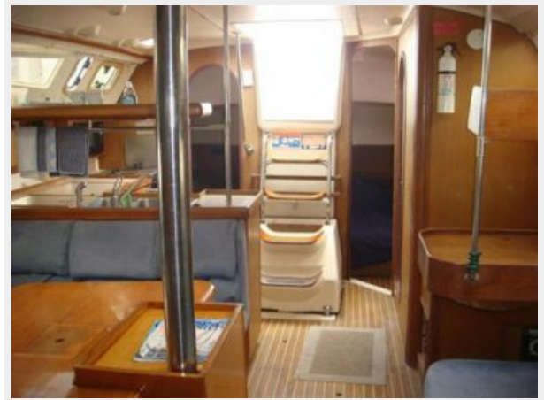
41' Hunter salon aft