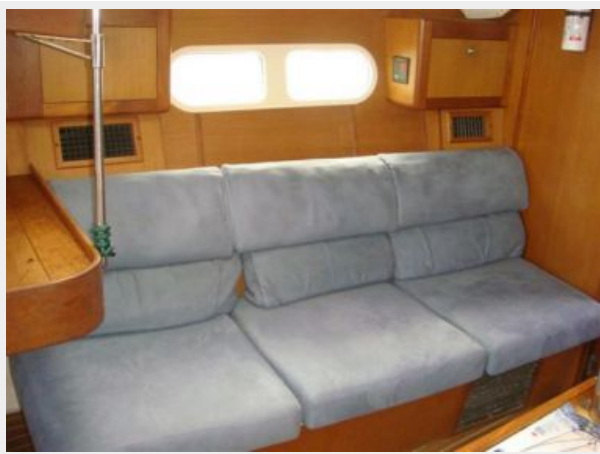
41' Hunter salon port seating