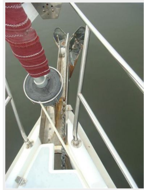
41' Hunter anchor