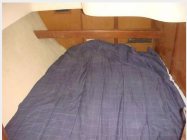
41' Hunter starboard aft stateroom