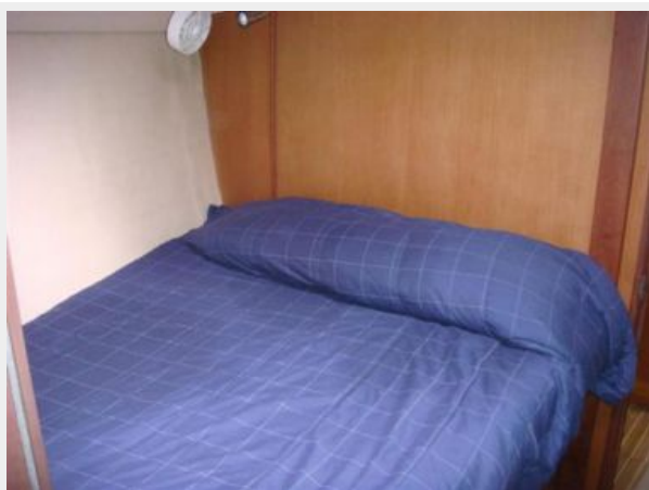
41' Hunter forward stateroom photo2