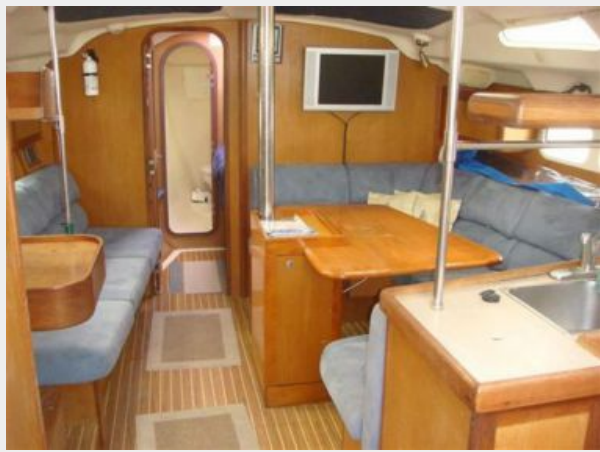
41' Hunter salon forward