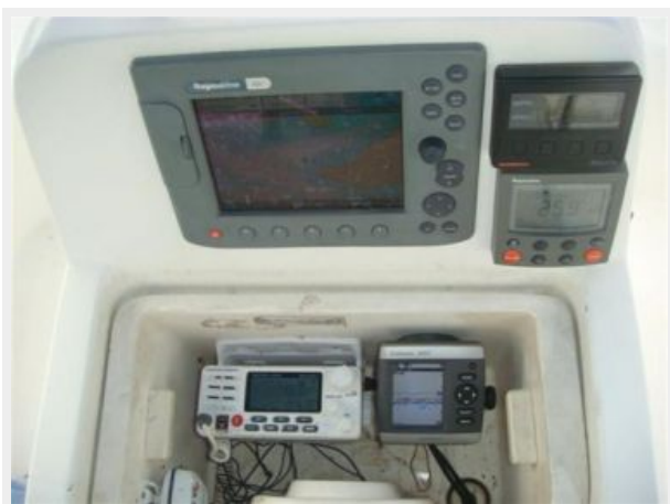
41' Hunter cockpit electronics