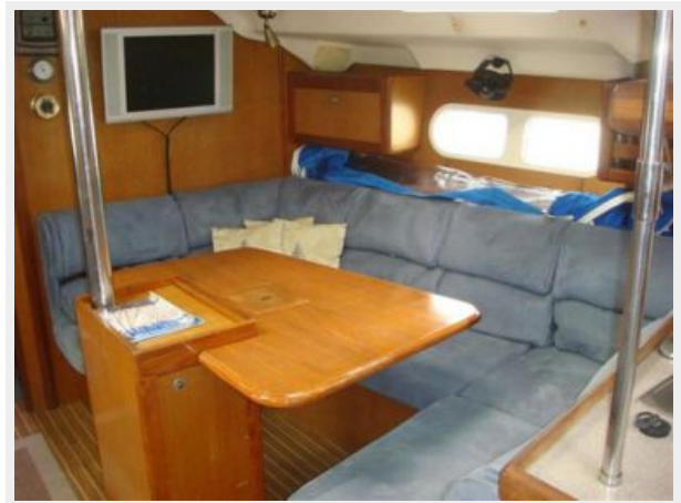
41' Hunter salon starboard seating photo1