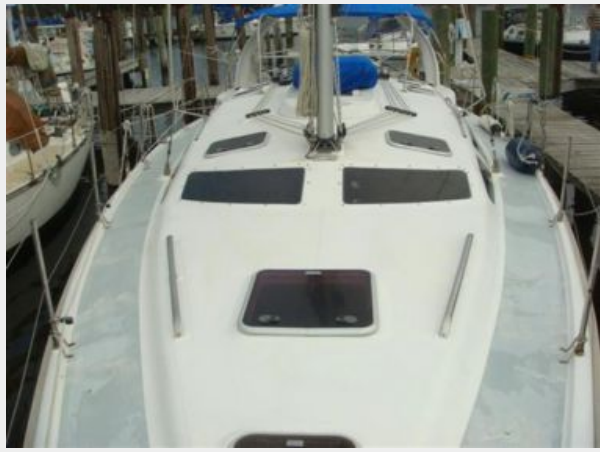
41' Hunter foredeck aft