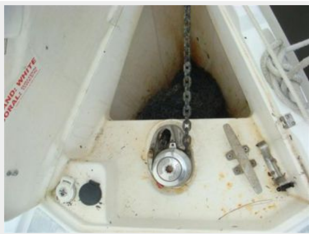
41' Hunter anchor windlass