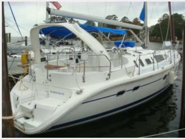
41' Hunter starboard aft profile