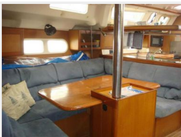
41' Hunter salon starboard seating photo2