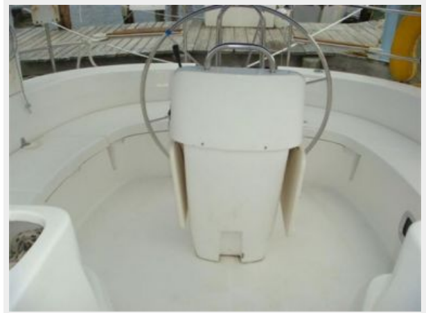
41' Hunter cockpit aft