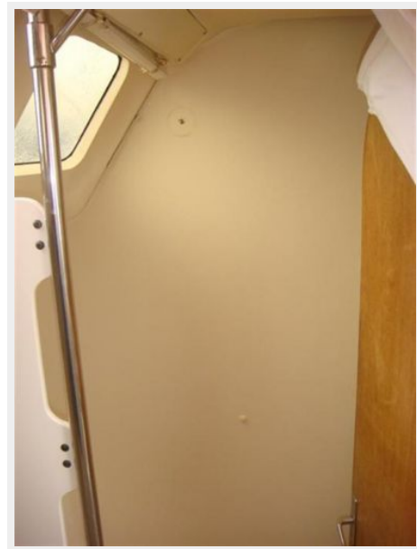
41' Hunter aft shower