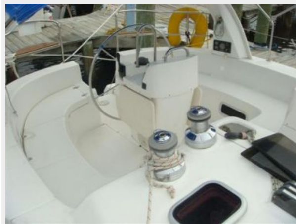
41' Hunter cockpit