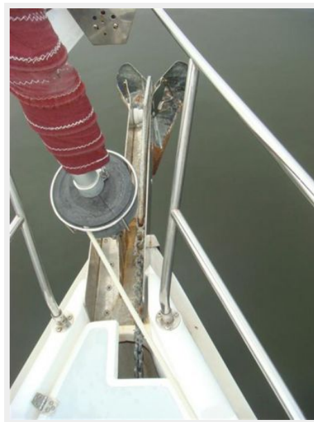
41' Hunter anchor