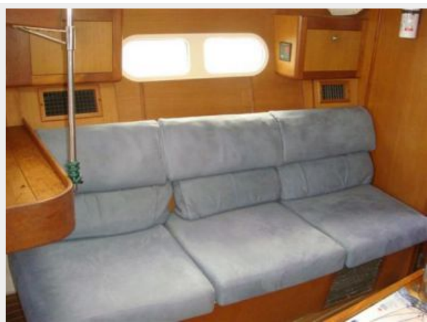
41' Hunter salon port seating