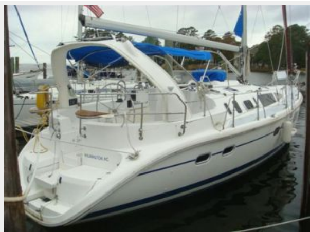
41' Hunter starboard aft profile