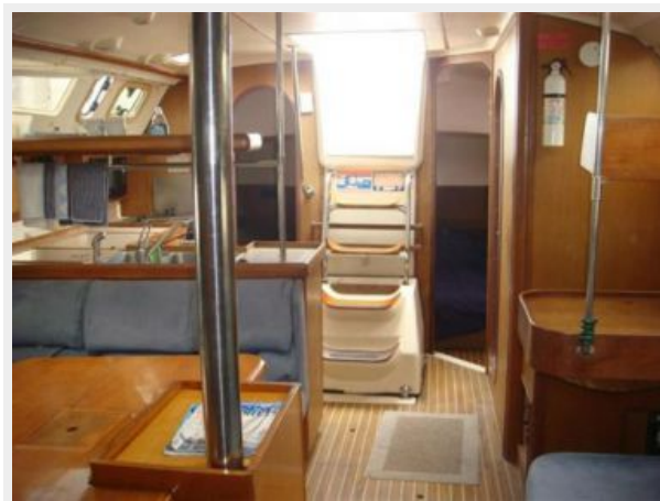
41' Hunter salon aft