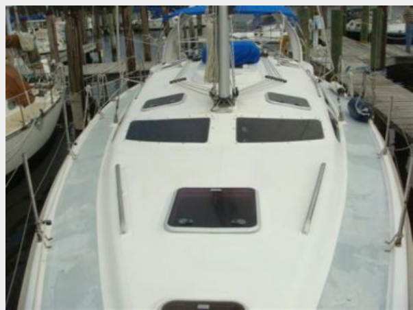
41' Hunter foredeck aft