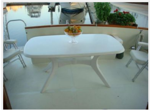
57' DeFever aft deck