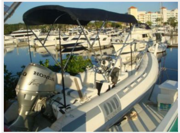
57' DeFever tender