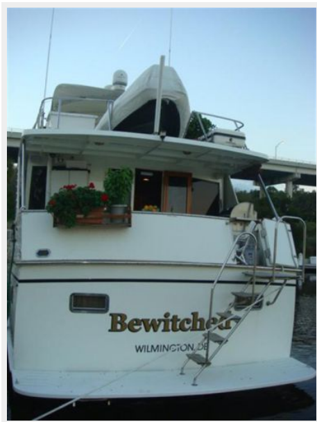
57' DeFever aft profile