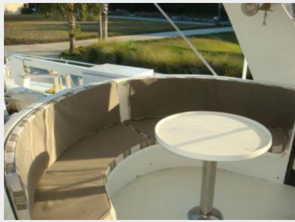
57' DeFever flybridge seating