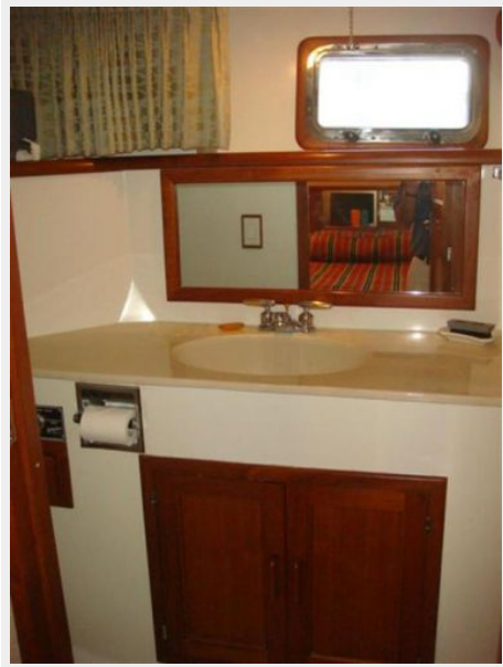
57' DeFever VIP guest stateroom head