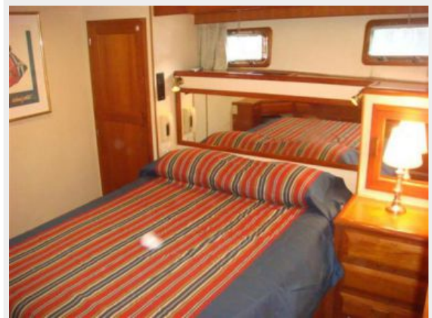
57' DeFever VIP guest stateroom