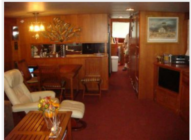
57' DeFever salon forward