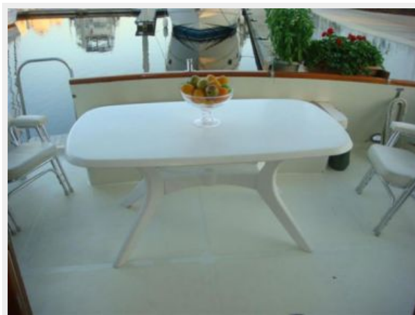
57' DeFever aft deck