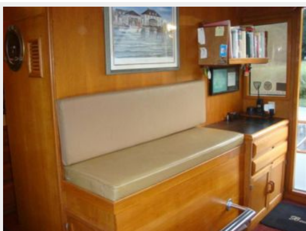
57' DeFever pilothouse helm