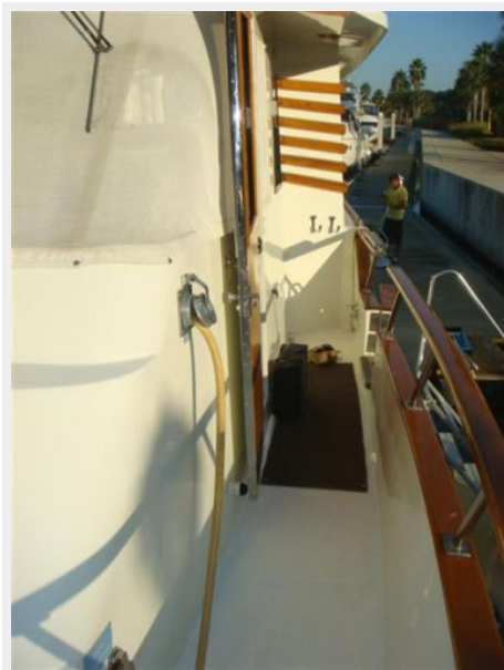
57' DeFever port side deck photo2