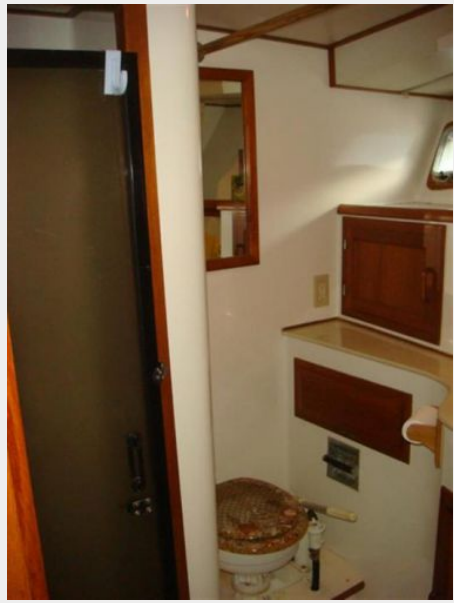
57' DeFever forward guest stateroom head