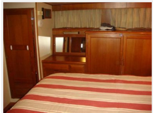
57' DeFever master stateroom head