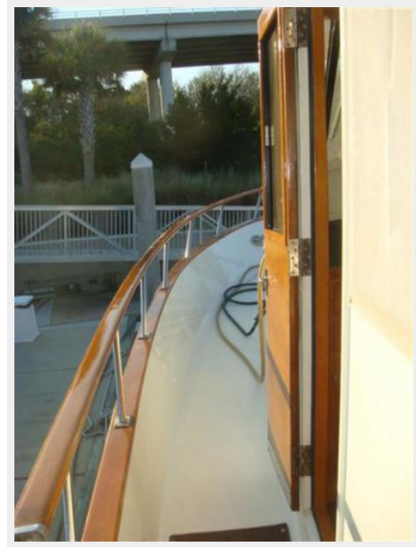
57' DeFever port side deck photo1