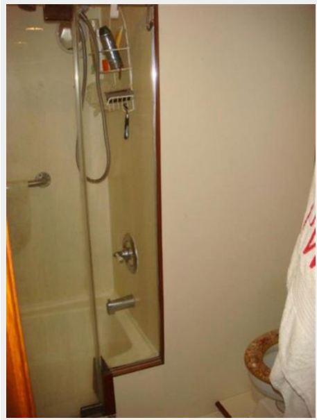
57' DeFever master stateroom shower