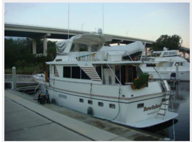
57' DeFever port aft profile