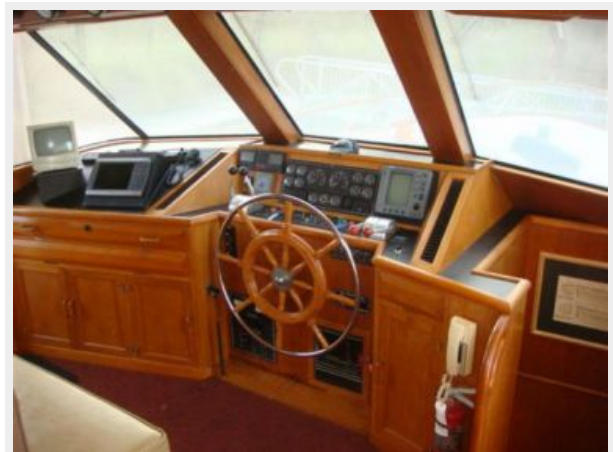
57' DeFever pilothouse forward