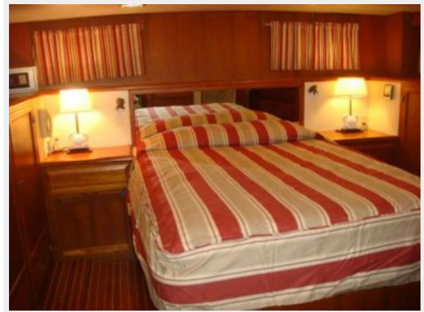
57' DeFever master stateroom