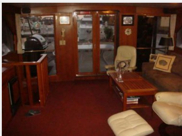
57' DeFever salon aft