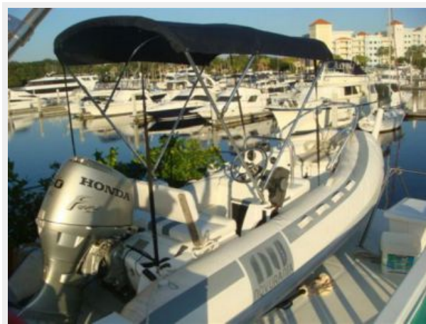
57' DeFever tender