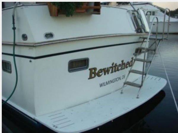
57' DeFever swim platform