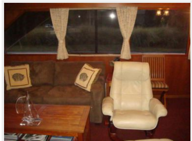
57' DeFever salon port