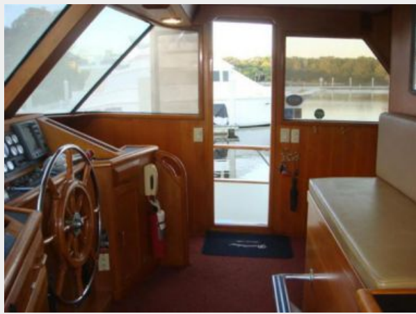
57' DeFever pilothouse starboard