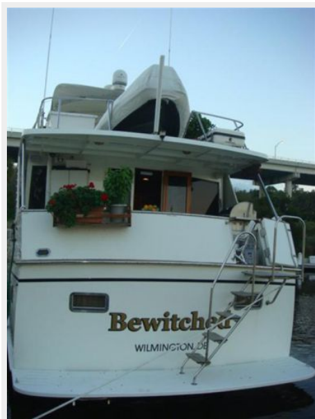
57' DeFever aft profile