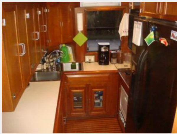
57' DeFever galley