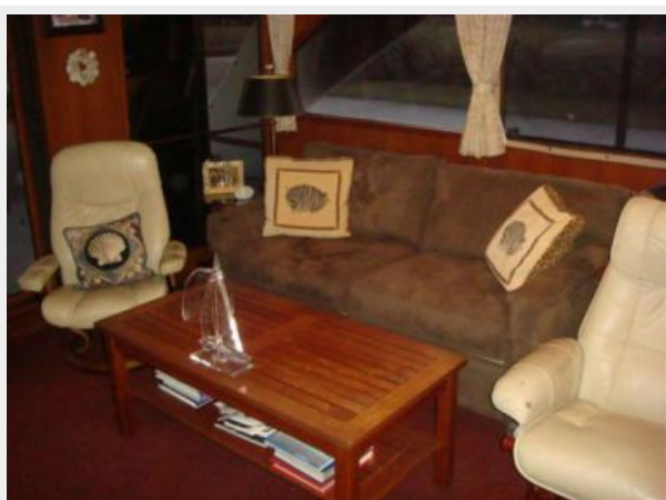
57' DeFever salon port seating