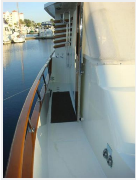
57' DeFever starboard side deck photo2