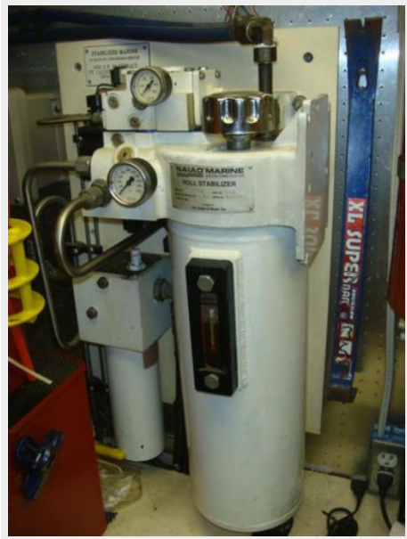
57' DeFever stabilizer system