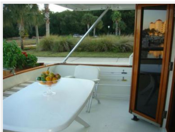
57' DeFever aft deck port