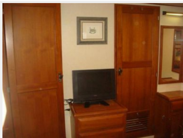
57' DeFever VIP guest stateroom starboard