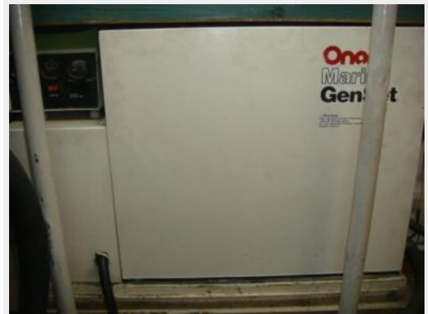
57' DeFever port generator sound box