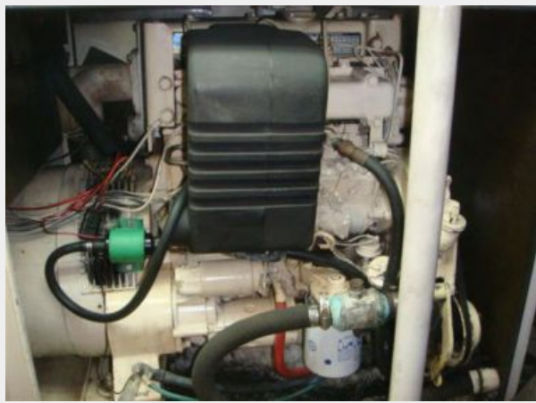
57' DeFever starboard generator