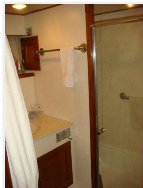
57' DeFever master stateroom head