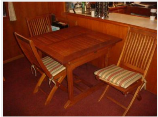
57' DeFever dining table