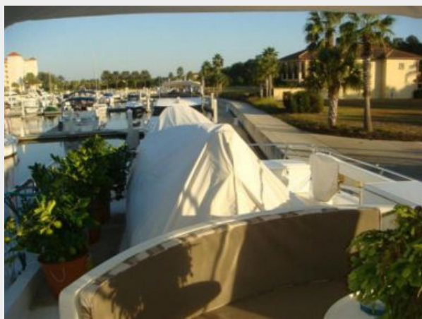
57' DeFever flybridge aft