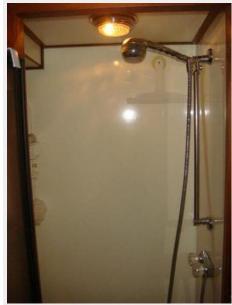
57' DeFever VIP guest stateroom shower