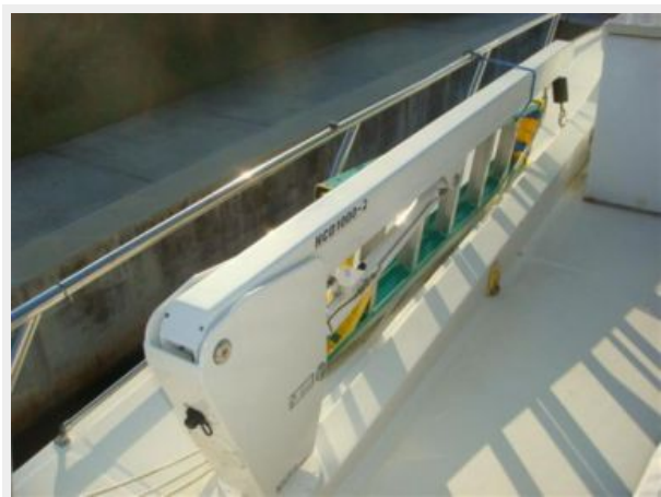
57' DeFever tender davit