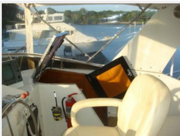
57' DeFever flybridge starboard