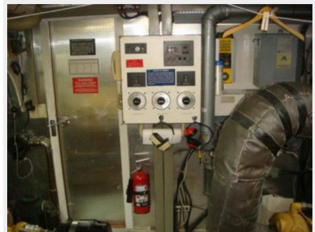
57' DeFever engine room aft