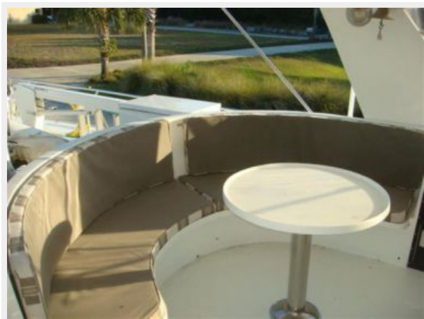
57' DeFever flybridge seating