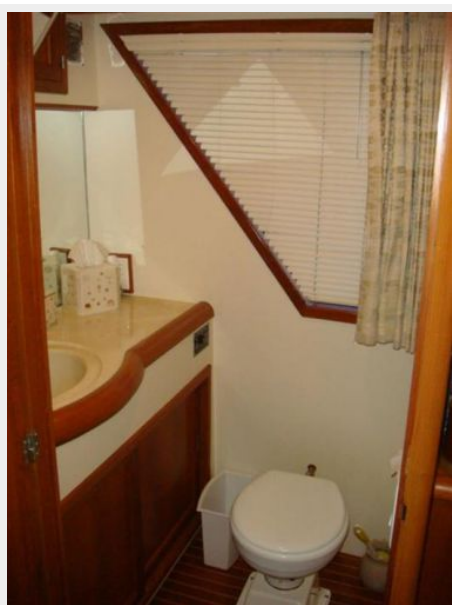
57' DeFever dayhead