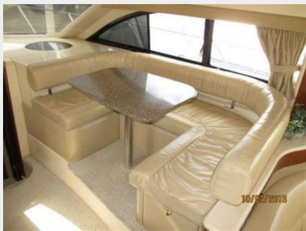
Dinette to Starboard