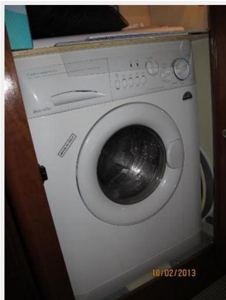
Washer Dryer Combi Unit