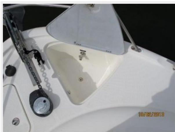
Raw Water Washdown