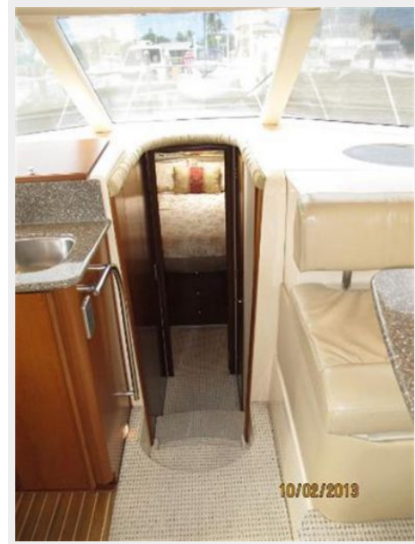
Gangway Down Below