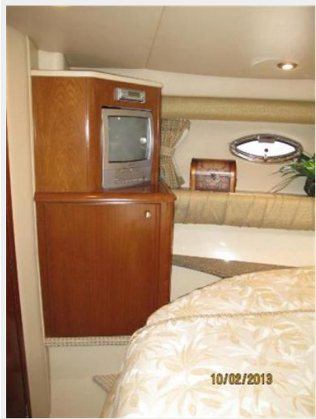
Master to Port