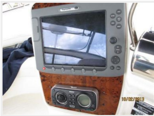
Upgraded Raymarine E120