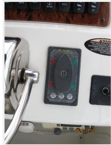
Bow and Stern Thrusters