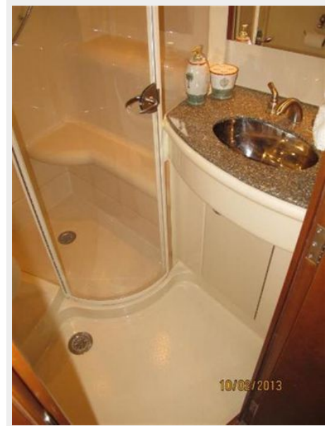
Ensuite Master Head