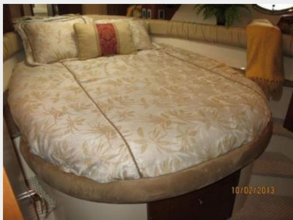
Master Island Queen