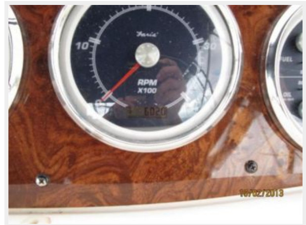
Starboard Engine Hours