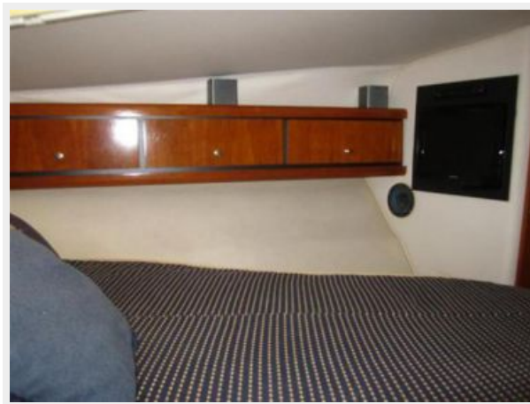
Main Cabin - Newer Flat Screen TV