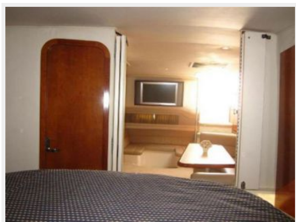
Main Cabin Looking Aft