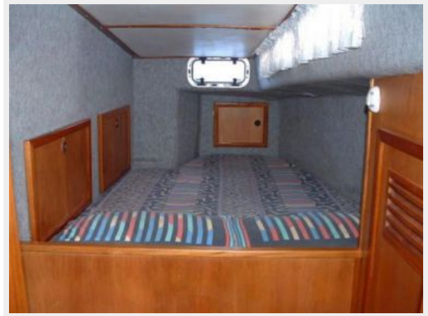
Port Aft Cabin