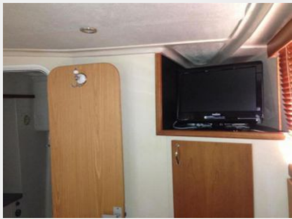
Aft Stateroom Entertainment