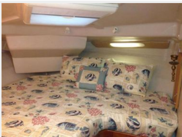
Forward Stateroom Berth