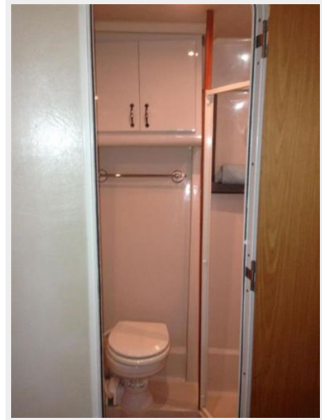
Aft Stateroom Head