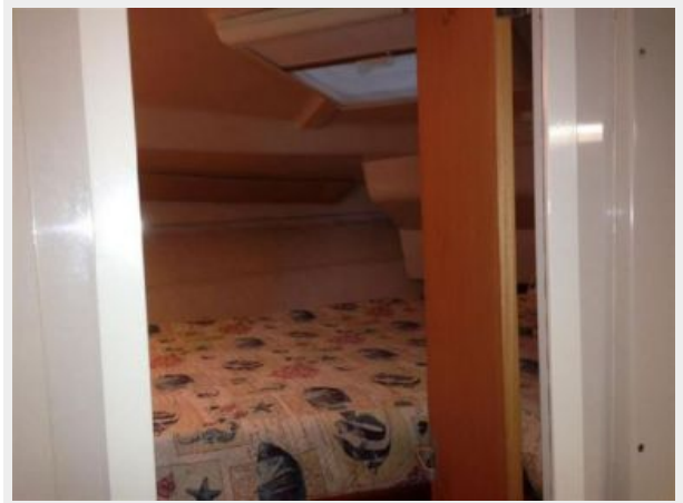
Forward Stateroom from Door