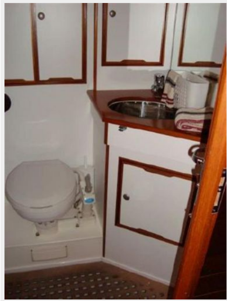
Guest head and shower