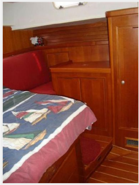
Master stateroom storage