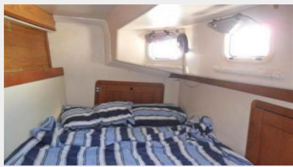
Aft Cabin - Starbd