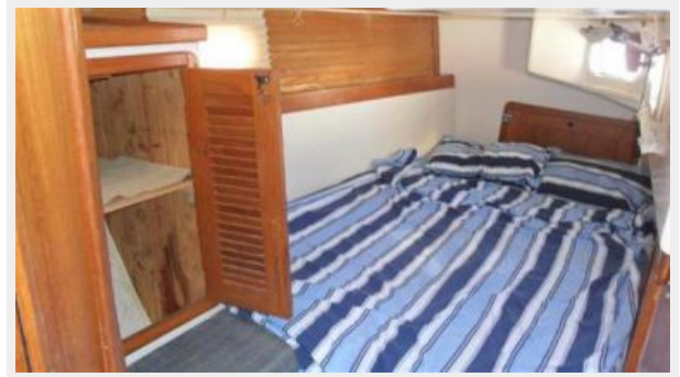
Aft Cabin -Port