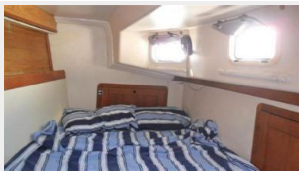
Aft Cabin - Starbd