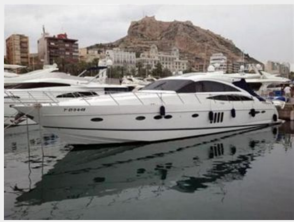
Profile of boat at dock Starboard Side