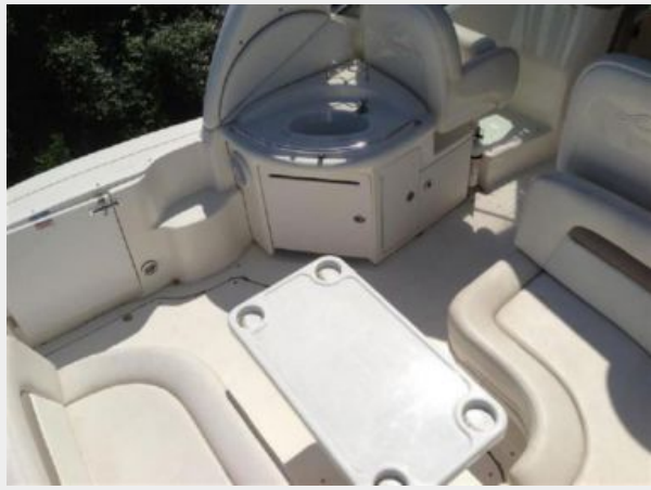
Wet bar - Aft seating