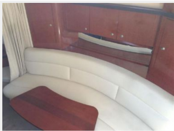
Settee - Facing toward starboard