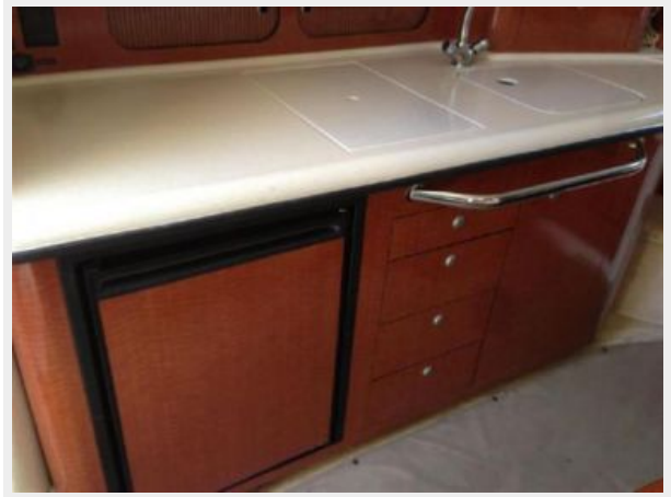
Galley - Facing toward port