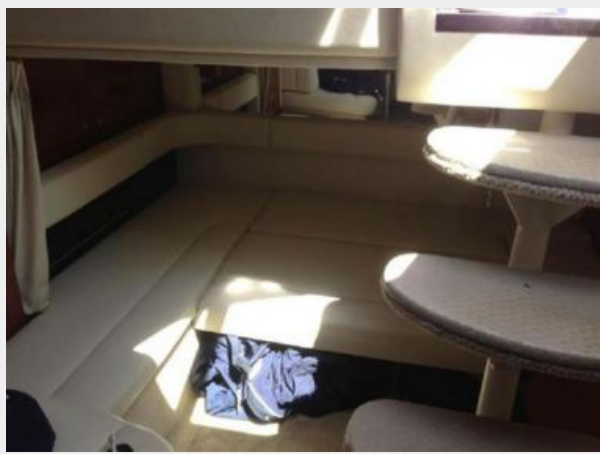
Aft Seating area - Berth