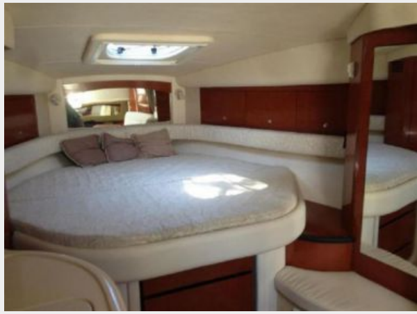
Berth - facing forward