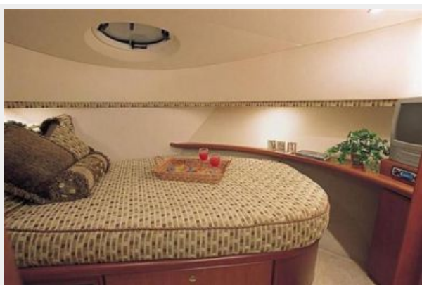
Forward Stateroom