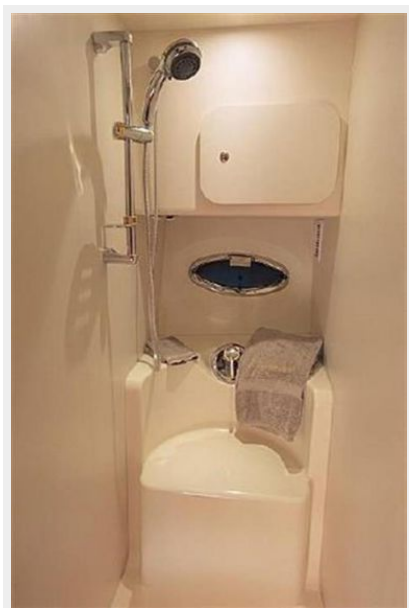
Manufacturer Provided Image: Shower