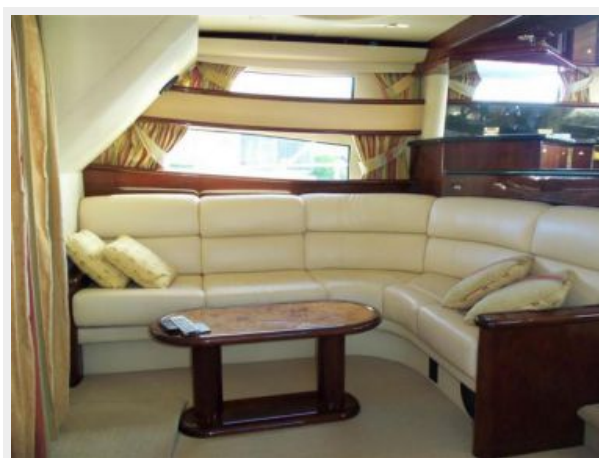
Salon Looking to Port