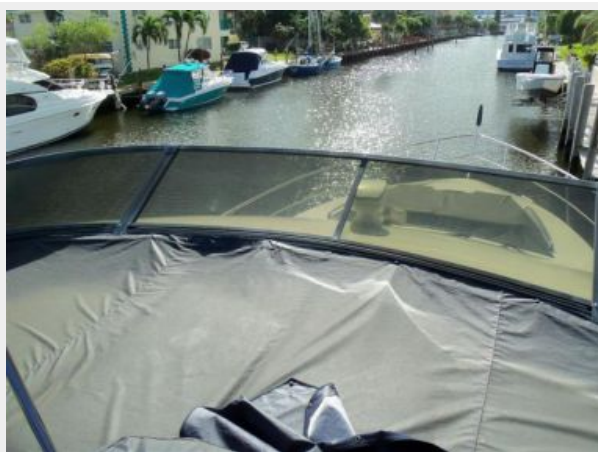
Flybridge Seating Forward