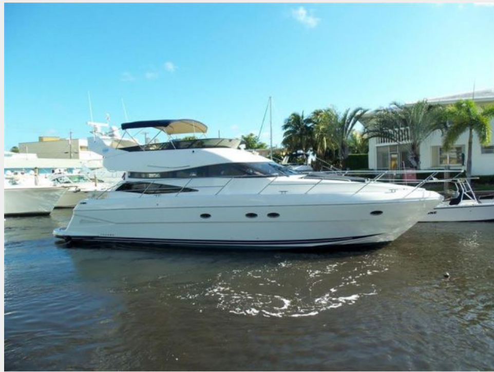
TABLE 4 SEVEN — NEPTUNUS