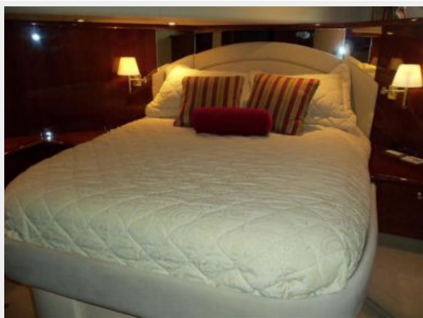
Master Looking Aft