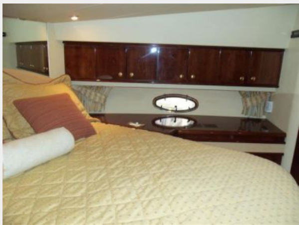
VIP to Starboard