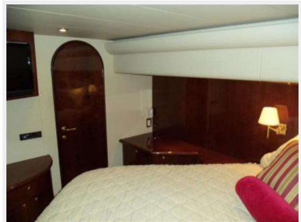
Master Looking Starboard