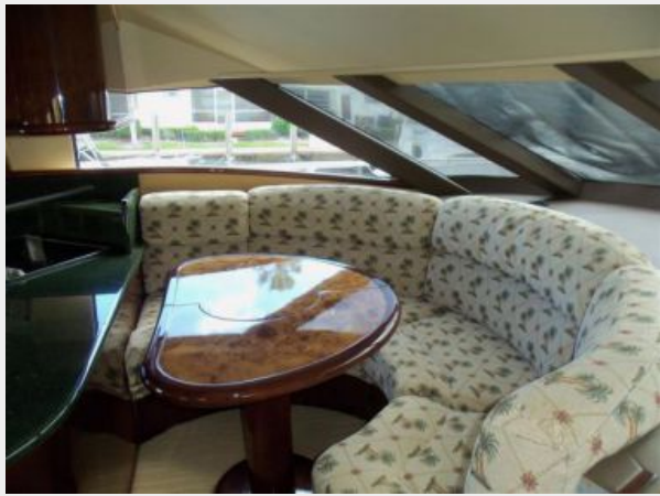
Dinette Table Open