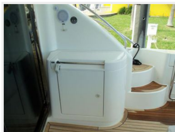
Aft Deck Bar