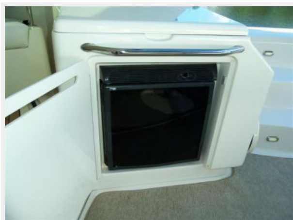
Lower Cockpit Drink Fridge