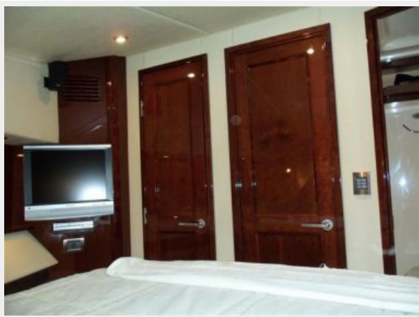
VIP to Starboard