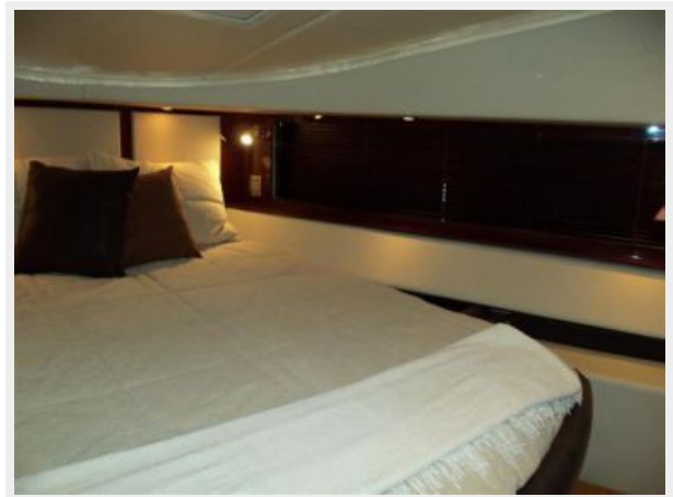
VIP to Port