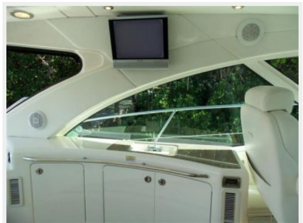
Upper Deck Bar & TV