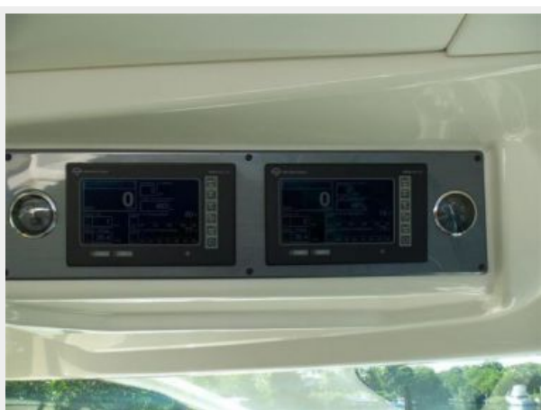
MAN Screens Overhead