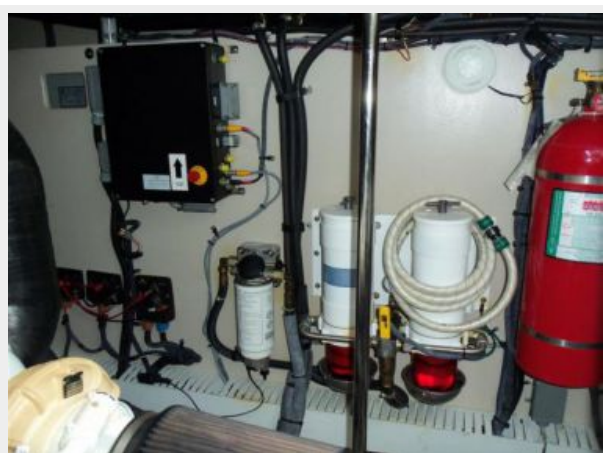
Engine Room Forward