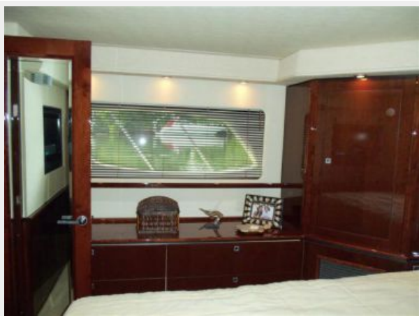
Master to Starboard